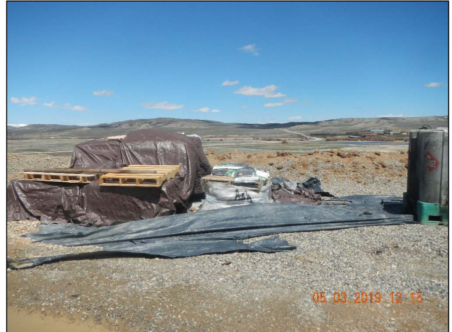
Photo 11. Uncovered additives.