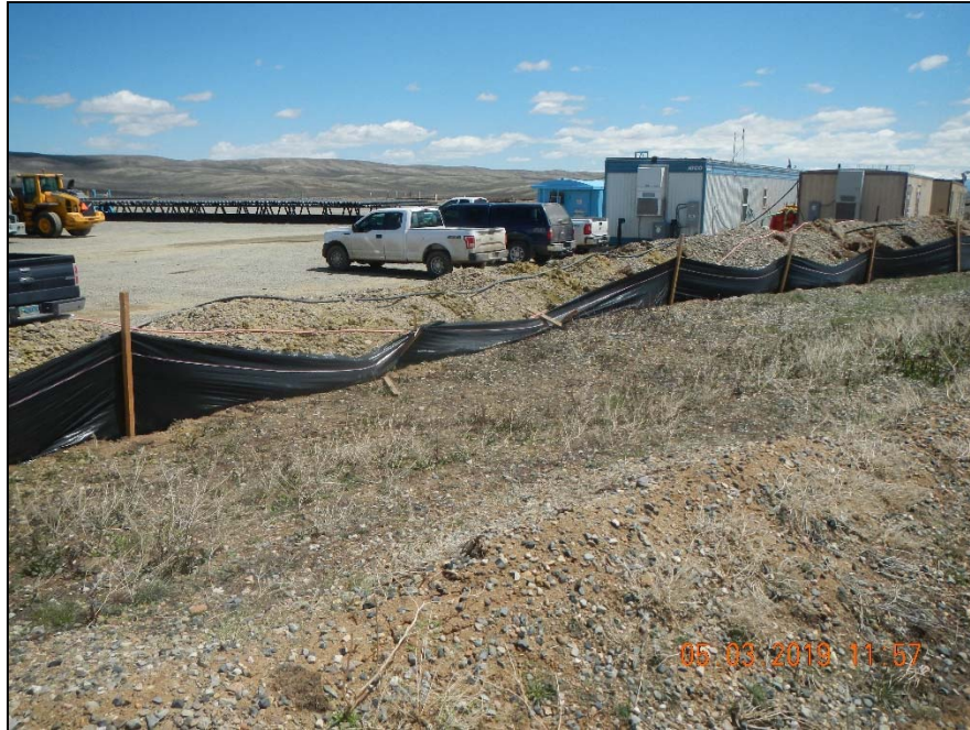
Photo 2. Silt fence compromised.