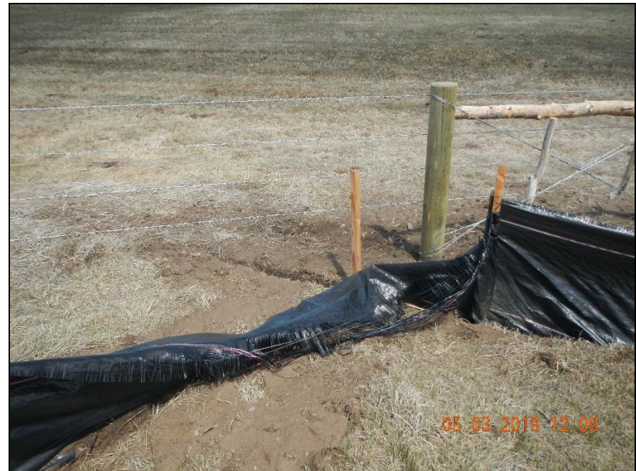
Photo 7. Silt fence compromised. Sediment leaving location.