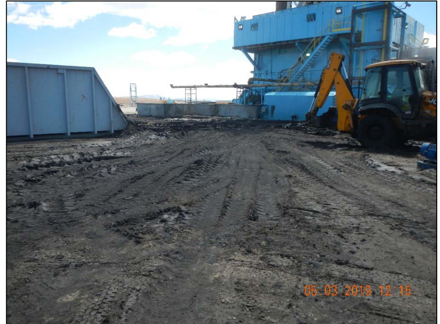
Photo 13. Cuttings area.