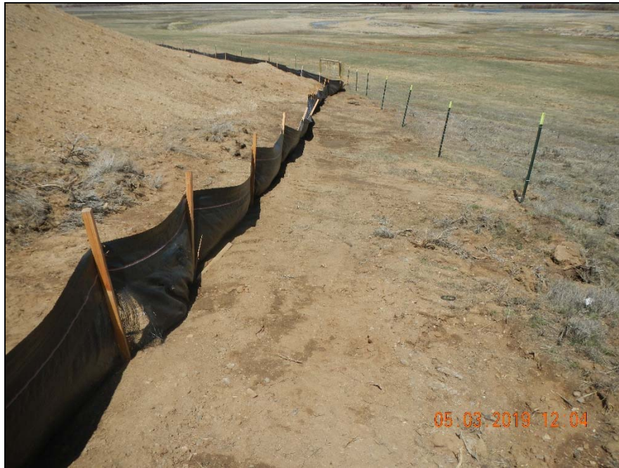
Photo 4. Silt fence compromised.