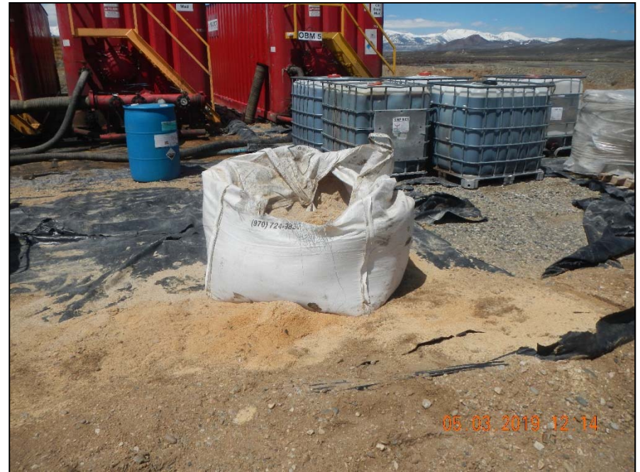
Photo 9. Uncovered additives.