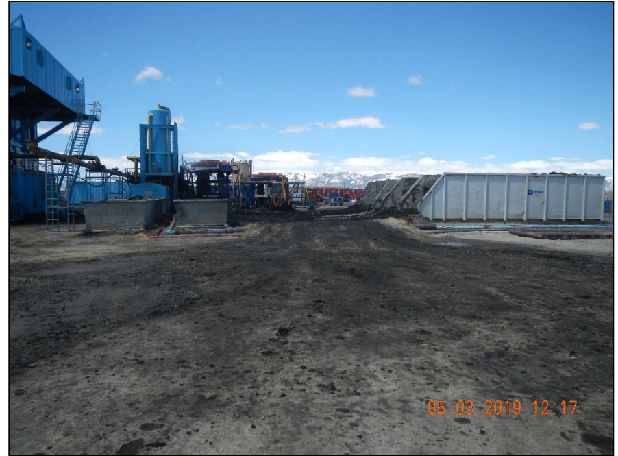
Photo 15. Cuttings area, cuttings leaving area.