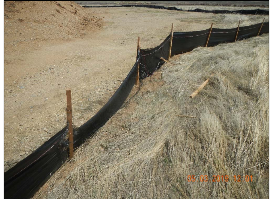
Photo 3. Silt fence compromised.