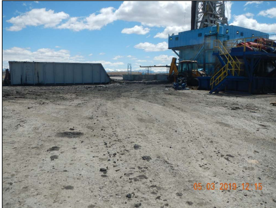
Photo 12. Cuttings area, cuttings leaving area.