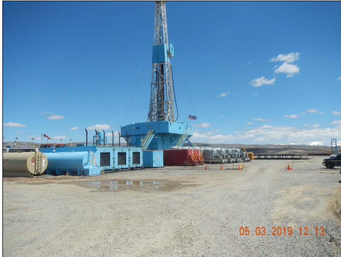
Photo 1. Overview of location taken at entrance facing northeast.