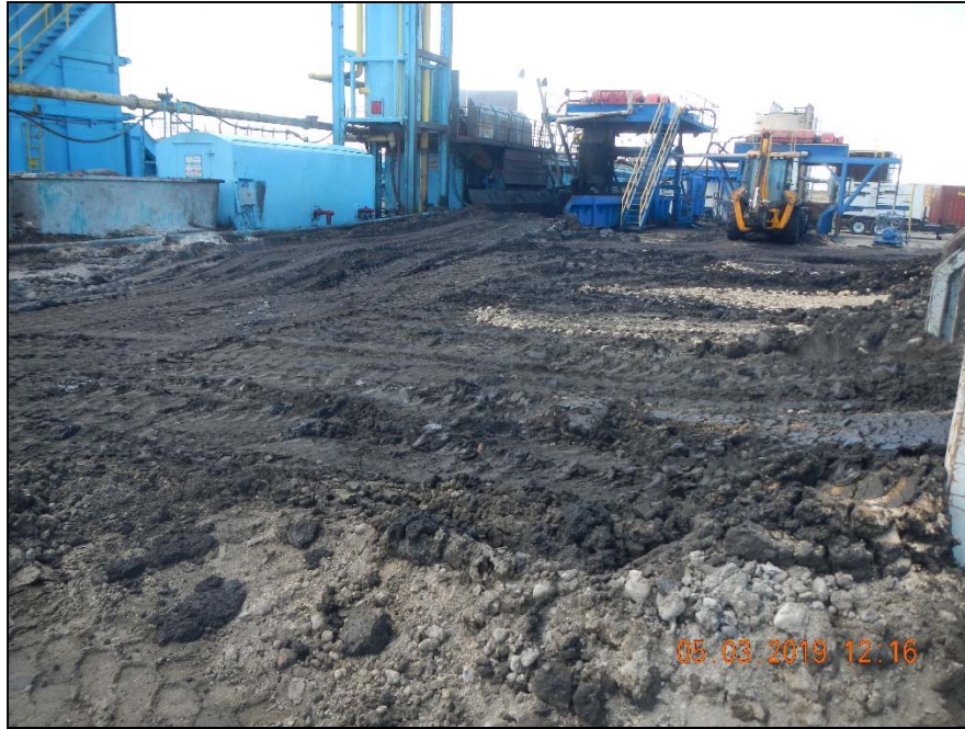
Photo 14. Cuttings area.