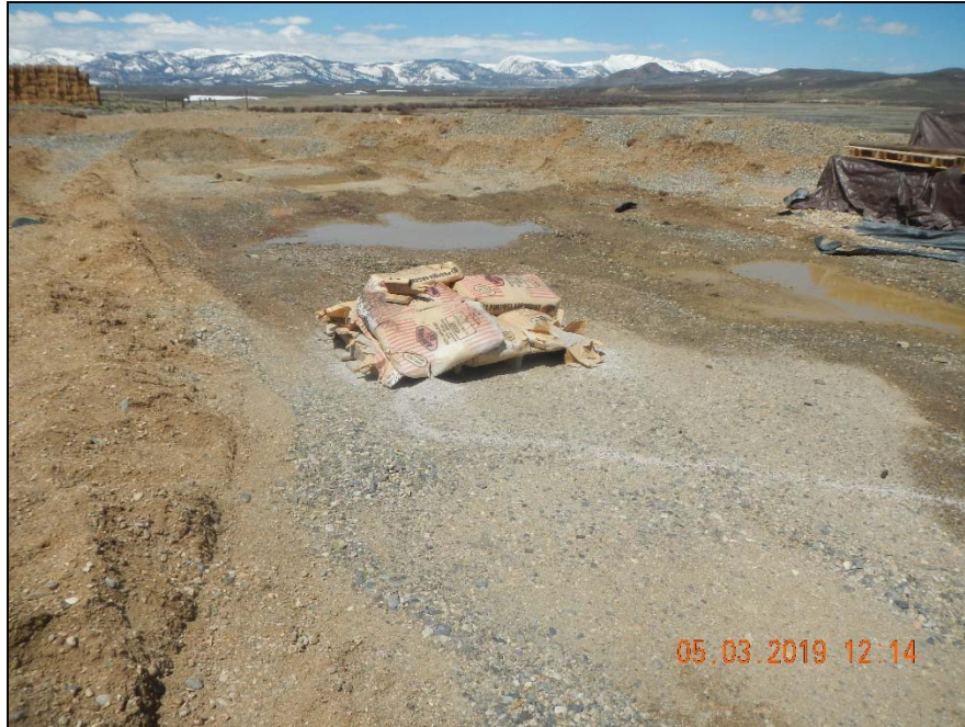
Photo 10. Uncovered additives.