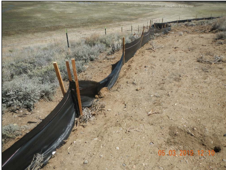
Photo 6. Silt fence compromised.