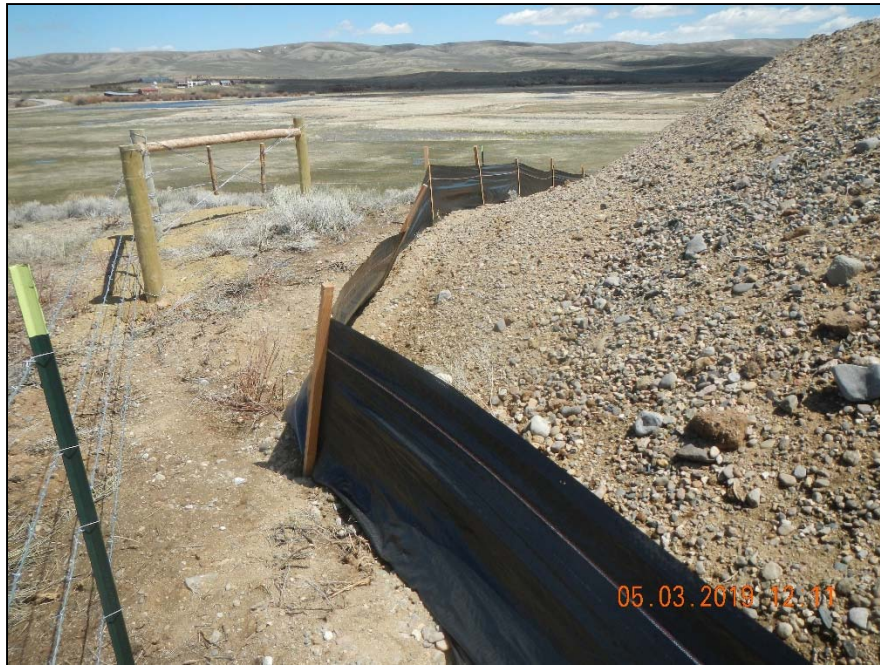
Photo 8. Silt fence compromised.