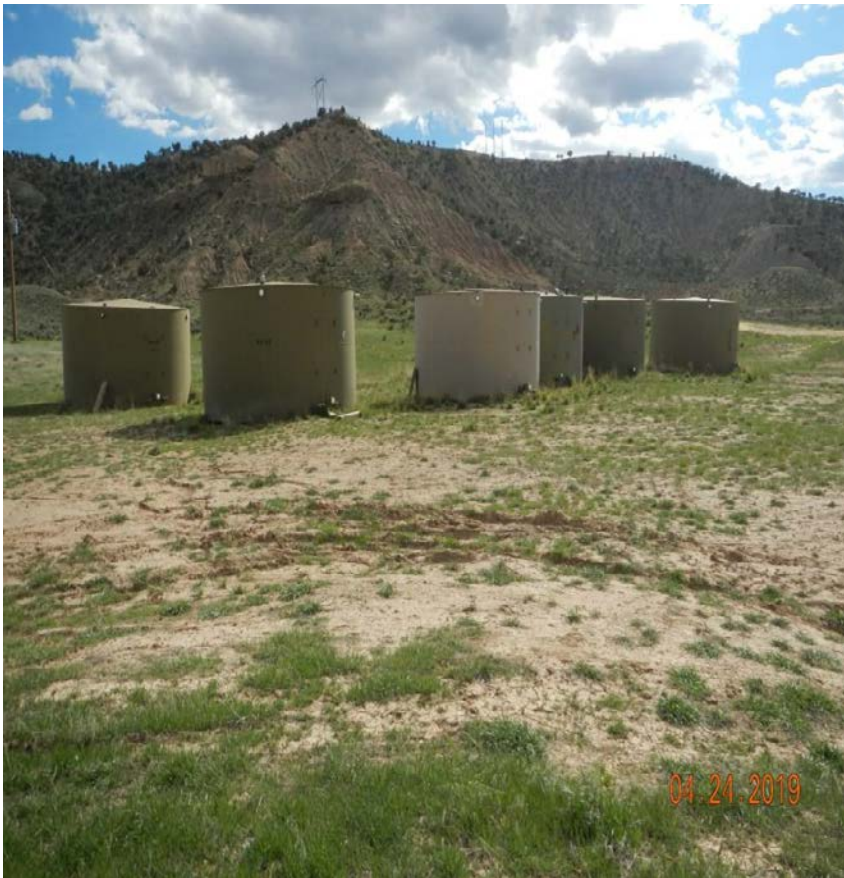
Photo#1: Eight tanks stored in area, East of, & adjacent to access road entry. View to Southwest.