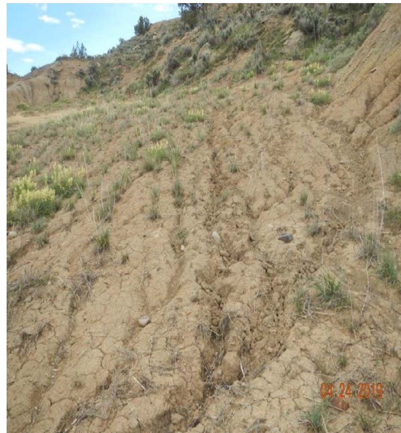
Photo#8: Sediment migration and erosion should be closely monitored.