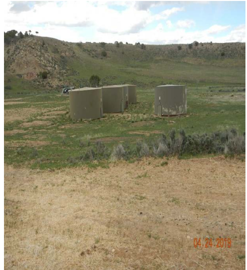
Photo#2: Eight tanks stored in area, East of, & adjacent to access road entry View to Southeast.