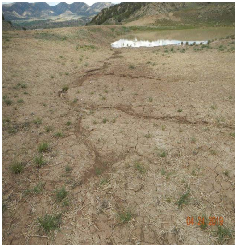
Photo#7: Sediment migration and erosion should be closely monitored.