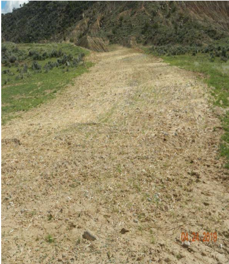
Photo#3: View over access road entry to South. Emerging vegetation can be seen.