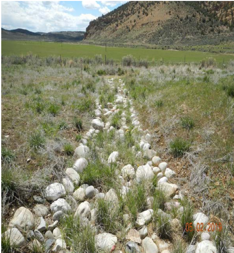
Photo#5: The stormwater controls on the Original section of site are functioning.