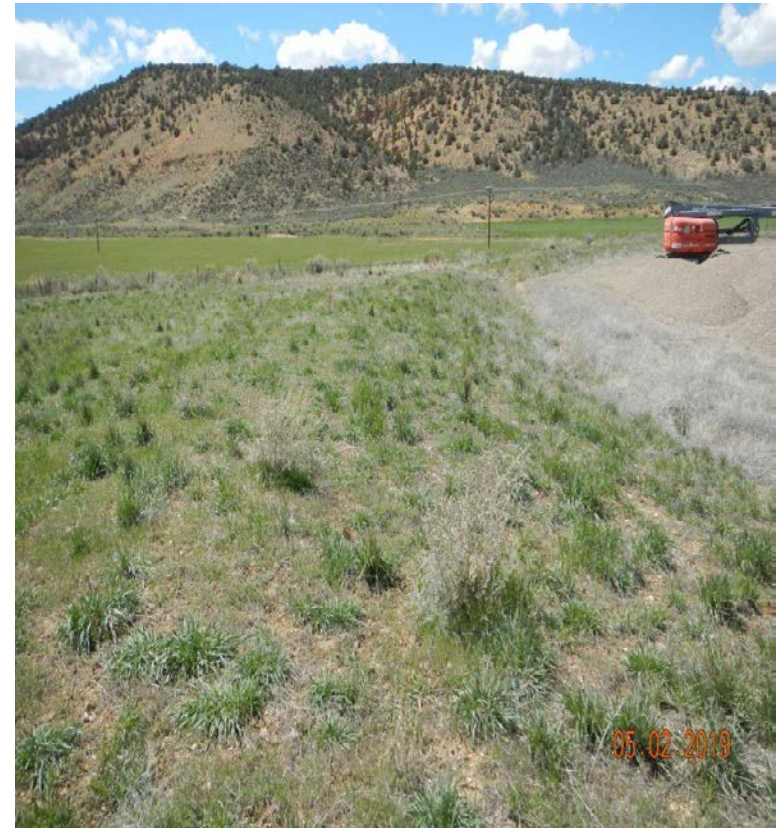
Photo#6: The stormwater controls on the Original section of site are functioning.