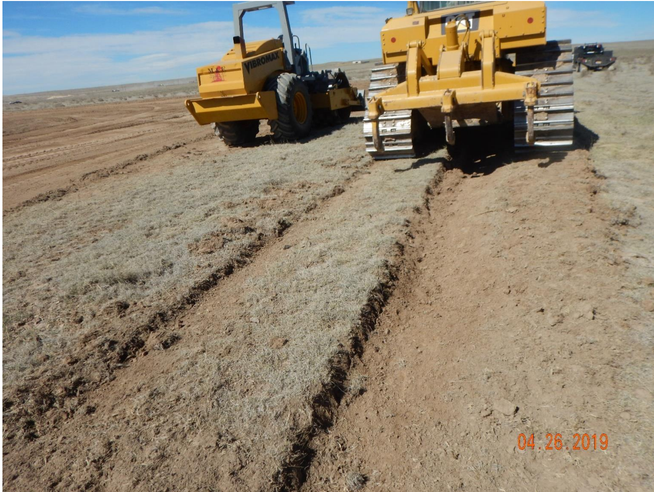
Photo 4: See comments under photo 1. Stormwater ditch does not appear to have been installed in accordance with good engineering practices; ditch appears to have been cut with a vertical grade. BMP will need to be updated once pad construction has been completed.