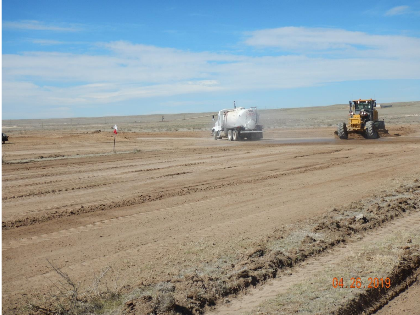
Photo 5 Photo shows operator utilizing a water truck to mitigate fugitive dust on location and access road.