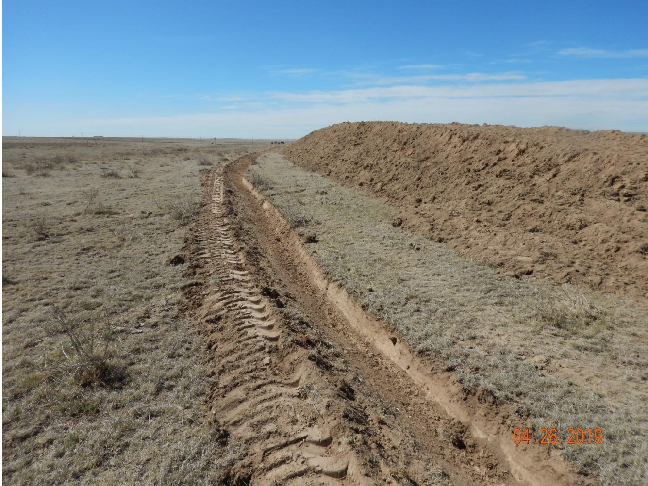
Photo 6: Photo taken from northeast corner of the location, facing south. Photo shows perimeter ditch and soil stockpile. Topsoil salvage in process at time of inspection.