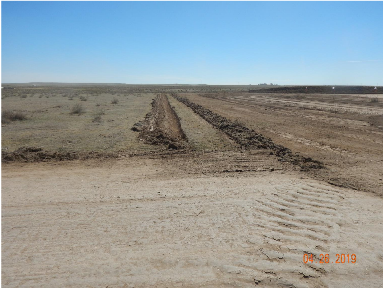
Photo 1: Photo taken from the south end of the location, facing east. Photos 1-4 provide an overview of the location from east, southeast, southwest to west. Photos show construction in process. Photo also shows operator has installed a stormwater ditch along the perimeter of the disturbance area.