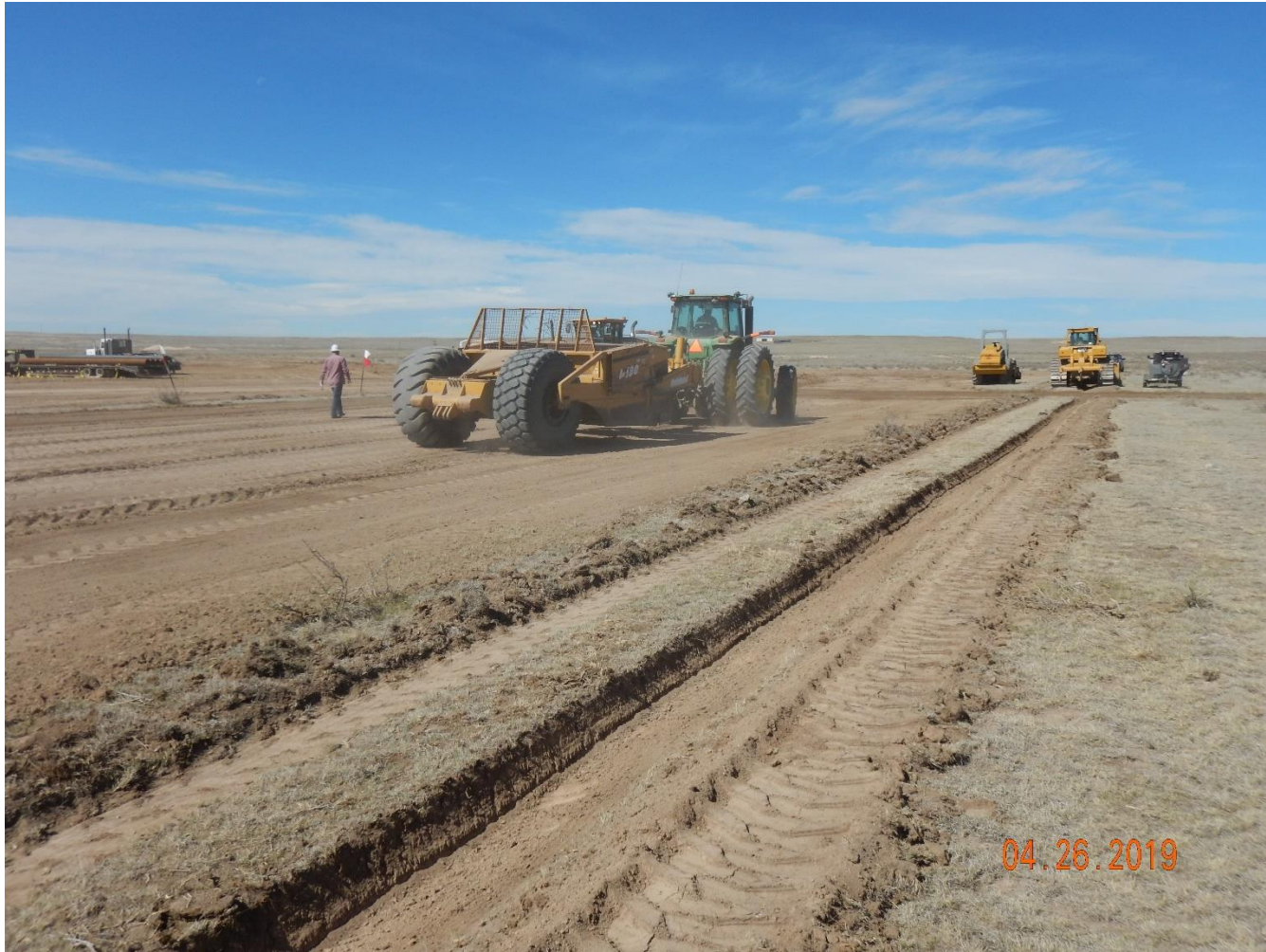
Photo 7: Photo taken from northeast corner of the location, facing west. Photo shows scraper being used to salvage soil from location.