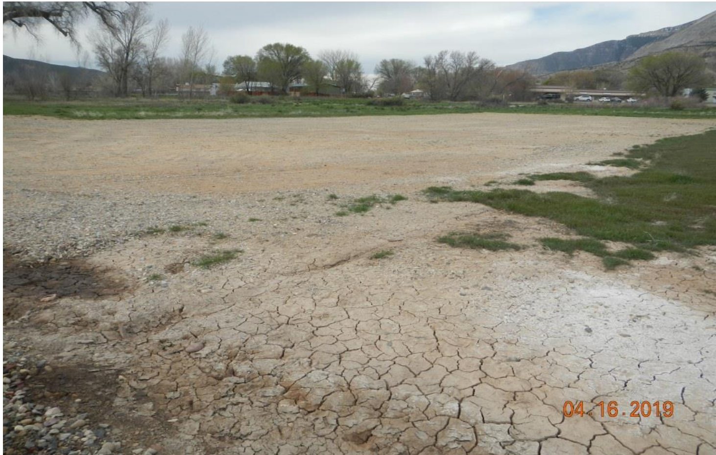
Photo#10: What was parking, staging area during Construction phase.