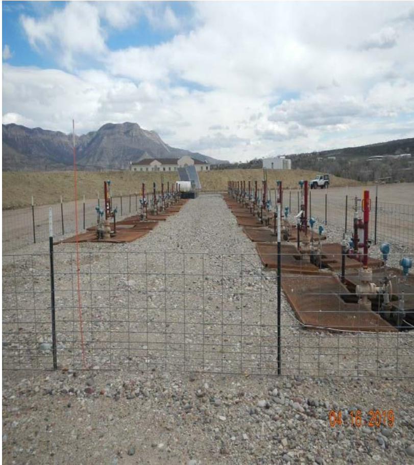
Photo#2: View over Well line up; no wildlife escape boards installed.