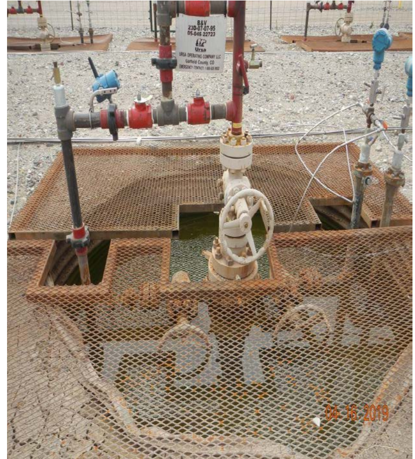
Photo#3: Three Cellars filled with water; no wildlife escape boards installed.