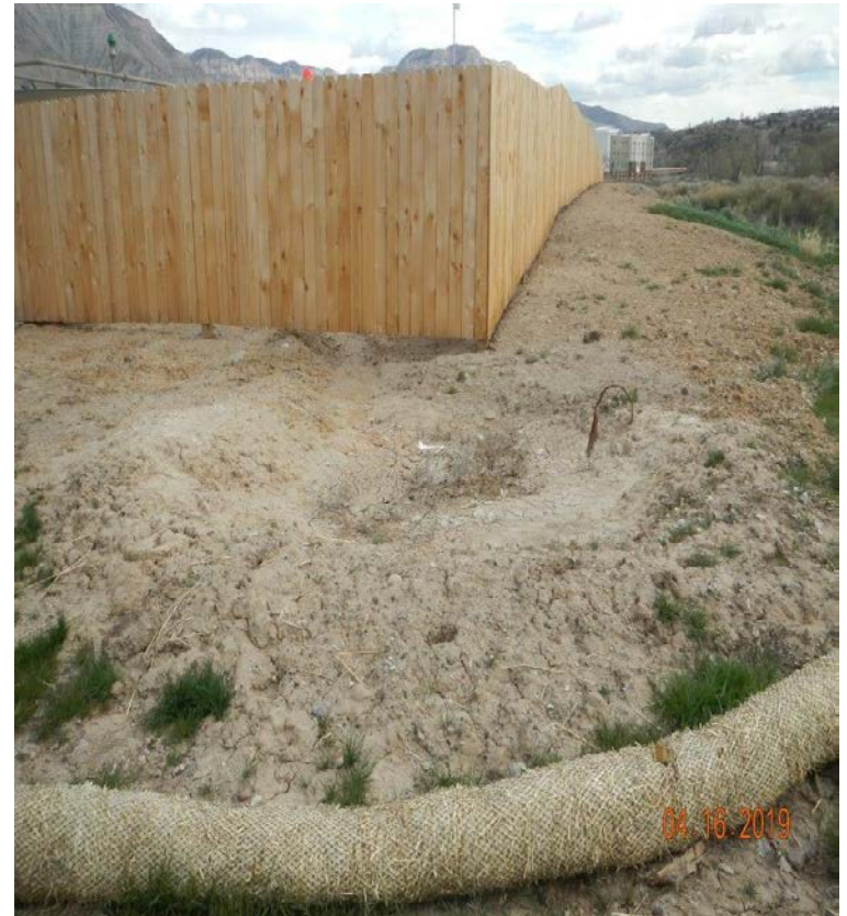
Photo#5: Sediment trap & drain at South corner of Location needs maintenance.