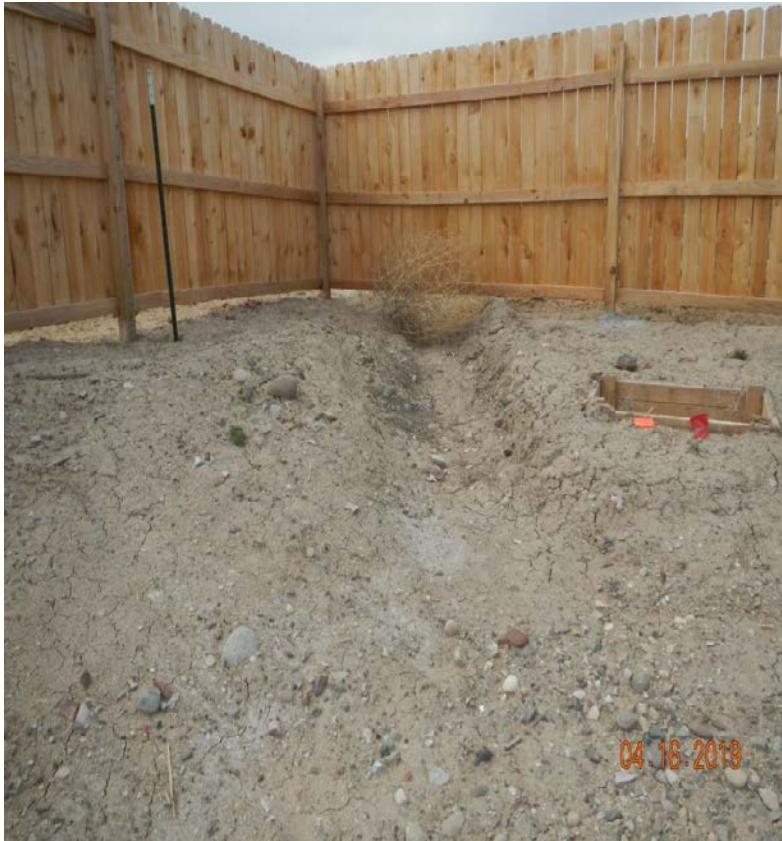
Photo#4: Sediment trap & drain at South corner of Location needs maintenance.