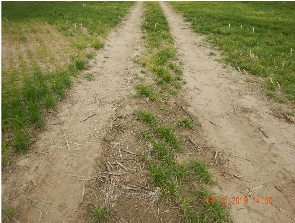
Photo 6. Photo taken from the western access road, facing East. See comments under Photo 1.