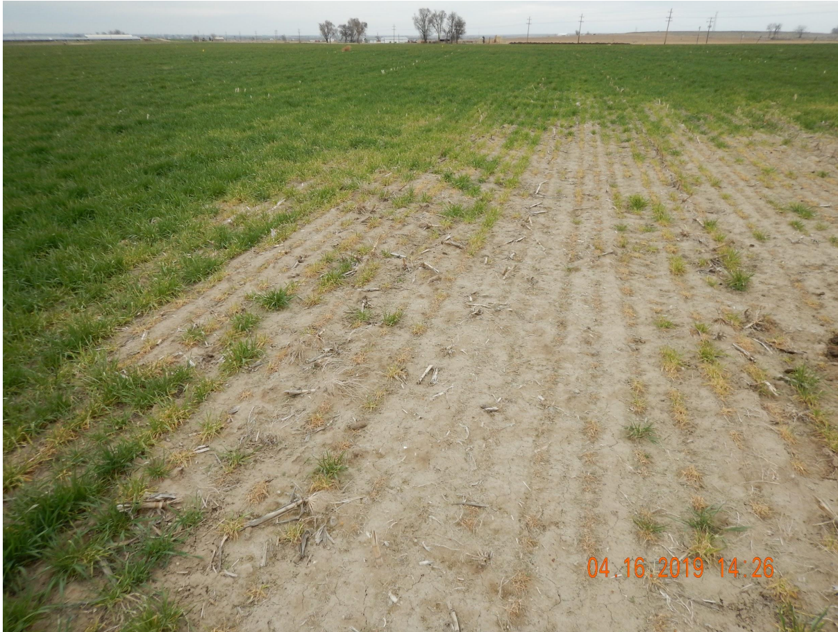
Photo 1. Photo taken from the western well location, facing North. Photo illustrates crop failure which is not representative of reference crop areas.