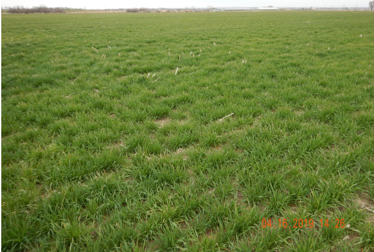
Photo 8. Reference photo taken north of the well location, facing North. Disturbance areas are not reflective or reference crop areas.