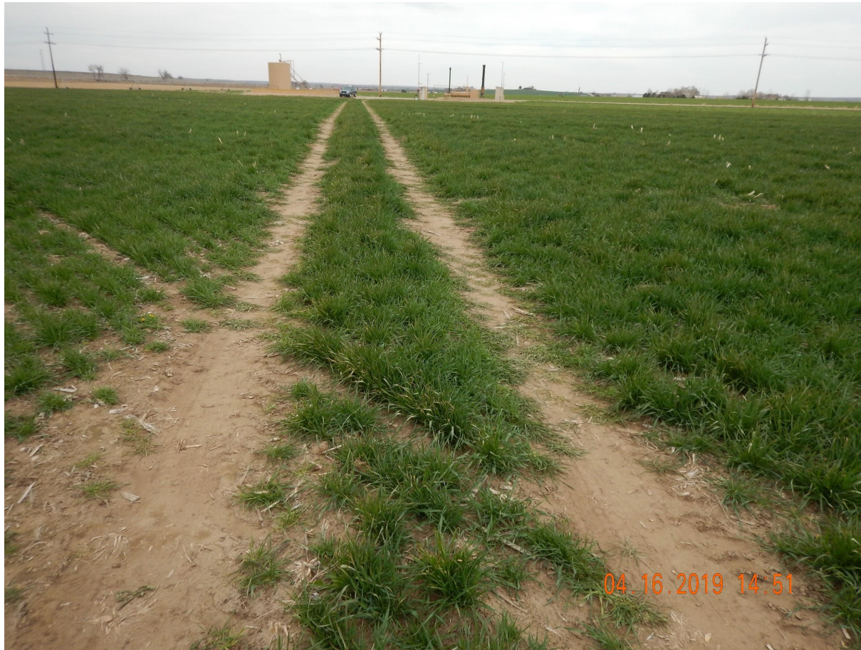
Photo 7. Photo taken along a portion of the access road, facing East. See comments under Photo 1.