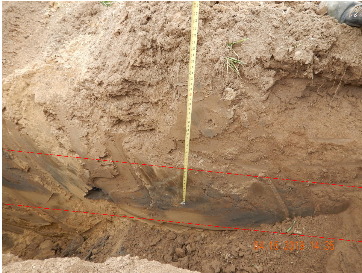
Photo 4. Photo taken from a trench dug around the well location. Photo illustrates what appears to be an impervious layer observed approximately three feet below the surface.