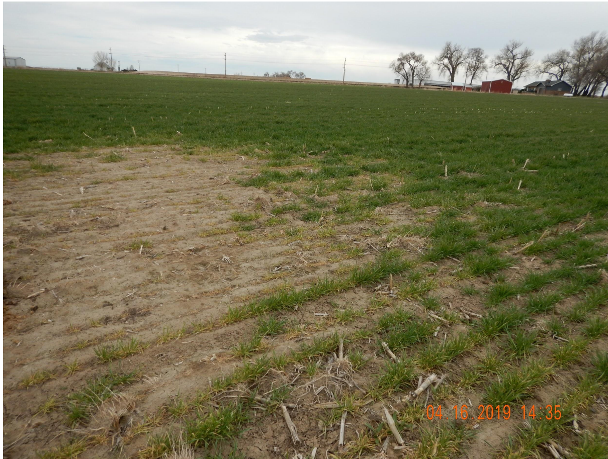
Photo 3. Photo taken from the western well location, facing South. See comments under Photo 1.