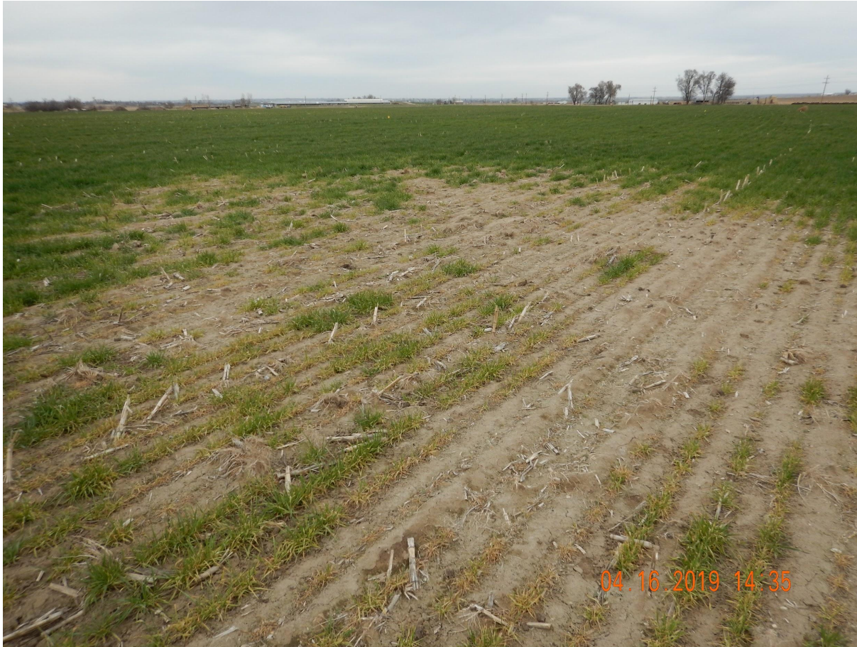
Photo 2. Photo taken from the central well location, facing Northwest. See comments under Photo 1.