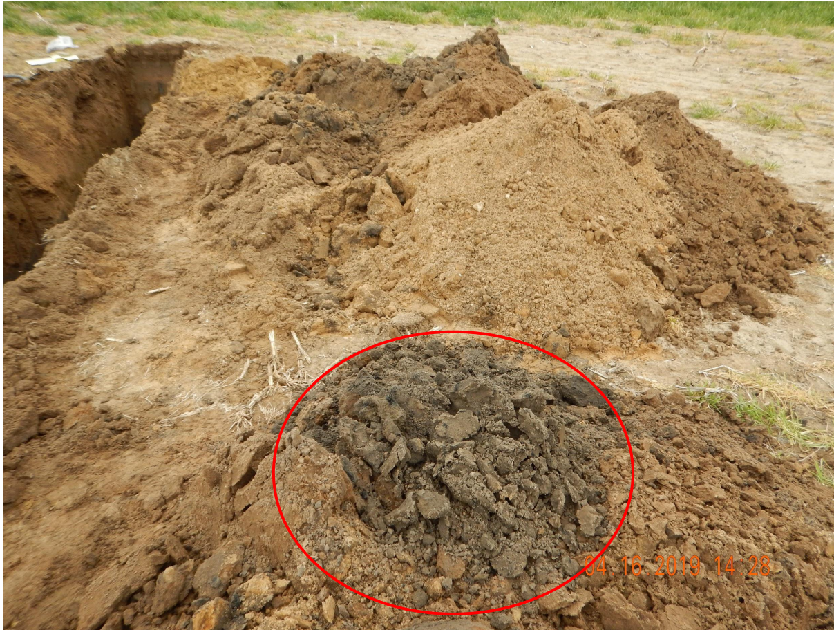
Photo 5. Photo illustrates soil taken from what appears to be an impervious soil layer observed approximately three feet below the surface.