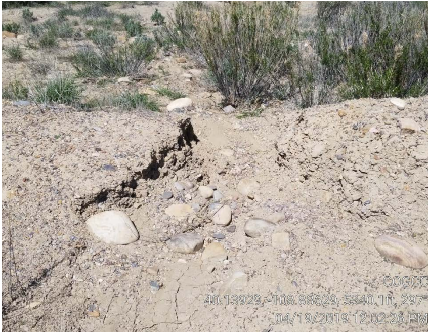
Photo 3. Breached stormwater edge berm on northwest edge of location.