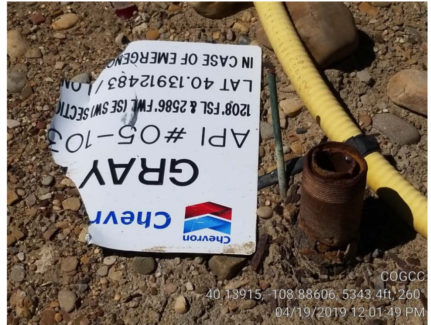
Photo 2. Unused sign & uncapped riser.