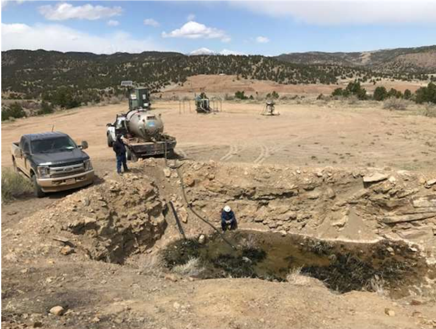
PHOTO 4: THE PRODUCED WATER WAS SENT BACK TO SURFACE WATER DISCHARGE AND THE WATER THAT WAS IN THE PIT WAS REMOVED USING A WATER VAC TRUCK ON 04/10/19.

APACHE CANYON 35-05 API# 05-071-08542 – TIMBER CREEK OGCC OPERATOR NUMBER 10672 - DATE: APRIL 10, 2019 CORRECTIVE ACTIONS COMPLETED REGARDING COGCC FIR DOCUMENT # 695100457