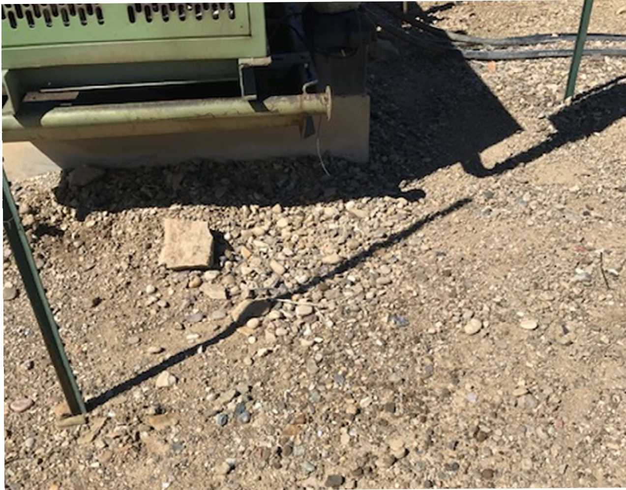
PHOTO 3: THE IMPACTED SOIL NEXT TO THE ENGINE SKID WAS CLEANED UP.

APACHE CANYON 35-05 API# 05-071-08542 – TIMBER CREEK OGCC OPERATOR NUMBER 10672 - DATE: APRIL 16, 2019 CORRECTIVE ACTIONS COMPLETED REGARDING COGCC FIR DOCUMENT # 695100457