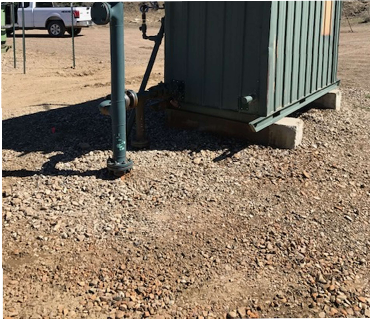
PHOTO 1: THE IMPACTED SOIL NEXT TO THE SEPARATOR HOUSE HAS BEEN CLEANED UP.

APACHE CANYON 35-05 API# 05-071-08542 – TIMBER CREEK OGCC OPERATOR NUMBER 10672 - DATE: APRIL 16, 2019 CORRECTIVE ACTIONS COMPLETED REGARDING COGCC FIR DOCUMENT # 695100457