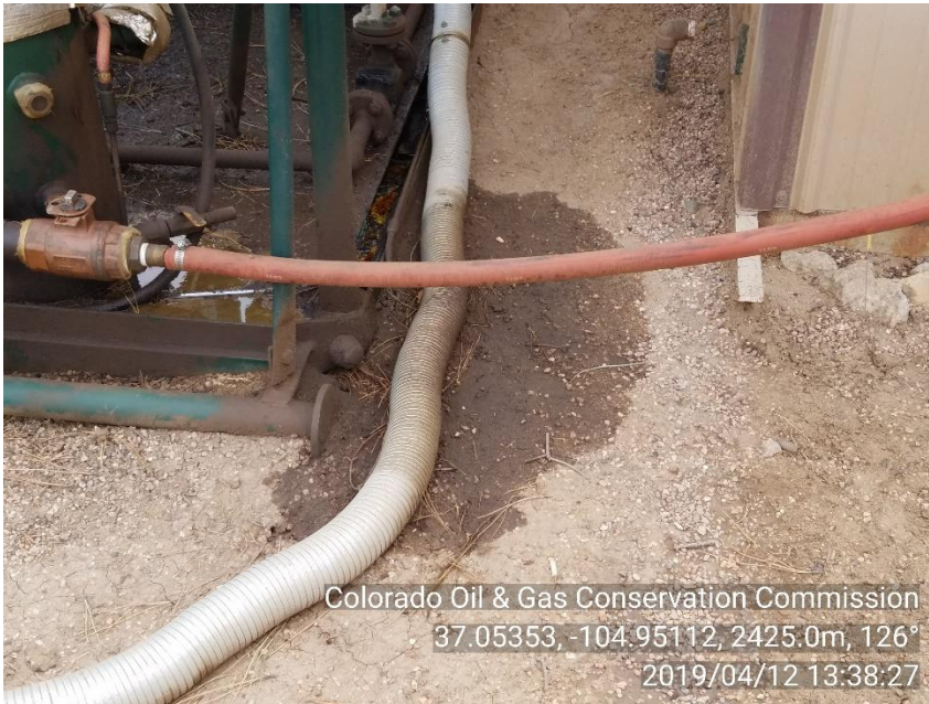
PHOTO 3: THERE IS APP. 3' BY 2' AREA OF IMPACTED SOIL OUTSIDE THE NORTHWEST CORNER OF COMPRESSOR SKID.