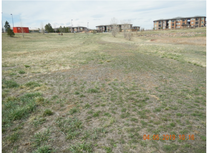
Photo 8. Photo taken from the location, facing West. See comments from Photo 4.