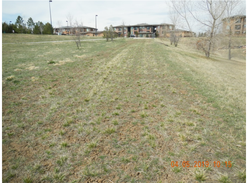
Photo 2. Photo taken from the access road, facing West. See comments from Photo 1.