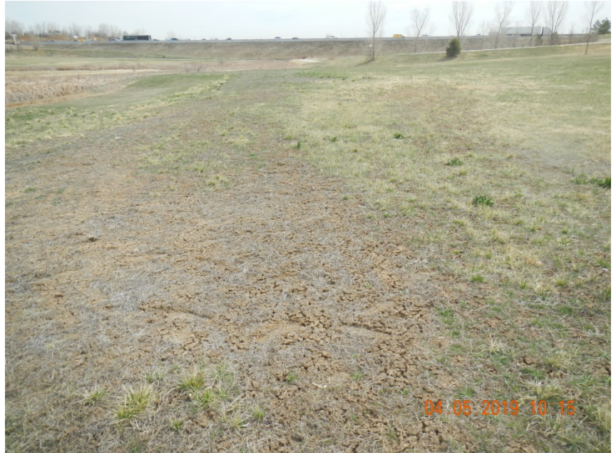
Photo 4. Photo taken from the location, facing East. Appears sections of the reclamation is not at percent cover and has non-uniform establishment of vegetation cover.