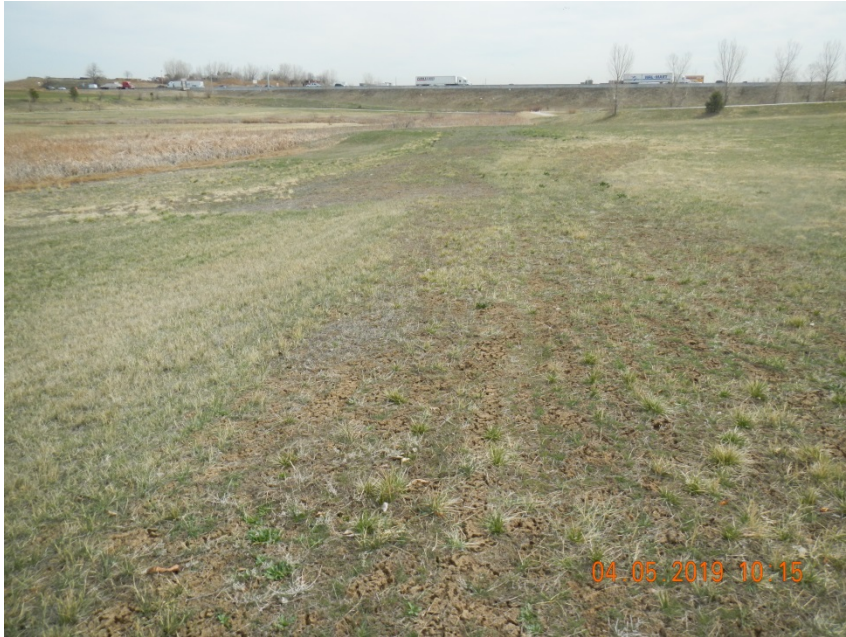
Photo 1. Photo taken from the access road looking the location, facing East. Appears Operator has performed final reclamation activities with the evidence of drill rows and perennial grass revegetation.