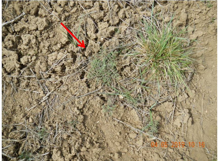
Photo 6. Photo taken from the location. Diffuse Knapweed ( Acosta diffusa ), A Colorado list B noxious weed, was observed on location.