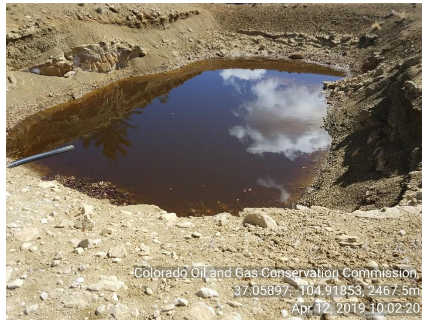
Photo 6 Produced water pit.