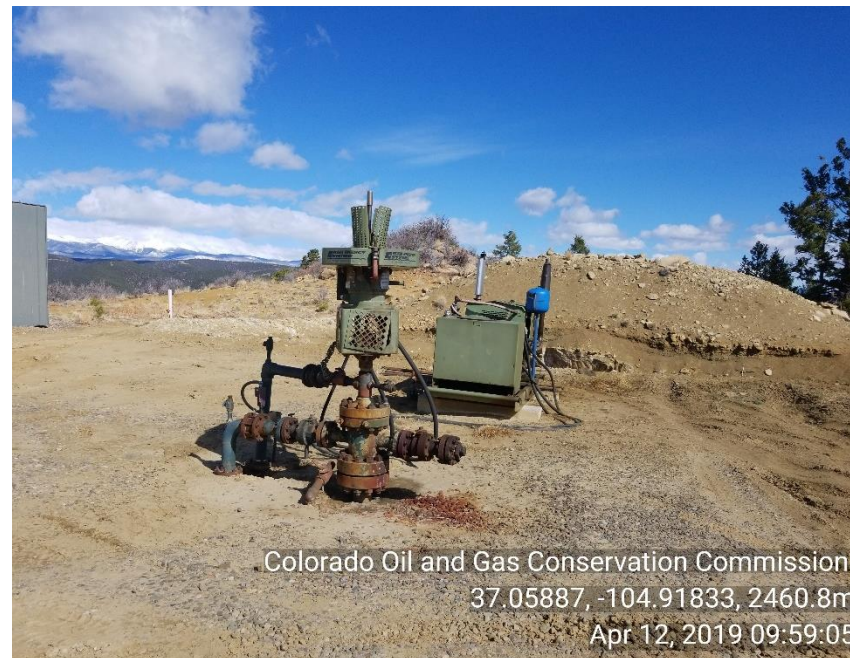
Photo 2 WH and HYD motor skid