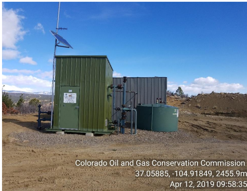
Photo 1 Sep/Meter house, 30bbl produced water tank and Liquid ring sound walls.