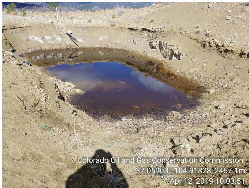
Photo 7 Produced water pit.