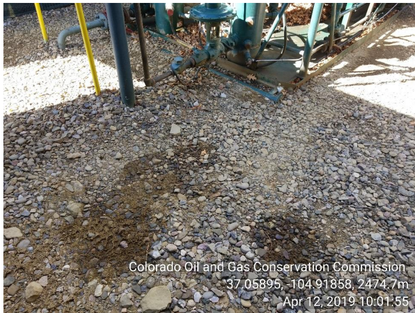
Photo 5 Stained soil around liquid ring skid.