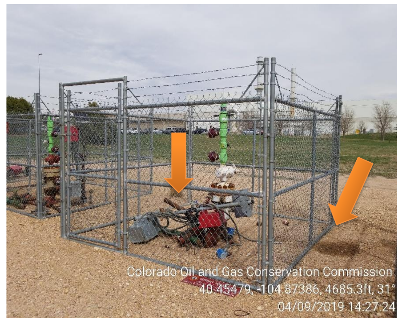
Photo 11 – Well 27-54, unmarked 1" riser, unmarked 2" riser, Unused equipment, stained soil