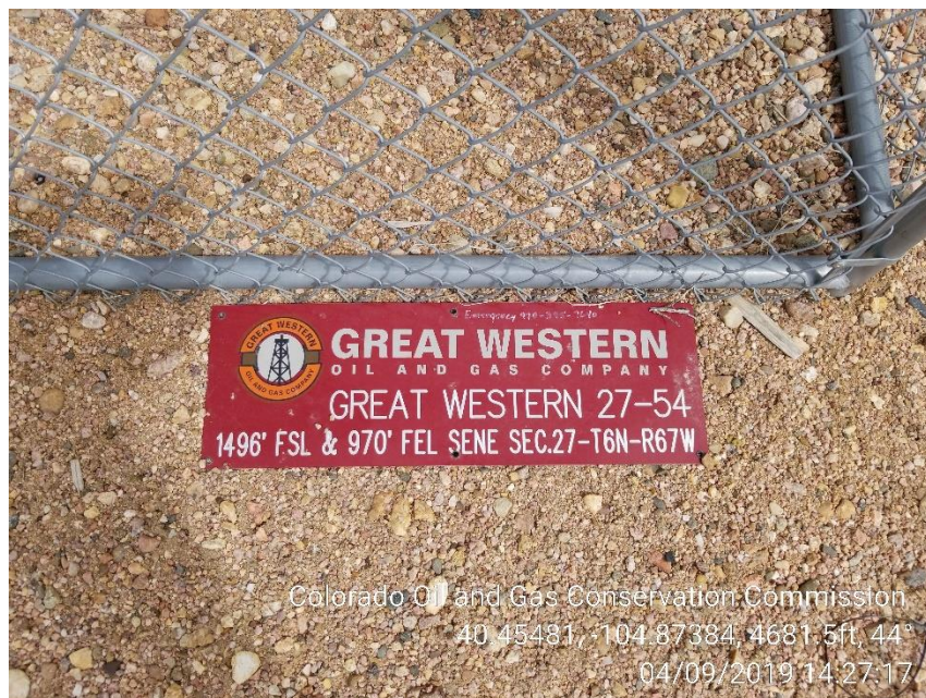
Photo 10 – Wellhead for 27-54, Emergency Contact phone is fading and on the ground.