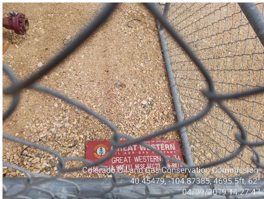
Photo 14 – Wellhead for 27-34, Emergency Contact phone number is fading and on the ground