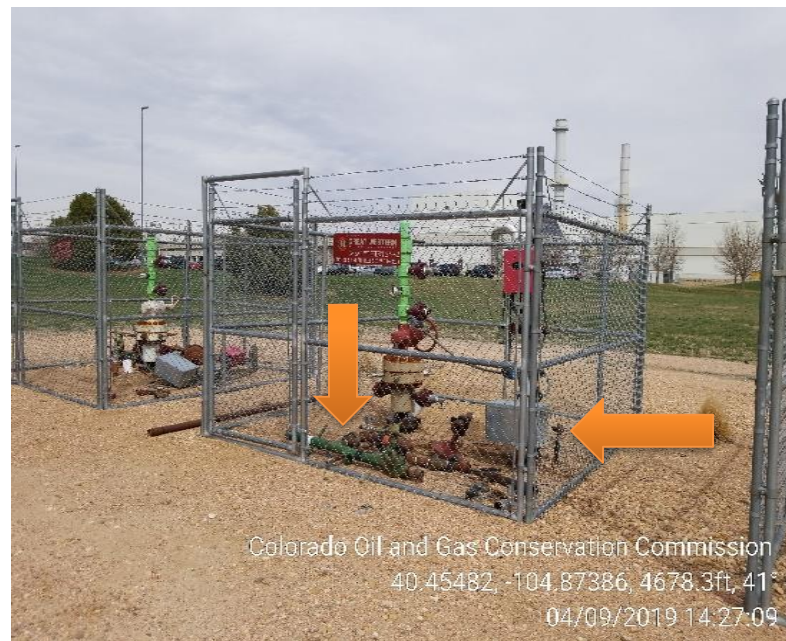
Photo 9 – Well 27-43, unmarked 1" riser, unmarked 2" riser, Unused equipment