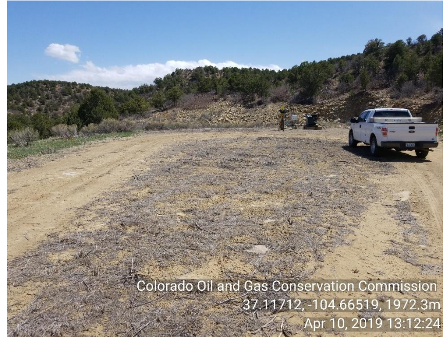
Photo 1 Meter/sep house