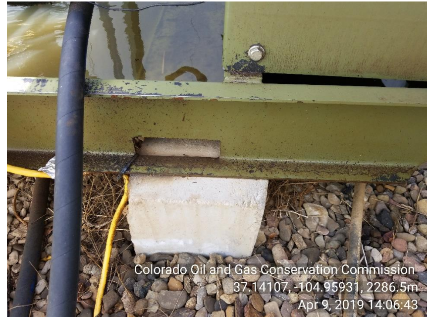
Photo 4 stained soil around HYD skid