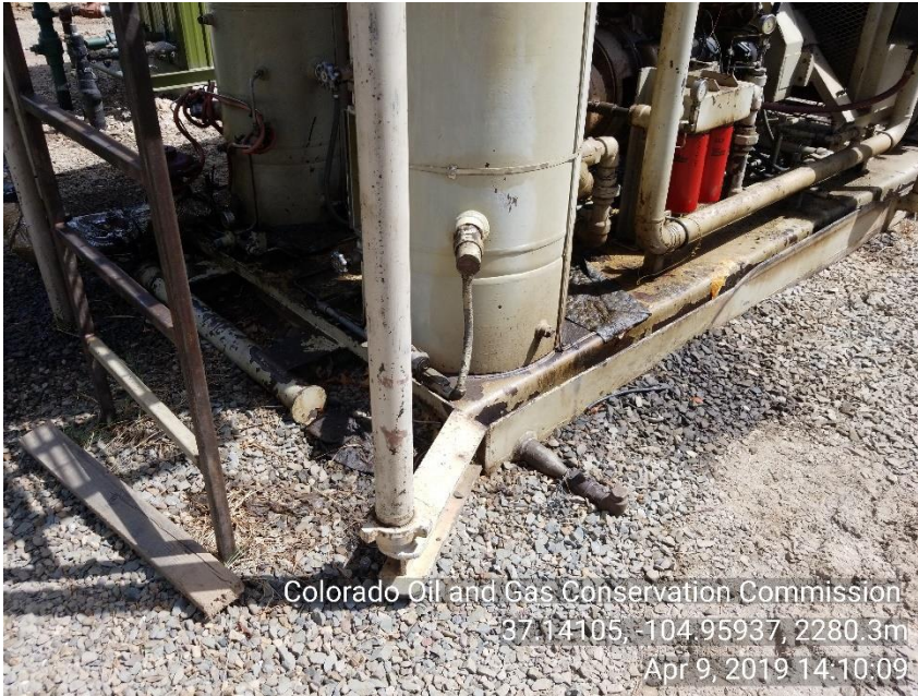
Photo 11 Stained soil around Liquid ring skid