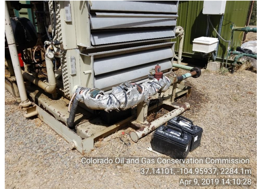
Photo 10 stained soil around Liquid ring skis and unused equipment (batteries )