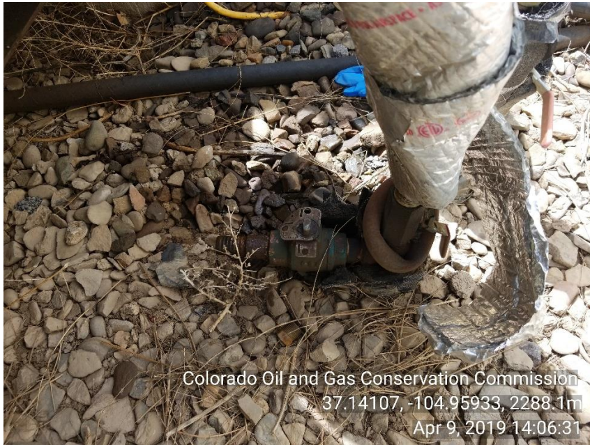
Photo 3 Stained soil around fuel gas line to HYD skid