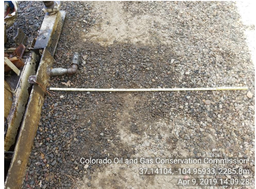
Photo 10 stained soil around Liquid ring skid approximately 48in out from skid.