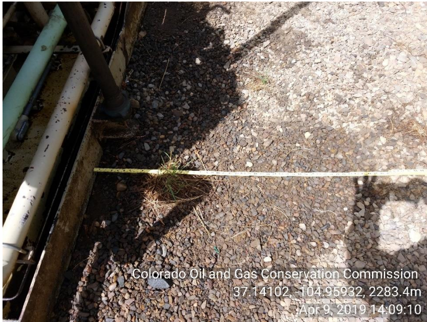
Photo 9 Stained soil around Liquid ring skid approximately 48in out from skid.