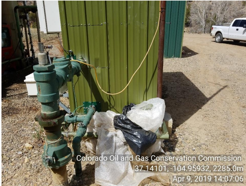
Photo 5 Trash outside separator house