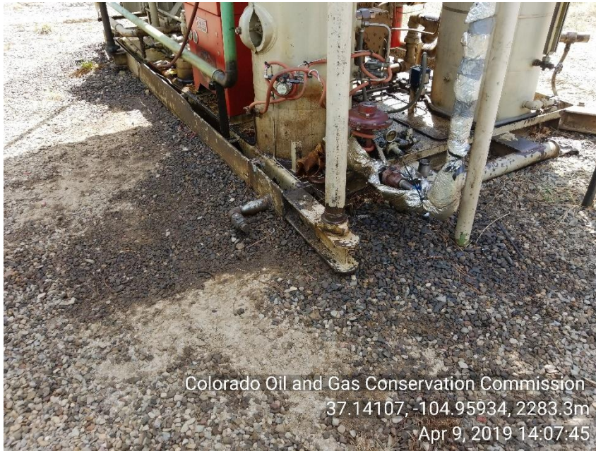
Photo 7 Stained soil around Liquid ring skid