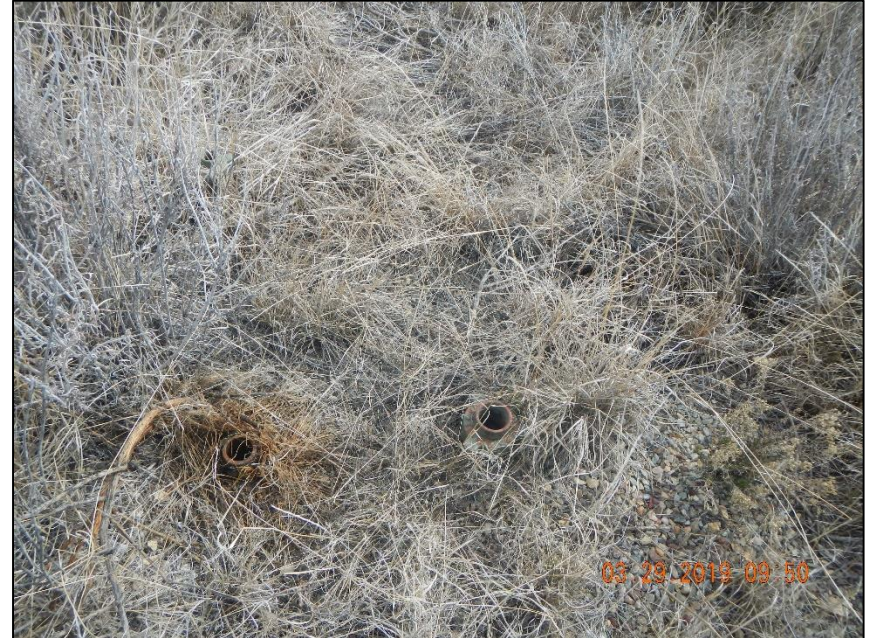
Unused open ended risers