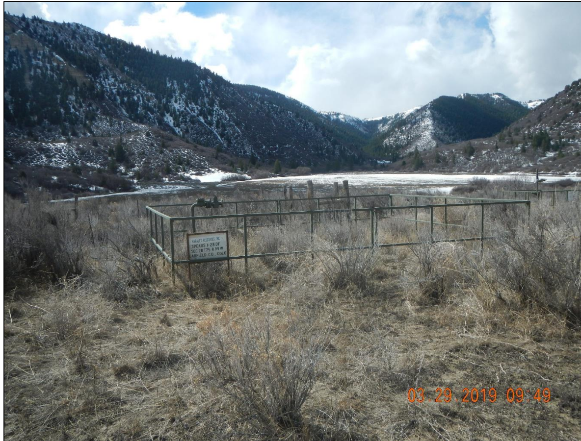
Unused open ended risers in the fence area.

USA 1-28DF Api# 05-045-06228 Inspection # 689702948