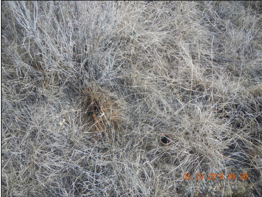
Unused open ended risers