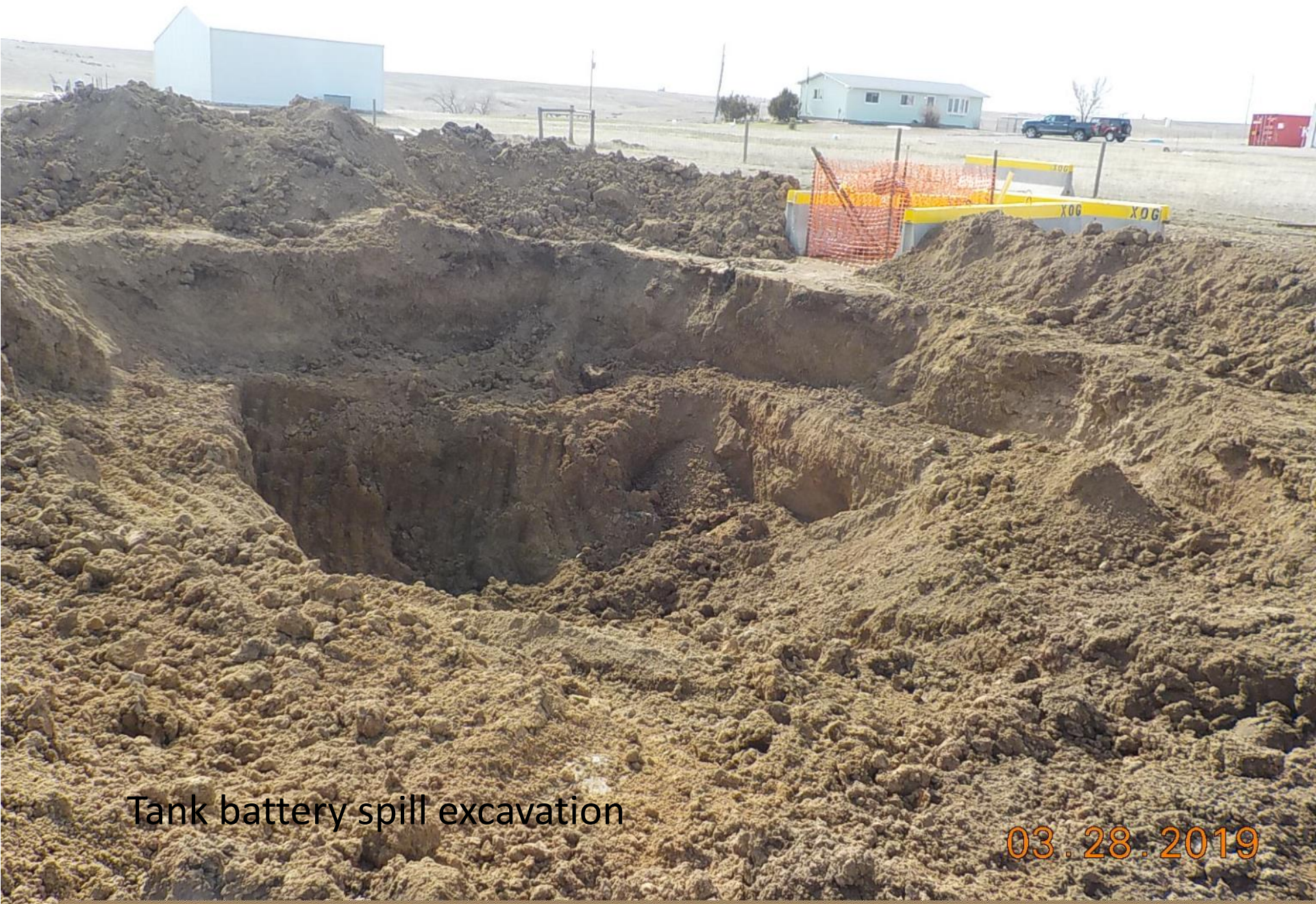
Tank battery spill excavation