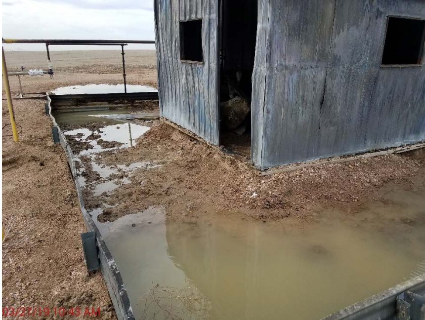
Photo 5 – Inside secondary containment showing impacted material removed from containment area.