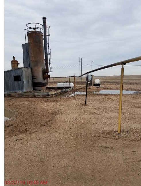
Photo 8 – Piping for ECD warped by heat and coated in oil fro spill.