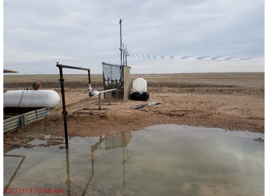
Photo 6 – South side of heater treater showing presumed area impacted by spill and damaged meter shed.