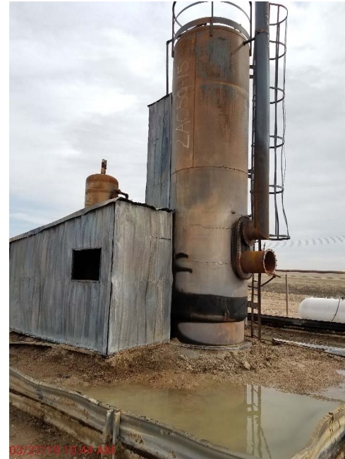
Photo 4 – Southside damaged treater and impacted material removed from within secondary containment.