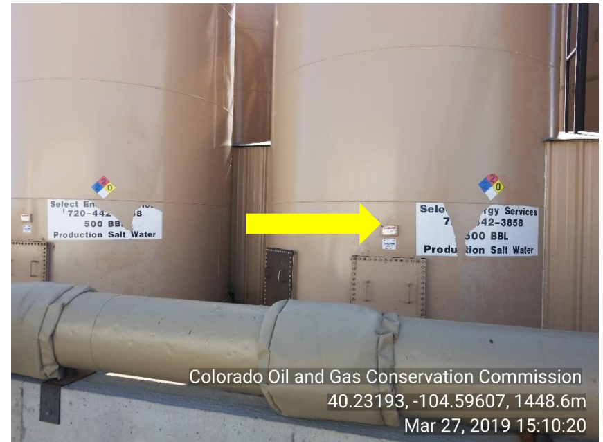
Photo 18 Active Injection facility Tank sign and NFPA placard unreadable or missing