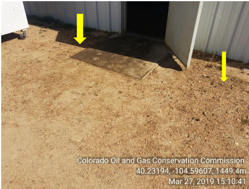
Photo 15 Stained soil outside opposite side of active injection pump building