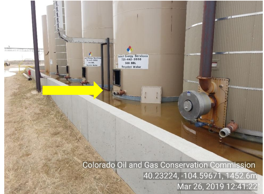
Photo 4 Unused equipment : Recycling battery inspection plates have been removed