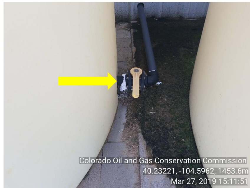
Photo 8 Mechanical issue: Valve appears to be leaking on acid tanks . Storm water issues due to no secondary containment