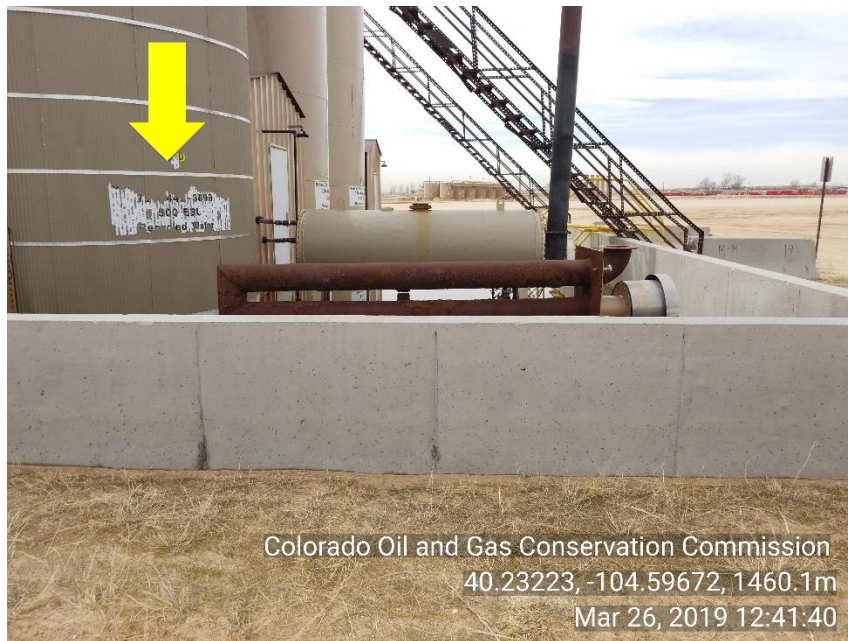
Photo 5 Unused equipment : Recycling battery. Tank sign and NFPA placard unreadable or missing