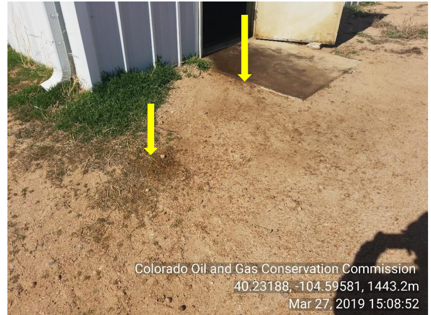
Photo 14 Stained soil outside door of active injection pump building