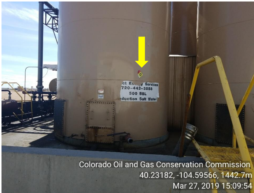
Photo 17 Active Injection facility Tank sign and NFPA placard unreadable or missing