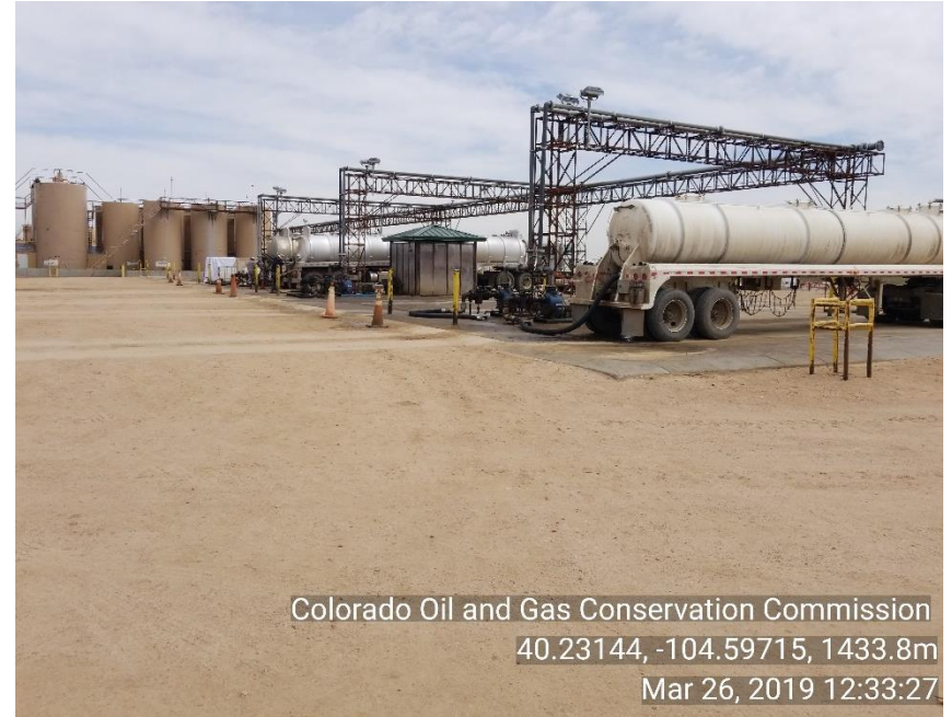
Photo 2 Truck transfer area