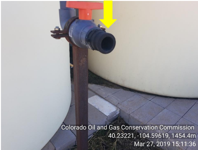
Photo 9 Unused equipment Acid tank, no bull plug on load line, storm water issue with no secondary containment