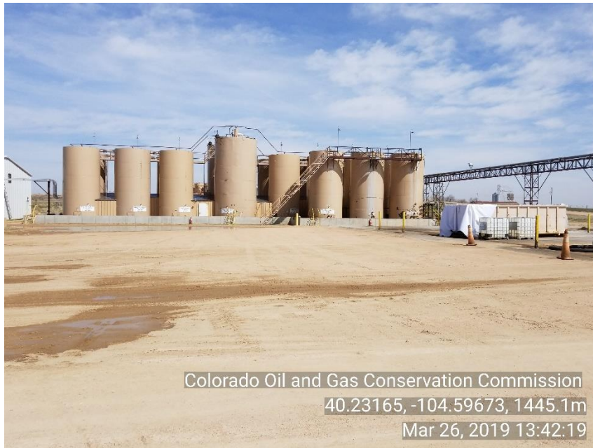
Photo 11 Active injection facility