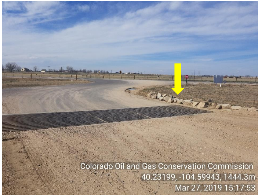
Photo 19 Inadequate tracking pad BMP