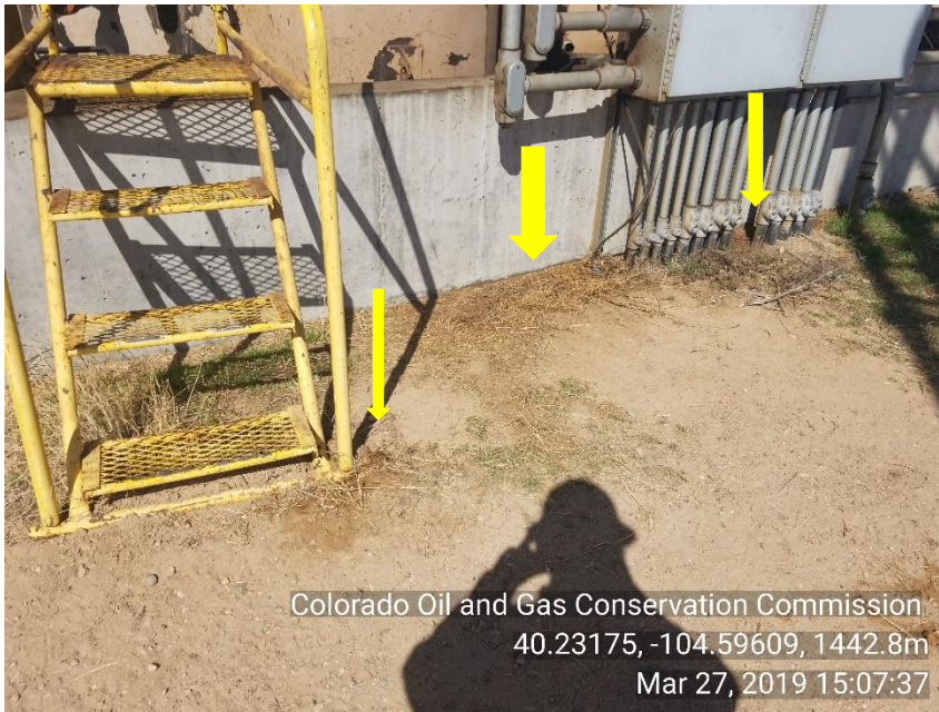
Photo 13 Stained soil around active injection battery