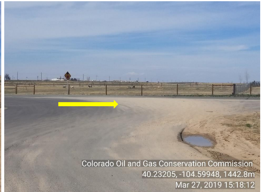
Photo 20 Sediment being carried onto county road 34 from trucks exiting facility