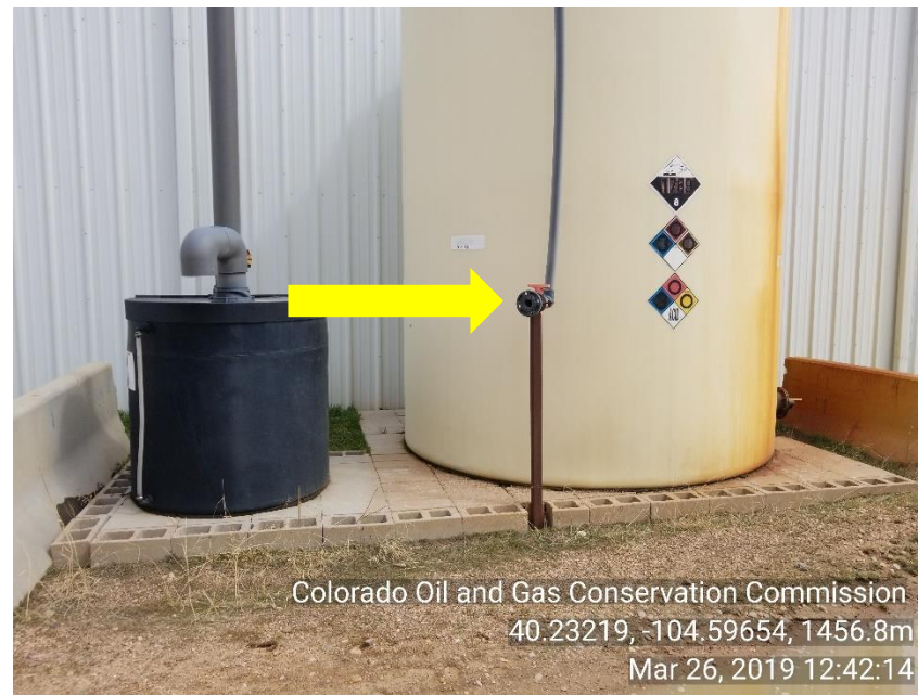
Photo 6 Unused equipment Acid tank, NFPA placards unreadable and faded, no volume sign ,no bull plug on load line, storm water issue with no secondary containment