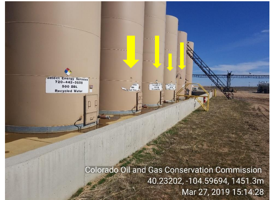
Photo 10 Unused equipment : Recycling battery. Tank sign and NFPA placard unreadable or missing