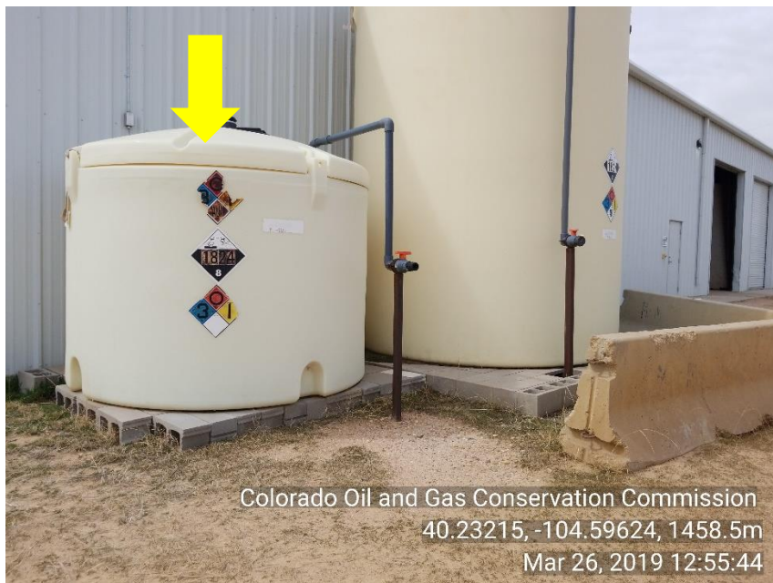
Photo 7 Unused equipment Acid tank, NFPA placards unreadable and faded, no volume sign ,no bull plug on load line, storm water issue with no secondary containment