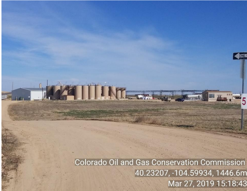
Photo 1 location picture