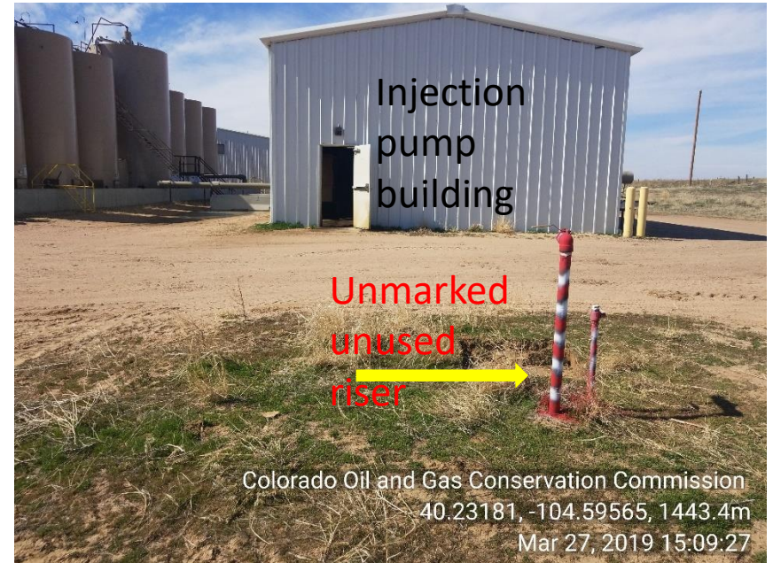
Photo 16 Unused unmarked riser