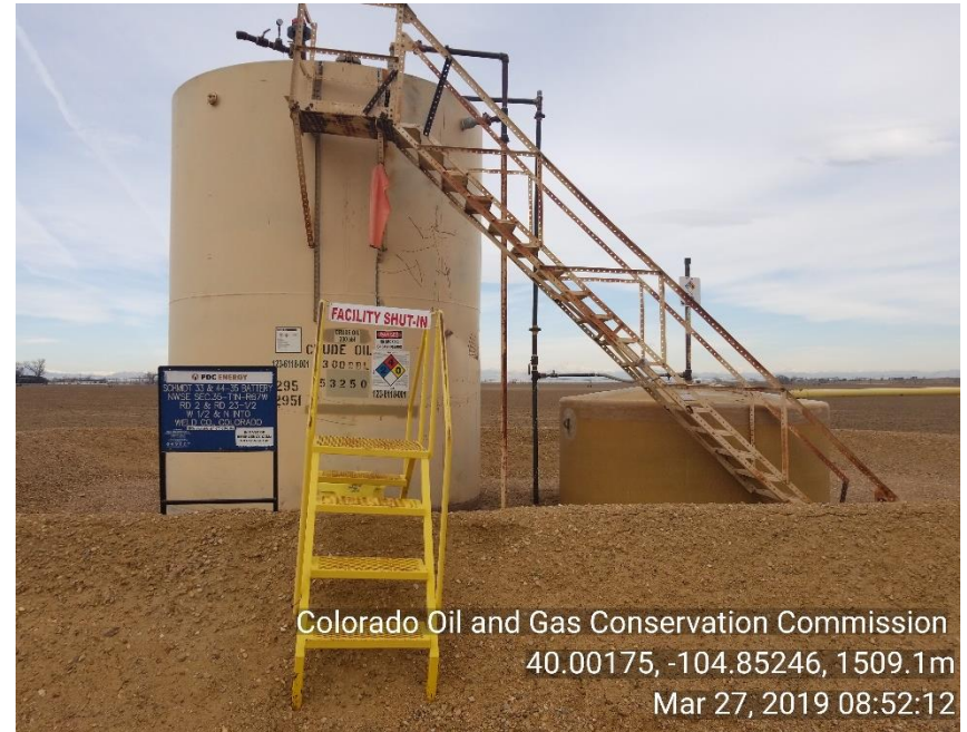
Colorado Oil and Gas Conservation Commission 40.00175, -104.85246, 1509.1m Mar 27, 2019 08:52:12