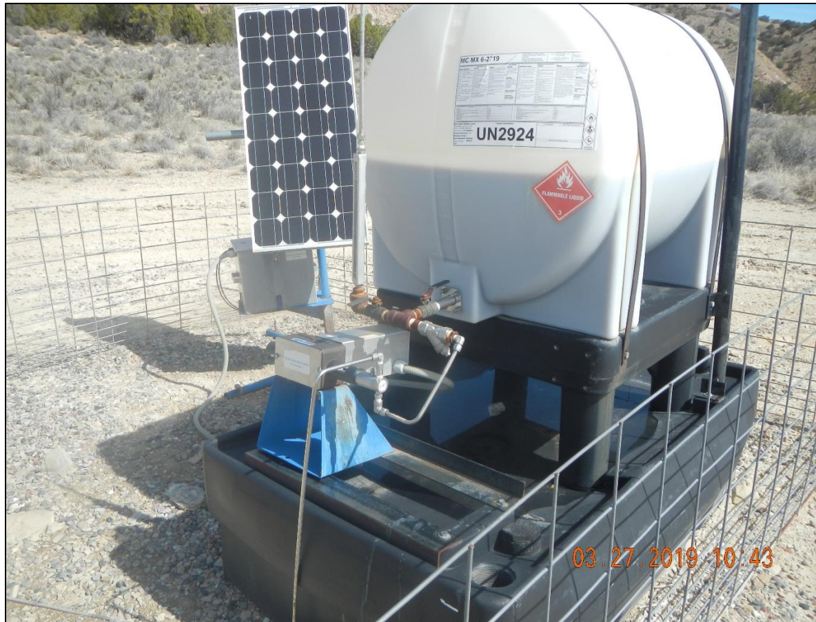
Secondary containment for chemical container lacks freeboard.