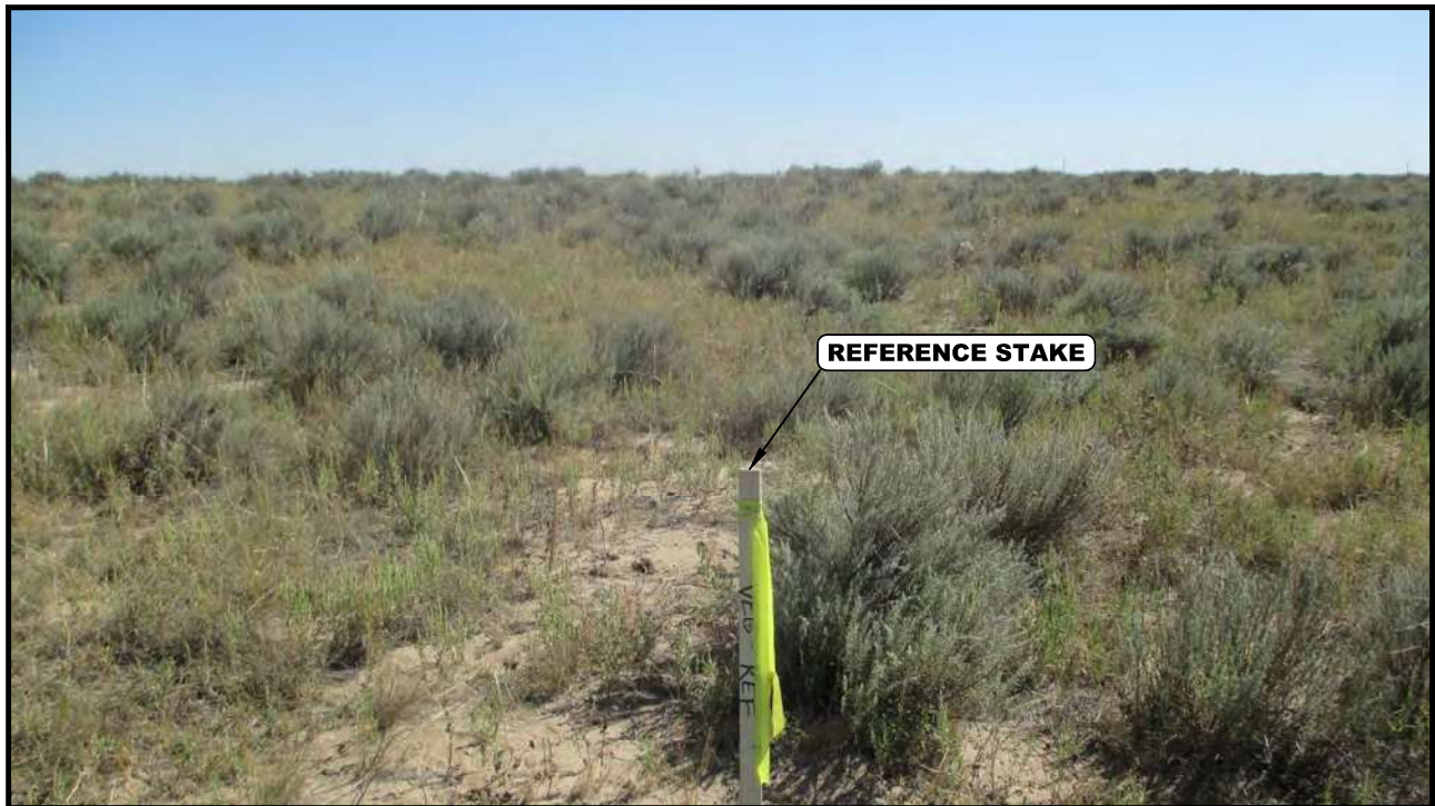
PHOTO: VIEW OF REFERENCE AREA