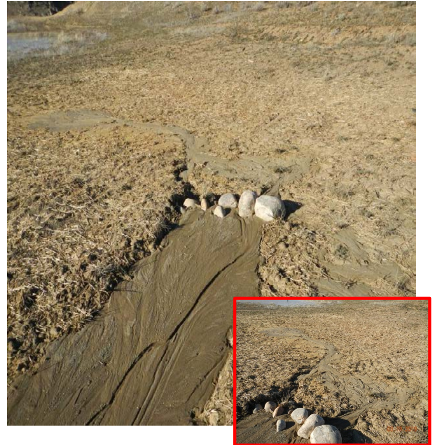
Photo#14: Sediment flowing from off site into Location makes this site a challenge.