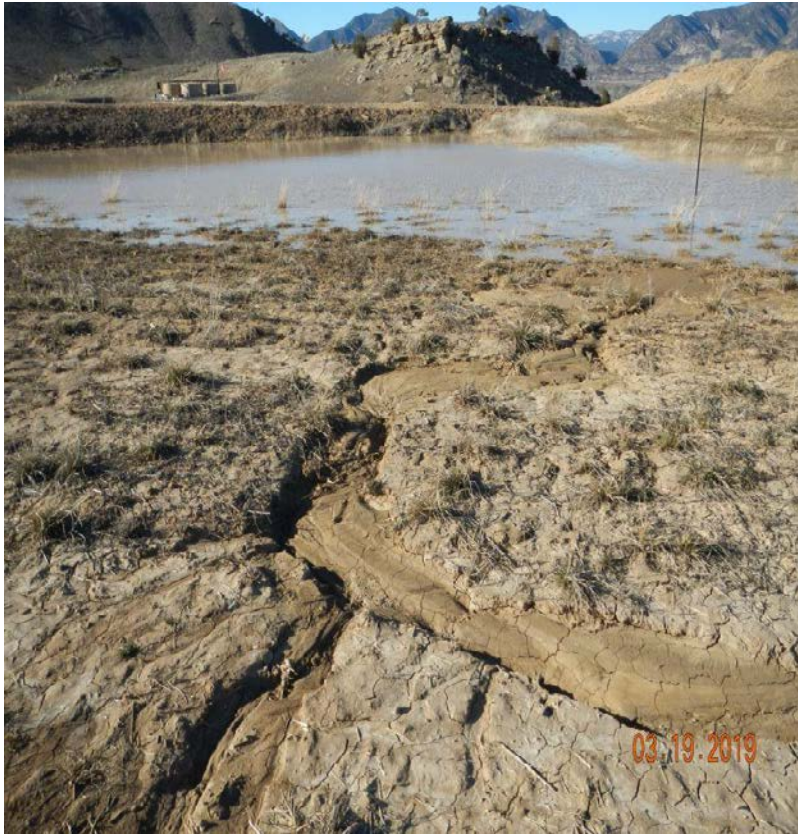
Photo#13: Sediment flowing from off site into Location makes this site a challenge.