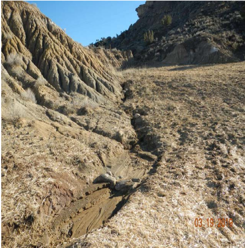
Photo#11: Sediment flowing from off site into Location makes this site a challenge.