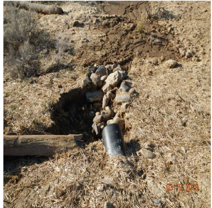
Photo#8: North side of berm where overflow discharges, needs repair, maintenance.