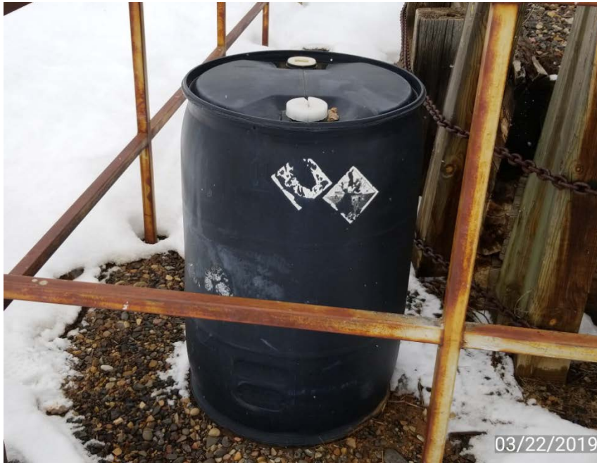
Photo 3. Barrel without label.