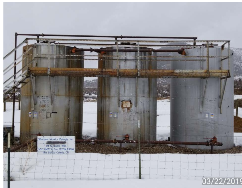
Photo 2. Tank battery.