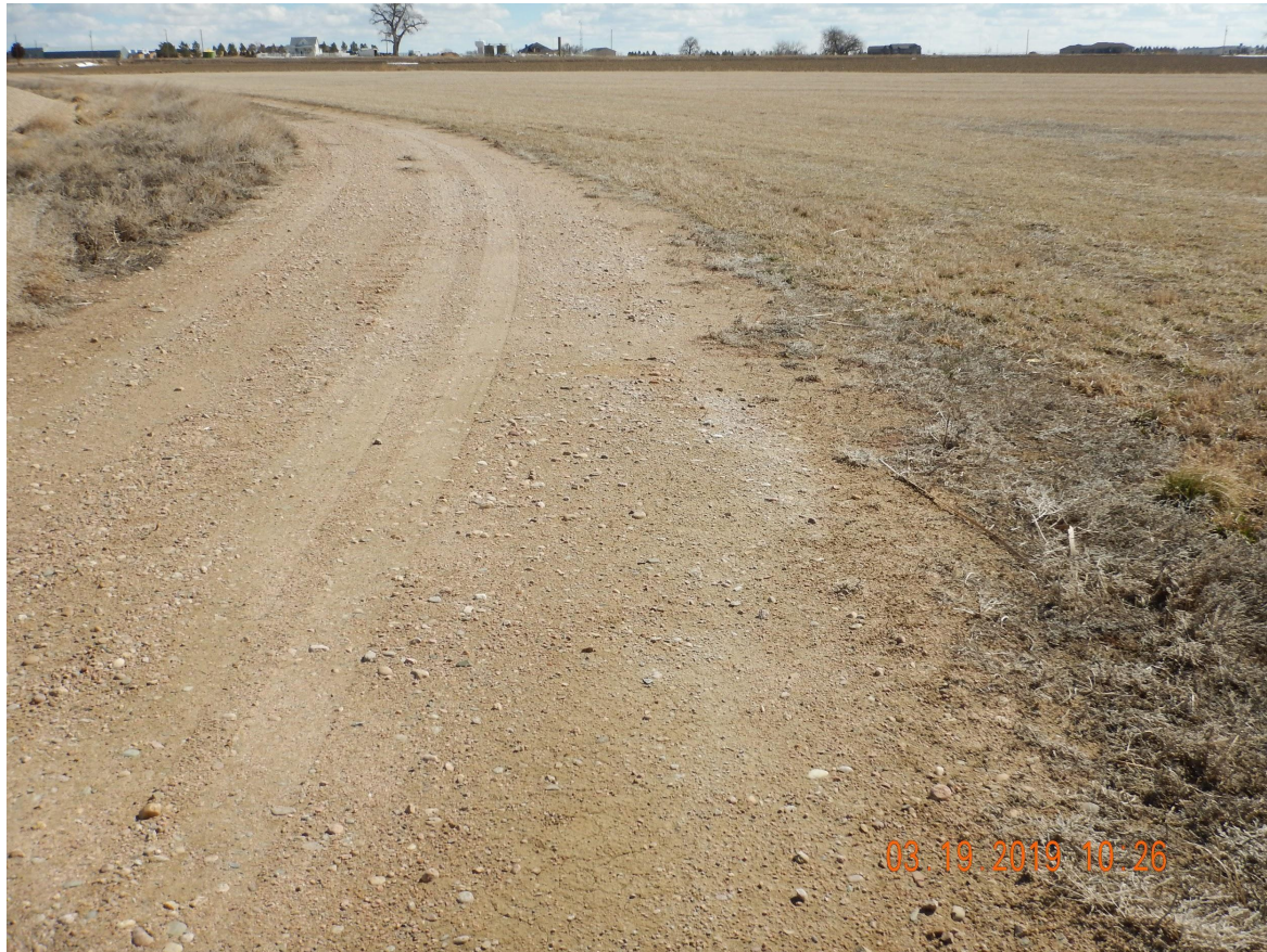
Photo 2. Photo taken from the western well access road, facing East. See comments under Photo 1.