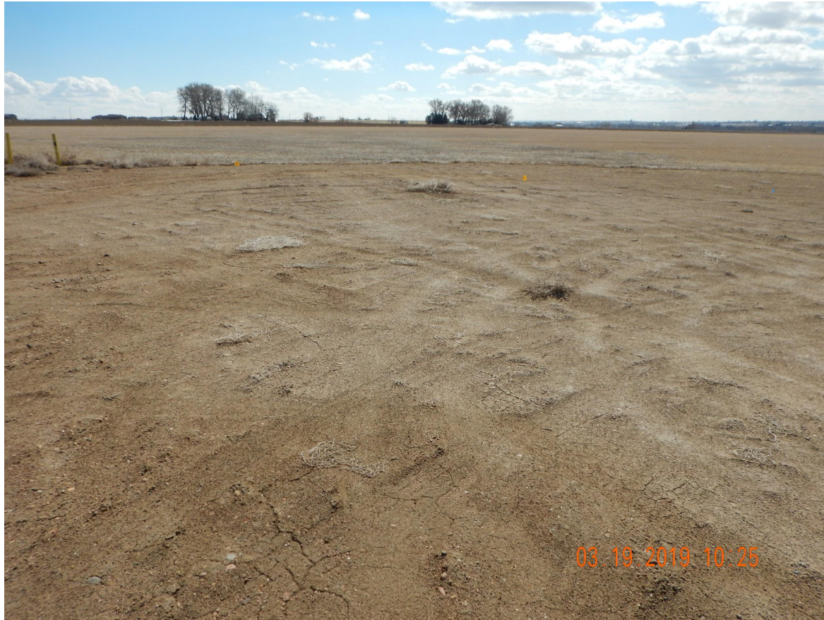
Photo 1. Photo taken from the tank battery location, facing South. Operator has failed to perform final reclamation activities at the tank battery and well access road.