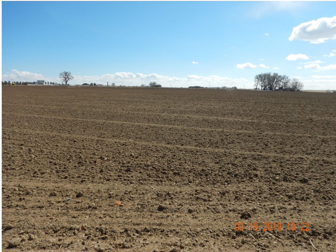
Photo 3. Photo taken west of the PA well location, facing East. A follow up inspection will have to occur during the growing season to assess the vegetative growth to ensure compliance with Rule 1004 standards.