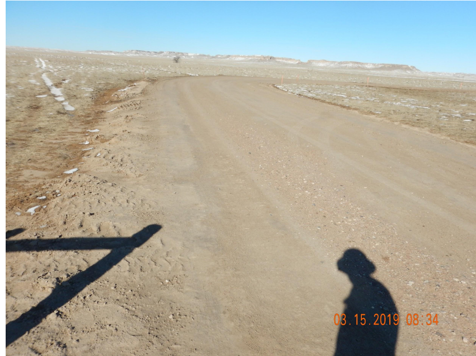
Photo 8. Photo taken from the western location along the northern access road, facing West. Operator plans to install gravel along all access road.