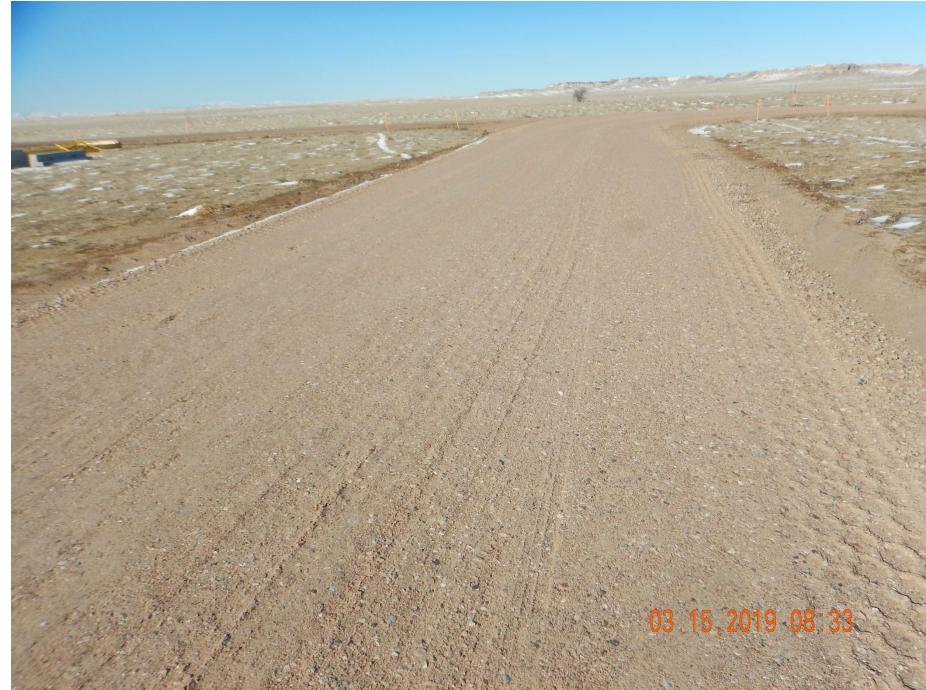
Photo 6. Photo taken from the western location along the northern access road, facing West. Operator has stabilized the access road with gravel.