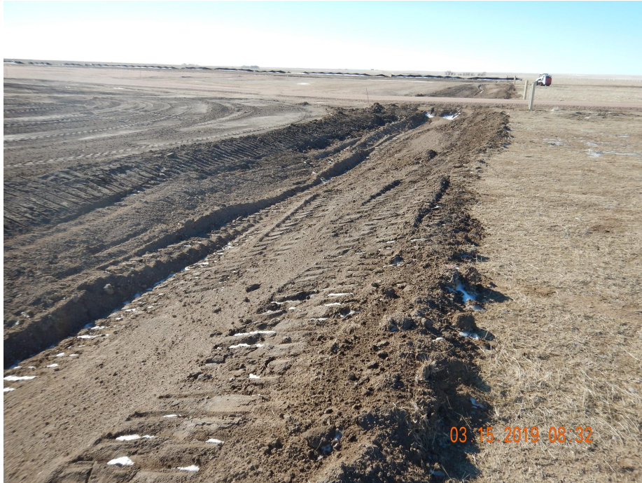
Photo 5. Photo taken from the northwestern location, facing South. See comments under Photo 1.