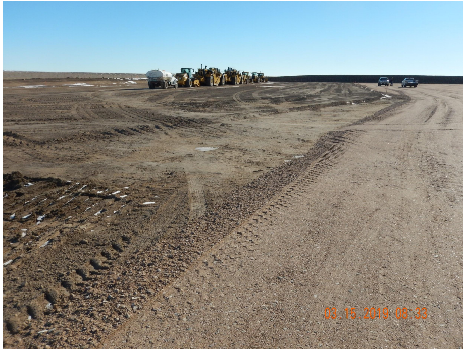
Photo 7. Photo taken from the western location, facing East. Operator is in-process of stabilized the well pad with gravel.