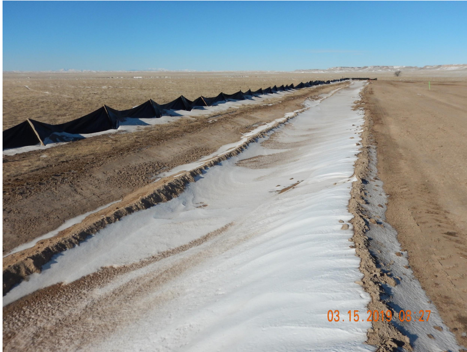
Photo 1. Photo taken from the southern location, facing West. Operator has installed a ditch around the perimeter of the location and has installed a silt fence BMP around portions of the location. Silt fence BMP is in need of maintenance from the recent storm on March 13th. Operator representative on location indicated that repairs were already on order.