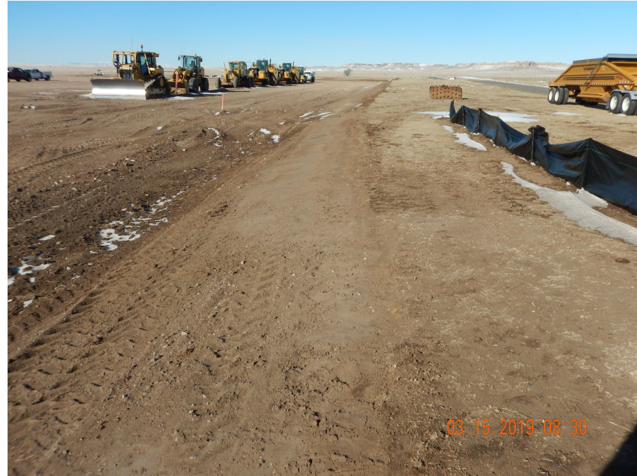
Photo 4. Photo taken from the northeastern location, facing West. See comments under Photo 1.