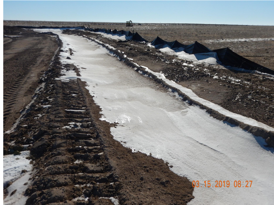
Photo 2. Photo taken from the southern location, facing East. See comments under Photo 1.