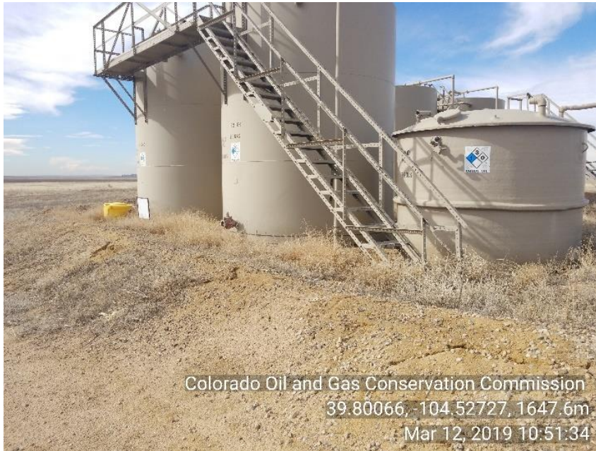
Photo 11 Weeds around TNK BTRY