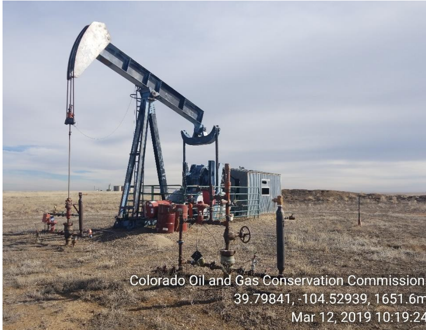
Photo 1 WH no WH sign