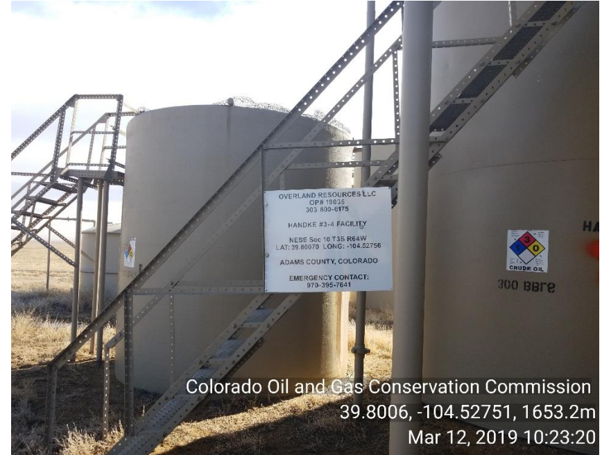
Photo 2 TNK BTRY