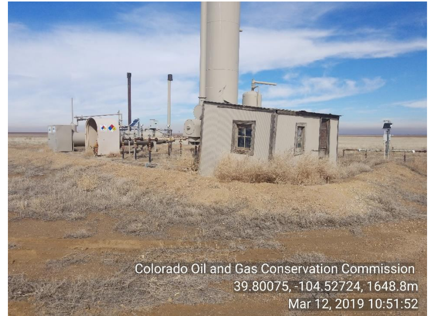
Photo 12 Weeds around separators and separator house.