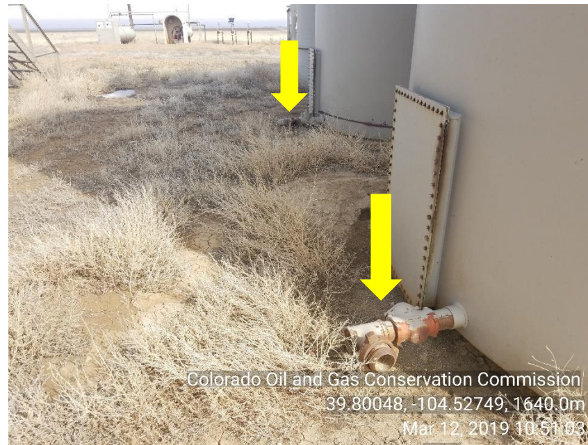
Photo 10 Crude oil tanks have no bullplugs on load lines