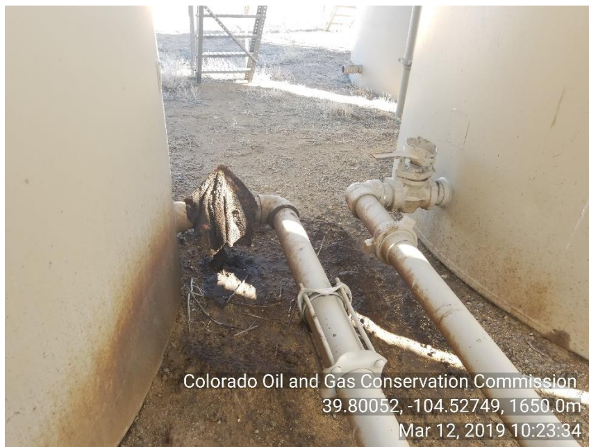
Photo 3 Mechanical and stained soil between crude oil tanks