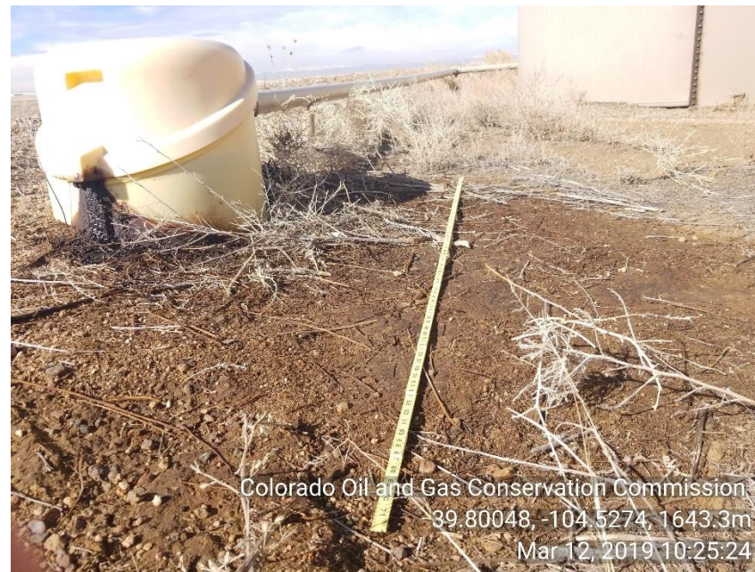
Photo 8 Mechanical and stained soil around crude oil load out line spill container. Approximately 71in long by 71 in wide