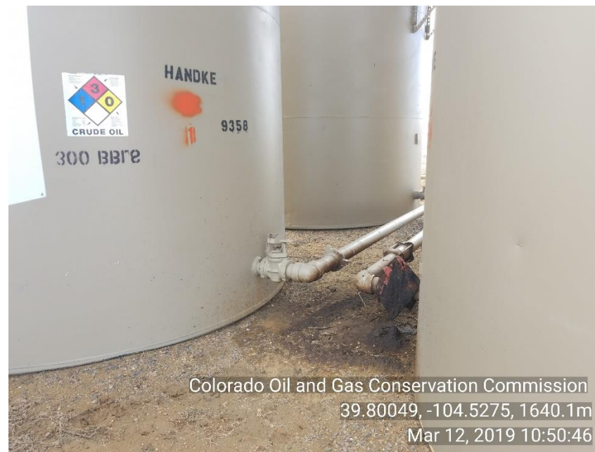
Photo 4 Mechanical and stained soil between crude oil tanks