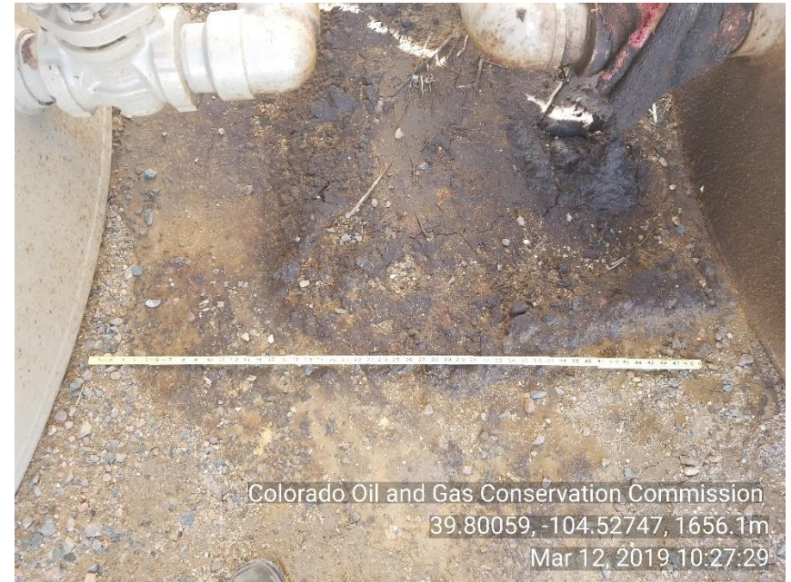
Photo 6 Mechanical and stained soil between crude oil tanks. Approximately 41in wide