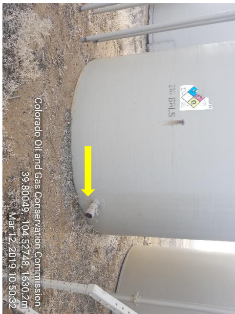
Photo 9 H 2 O production tank has no bullplug on load out line.