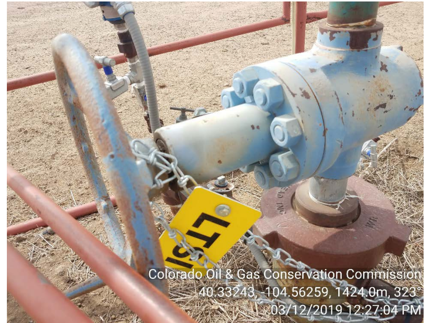
Master valve tag