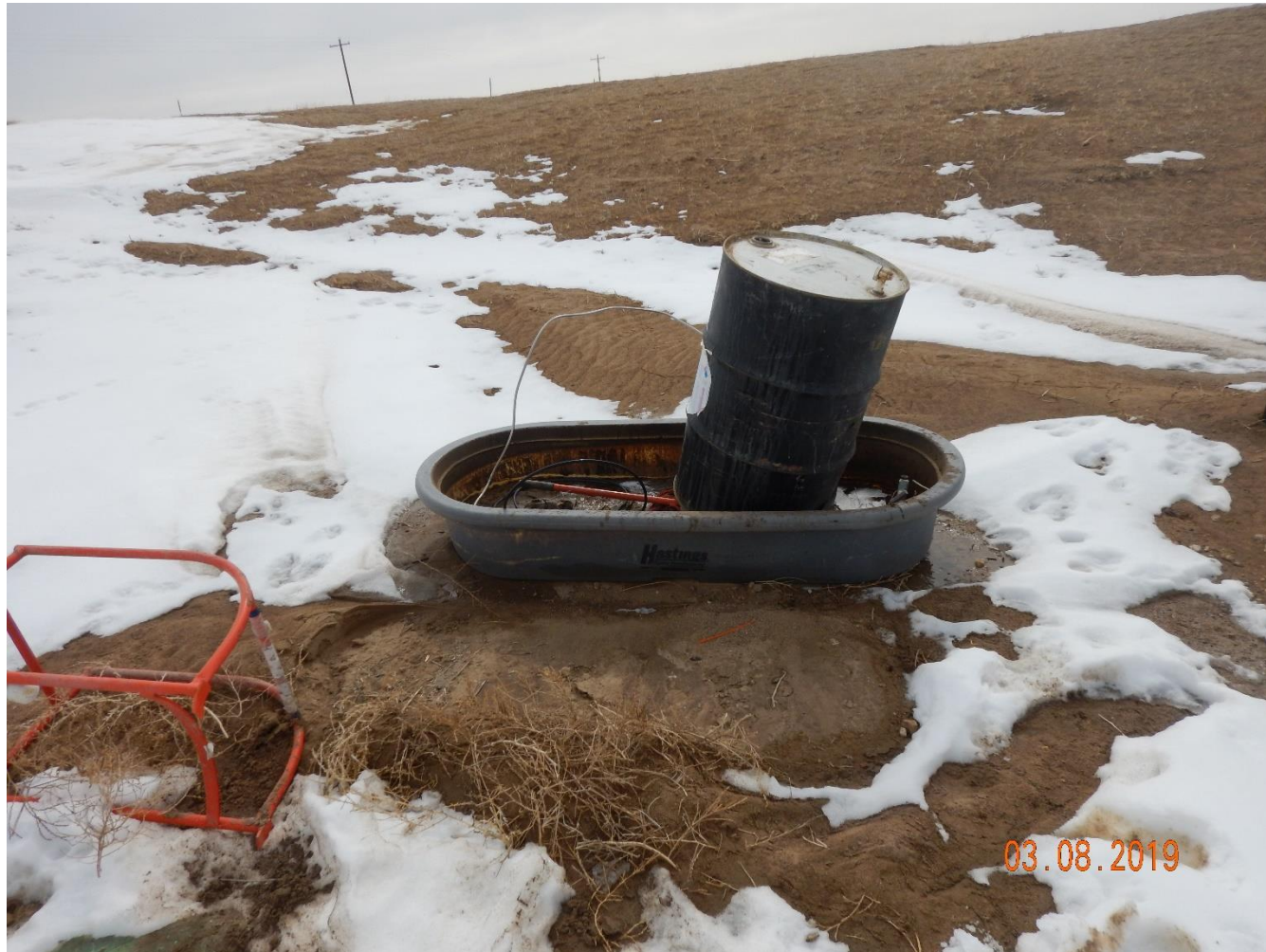
Photo 26: Photo shows barrels on location properly stored in sufficient secondary containment.