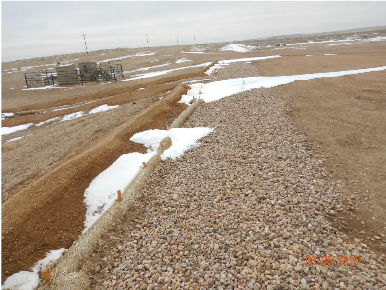
Photo 19: Photo taken from the northeast corner of the location, facing south. Photos 19-21 provide an overview of the location from south, southwest to west