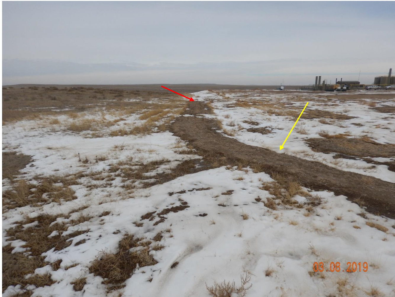
Photo 8: Photo taken from the southwest corner of the location, facing north. Photo provides overview of the location. Photo also shows shallow berm on the southwest end of the location. Berm travels north approximately a couple hundred of feet and ends (red arrow). There does not appear to be sufficient stormwater and erosion control BMPs at the end of berm to mitigate erosion degradation and sediment laden free stormwater discharge from location.