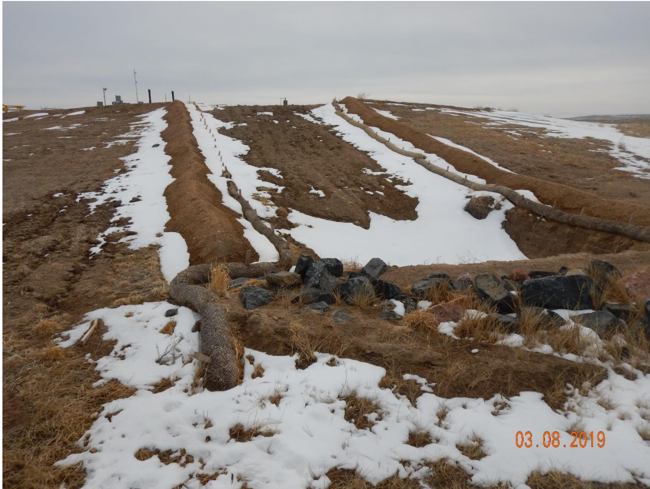
Photo 9: Photo taken from northwest corner of the location. Photo shows sediment trap. Operator has installed two (2) traps on the location. Sediment traps do not appear sufficient in size to mitigate stormwater runoff from the 14.5 acre disturbance area.