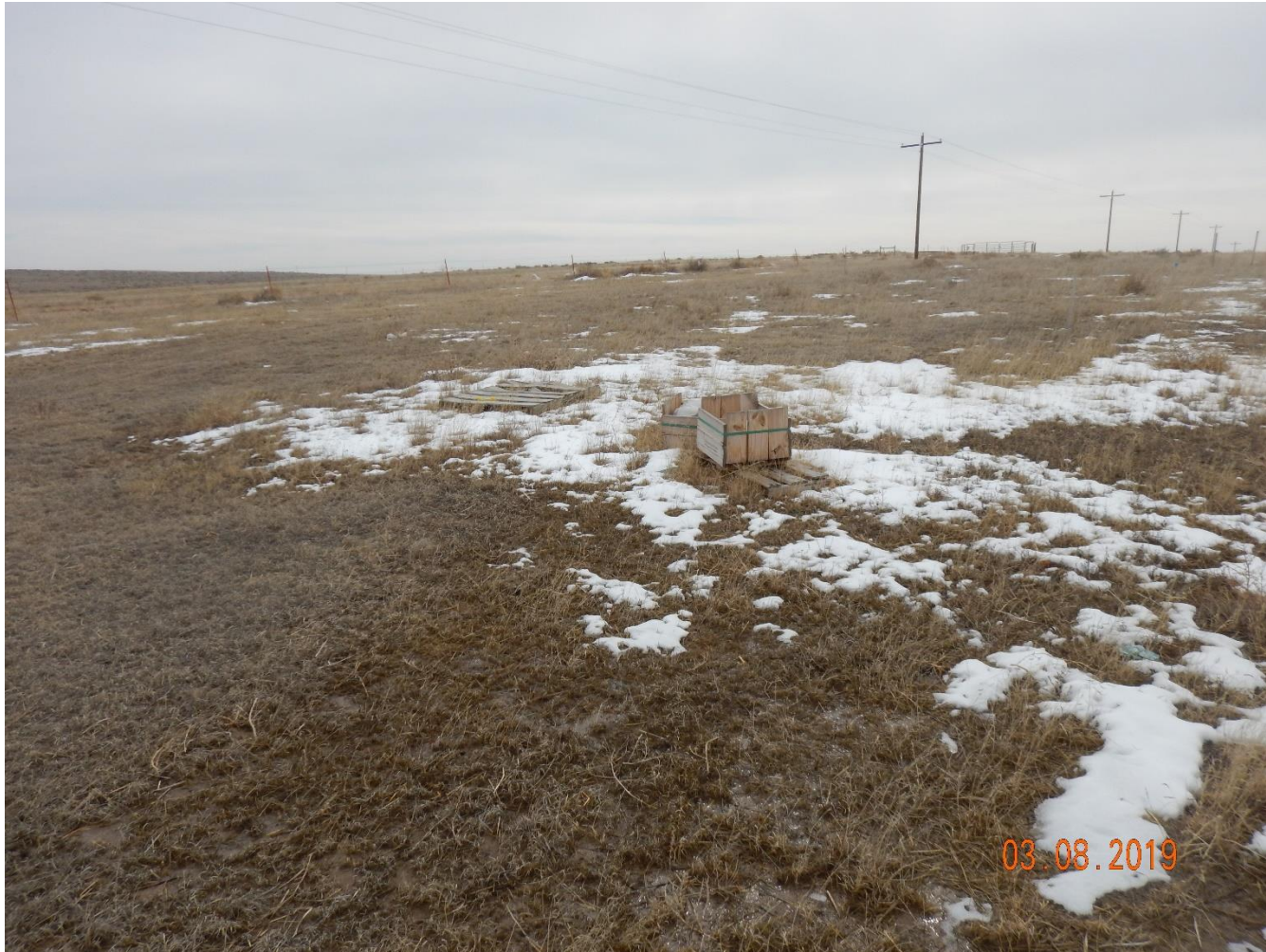
Photo 22: Photo taken from the east end of the location, facing southeast. Photo shows various trash debris/materials being stored off location.