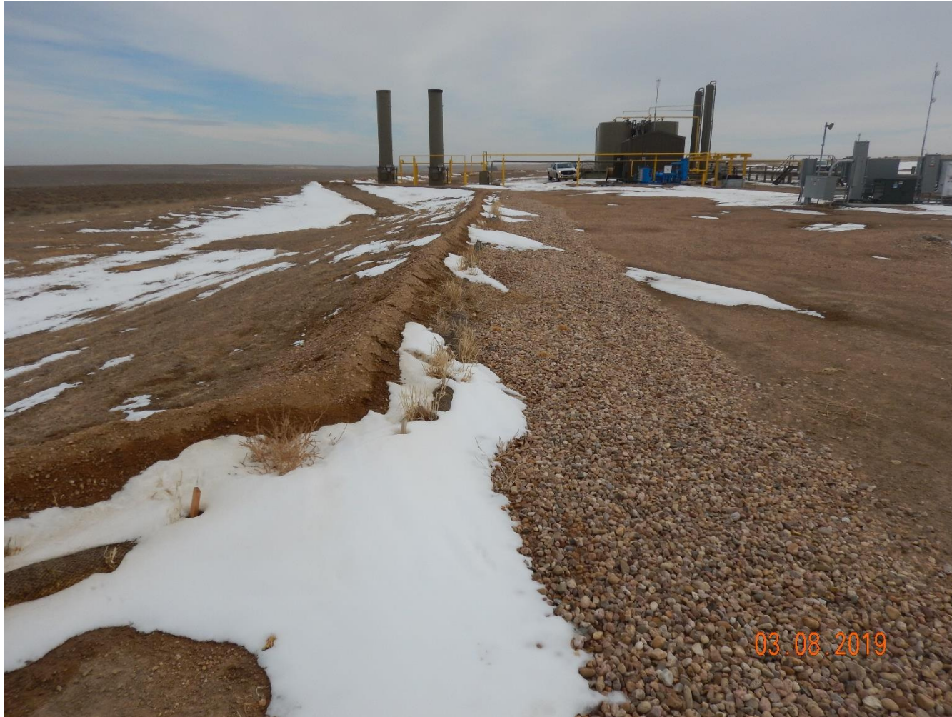
Photo 11: Photo taken from the northwest corner of the location, facing east. Photos 11-13 provide an overview of the location from east, southeast to south.