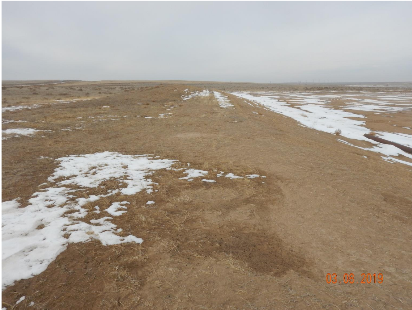
Photo 1: Photo taken from the southeast corner of the location, facing west. Photos 1-3 provide and overview of the location from west, northwest to north.