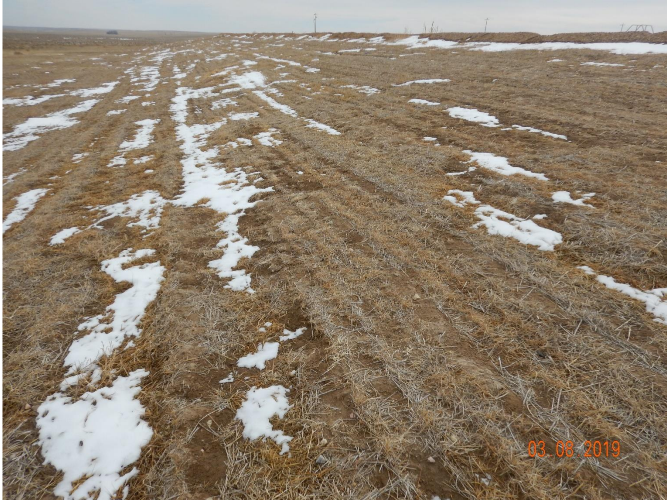
Photo 14: Photo taken from the north end of the location, facing east. Photo shows vegetative establishment on the slopes evident.