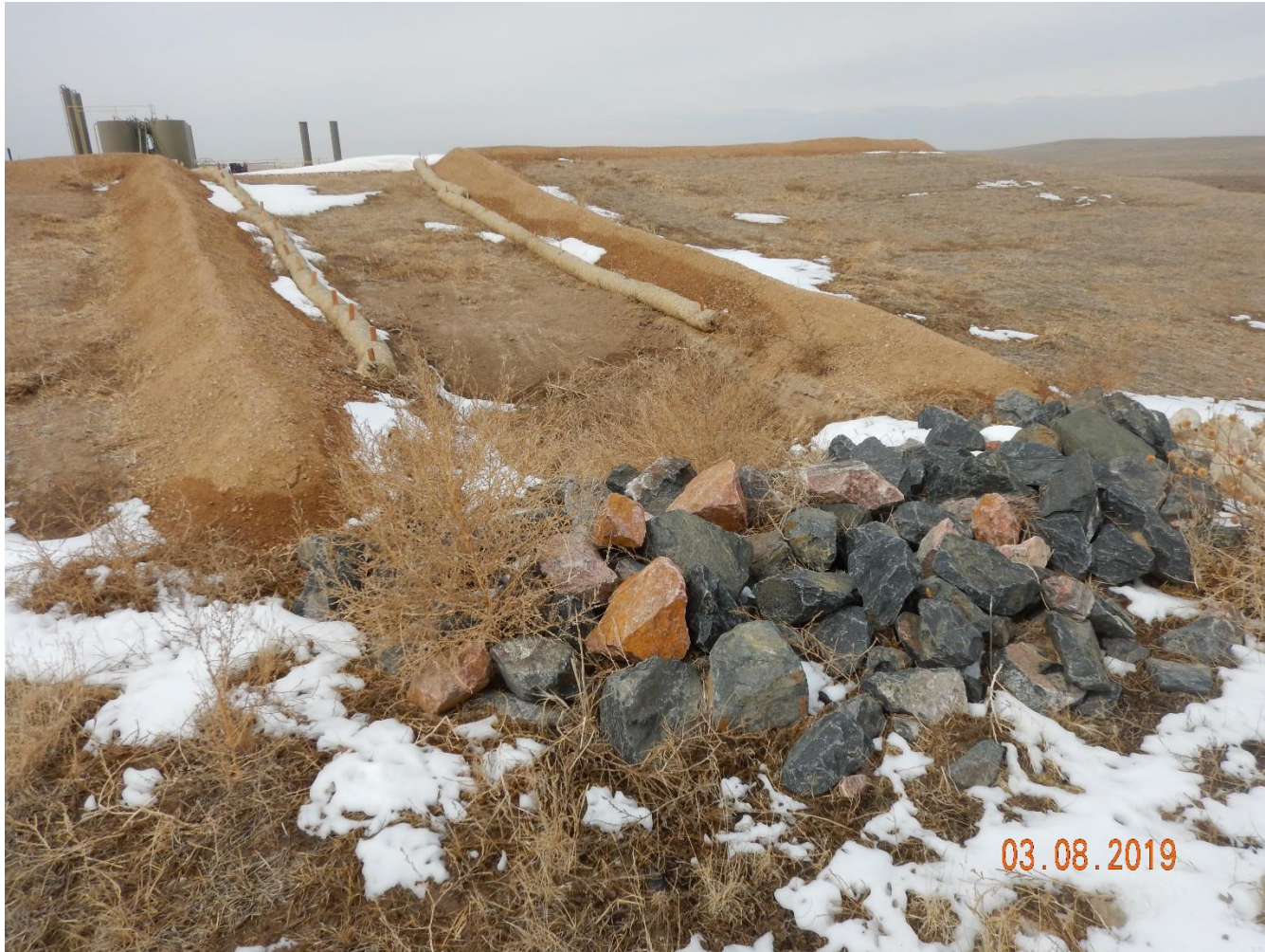
Photo 16: Photo taken from the sediment trap on the northeast corner of the location. See comments under photo 9.