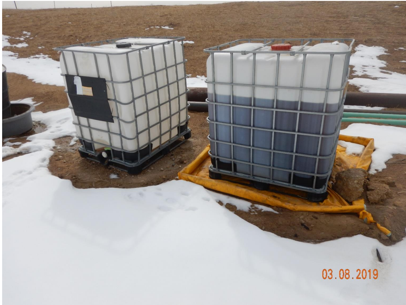
Photo 25: Photo taken from the southeast corner of the pad. Photo shows two (2) 300 gallon tanks. Tanks have not been properly stored in sufficient secondary containment. This is not proper materials management.