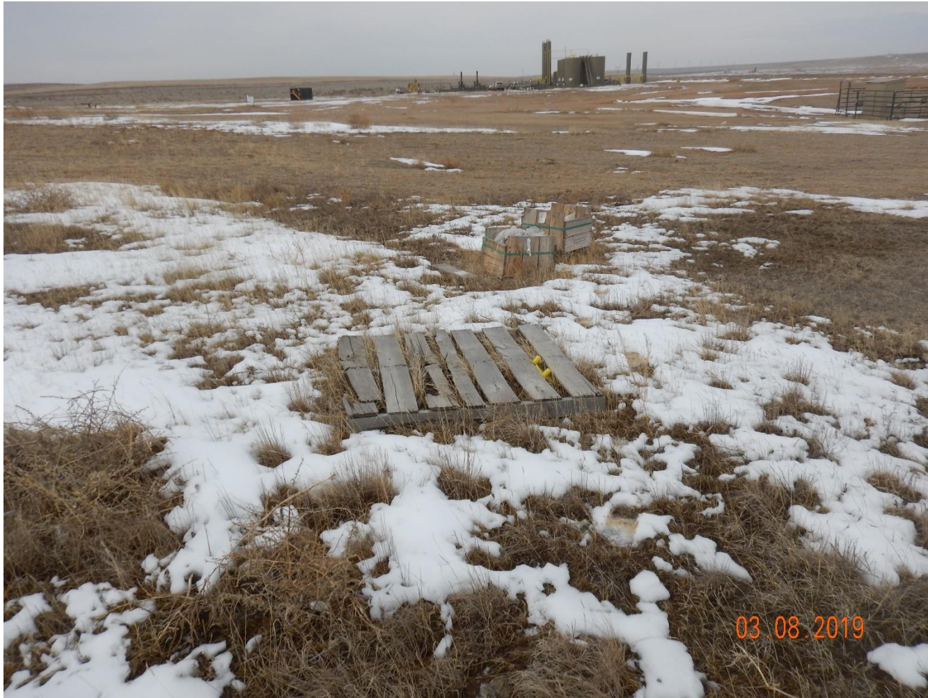
Photo 23: Photo taken from the east end of the location, facing west. Photo shows various trash debris/materials being stored off location.