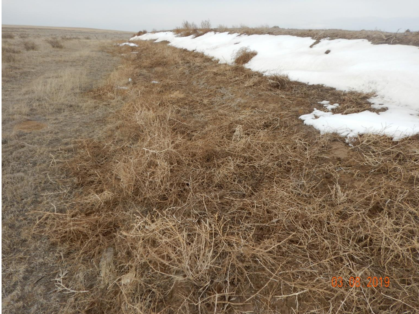
Photo 4: Photo taken from the south end of the topsoil stockpile. Photo shows operator has failed to prevent weed establishment in accordance with 1002.c.