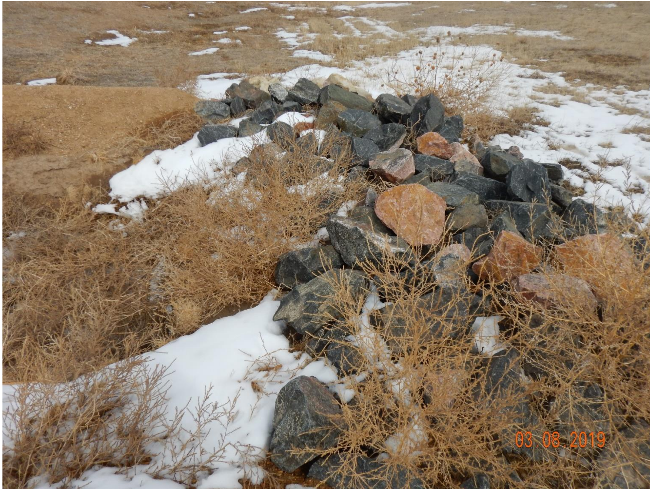
Photo 17: Photo taken from the sediment trap on the northeast corner of the location. See comments under photo 9.