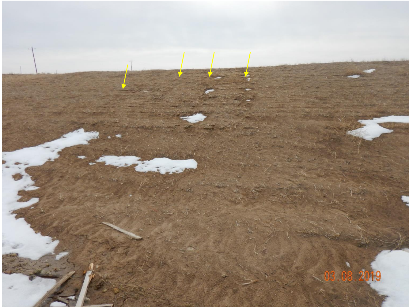
Photo 27: Photo taken from the cut slopes on the south end of the location. Photo shows slopes are predominantly bare and exposed soil. Aeolian deposition evident and appear to have covered any vegetation that has germinated. Stormwater erosion degradation is becoming evident.