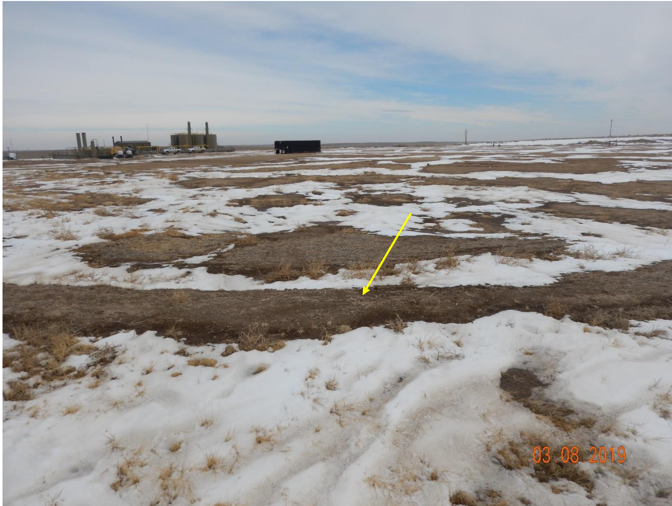
Photo 7: Photo taken from the southwest corner of the location, facing northeast. Photo provides overview of the location. Photo also shows shallow berm on the southwest end of the location.