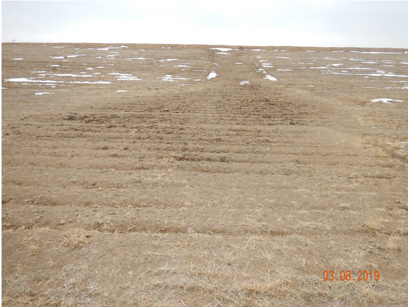
Photo 15: Photo taken from the north end of the location. Photo shows area where prior erosion degradation appears to have been repaired.