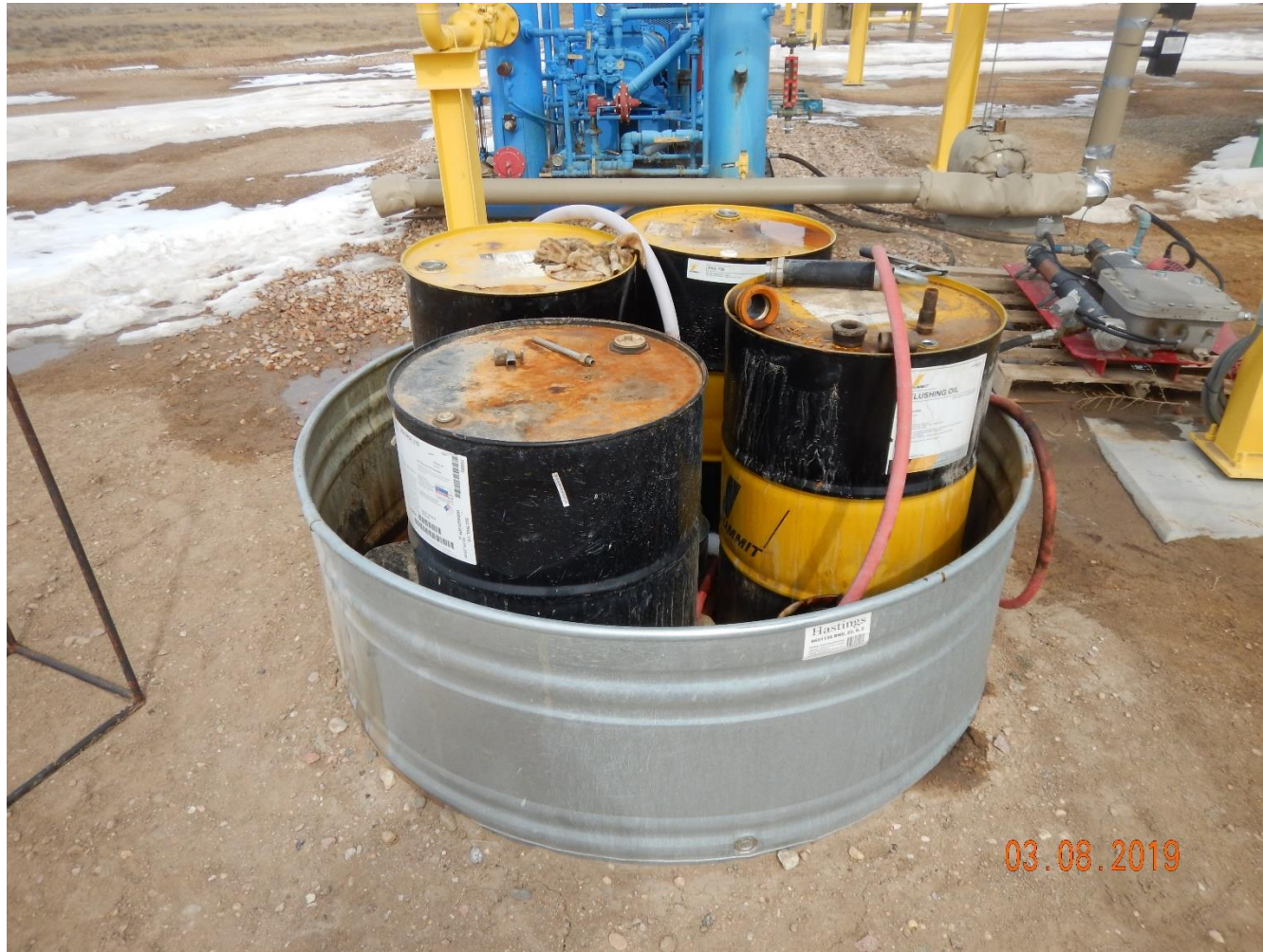
Photo 24: Photo shows barrels on location properly stored in sufficient secondary containment. This is proper materials management.