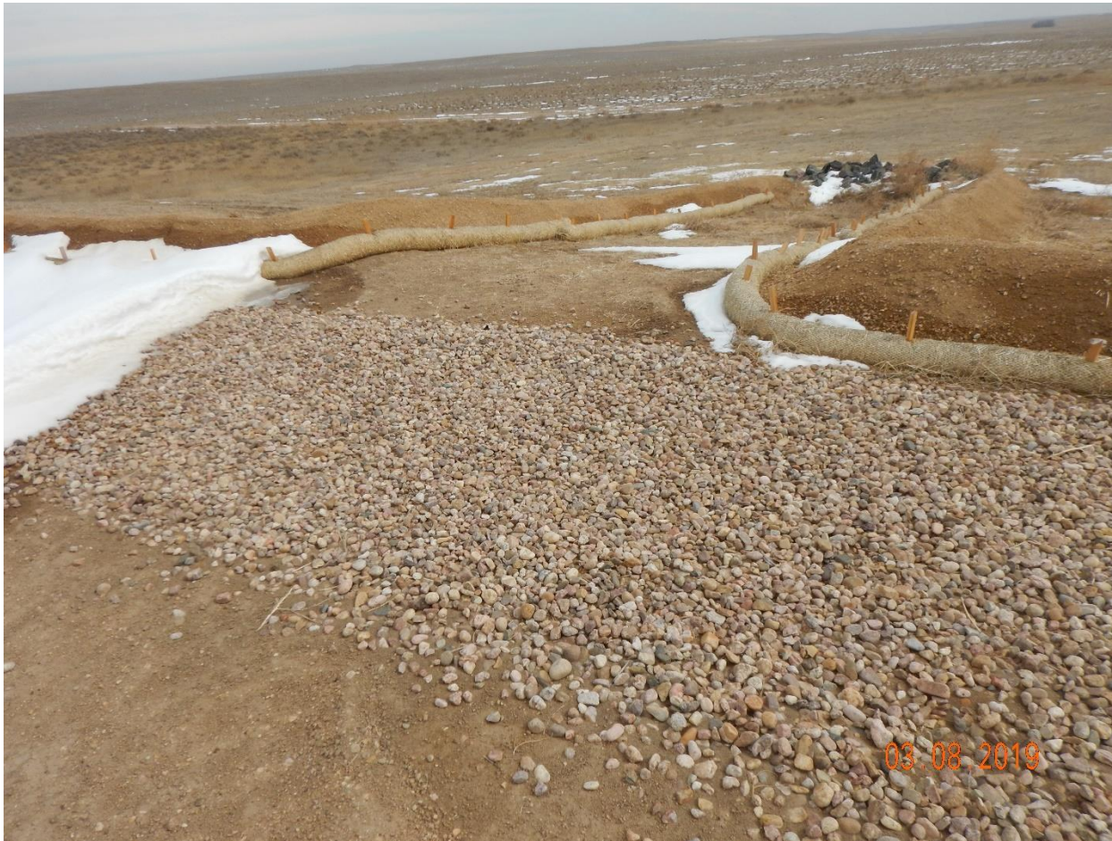
Photo 18: Photo taken from the sediment trap on the northeast corner of the location. See comments under photo 9.