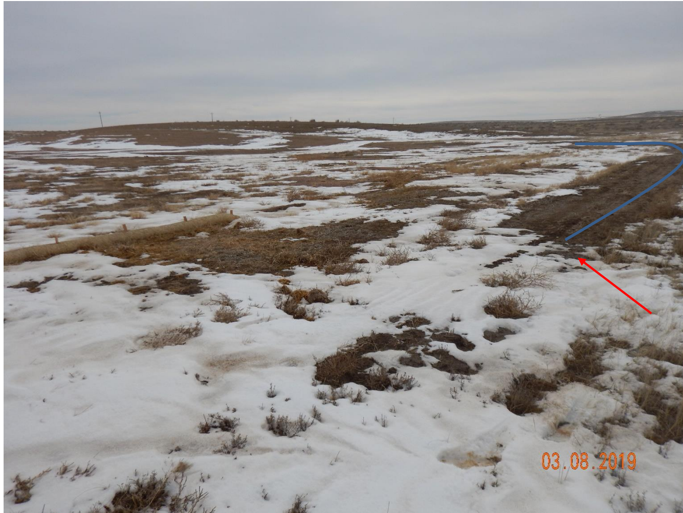
Photo 8.b: Continued from photo 8. Photo shows shallow berm (blue) on the southwest end of the location. Berm travels north a couple hundred of feet and promptly ends (red arrow). There does not appear to be sufficient stormwater and erosion control BMPs at the end of berm to mitigate erosion degradation and sediment laden free stormwater discharge from location.