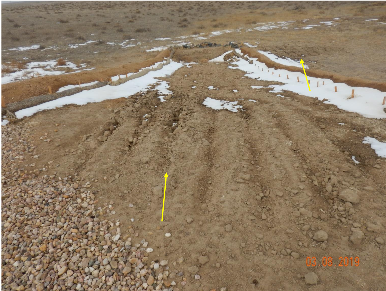
Photo 10: Photo taken from top of the sediment trap on the northwest corner of the location. Operator appears to have ripped the slope of, and areas around, the sediment trap. Ripping has been conducted in such a manner to promote stormwater erosion degradation rather than mitigate it.