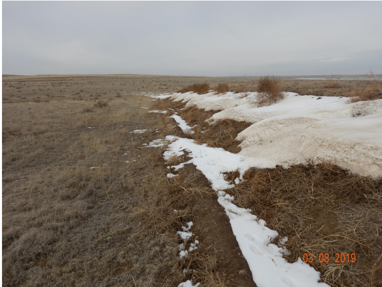
Photo 5: Photo taken from the south end of the topsoil stockpile. Photo shows operator has failed to prevent weed establishment in accordance with 1002.c. Photo also shows what appear to be a shallow ditch on the south end of the stockpile. Ditch does appear to have been constructed in accordance with good engineering practices, and does not appear to be sufficient. There does not appear to be any stormwater and erosion control BMPs on the east and west end of the topsoil stockpile. Stockpile is predominantly undesirable weedy plant species such as Russian Thistle and Kochia.