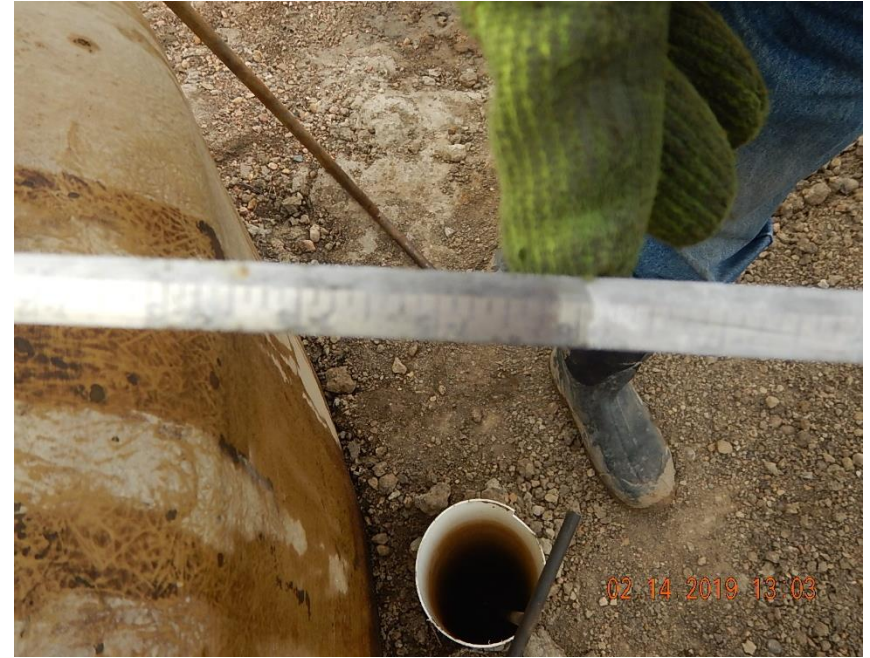
Produced water tank integrity testing; gauge reading at approx. 48 hrs. No drop in fluid level – Test Deemed Satisfactory