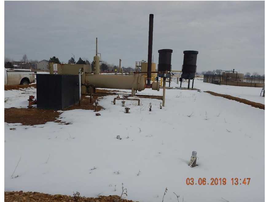
Unused/ inactive flowline risers; Per COGCC rule 603.f. inactive flowline risers to be removed by operator in 30 days; View looking East