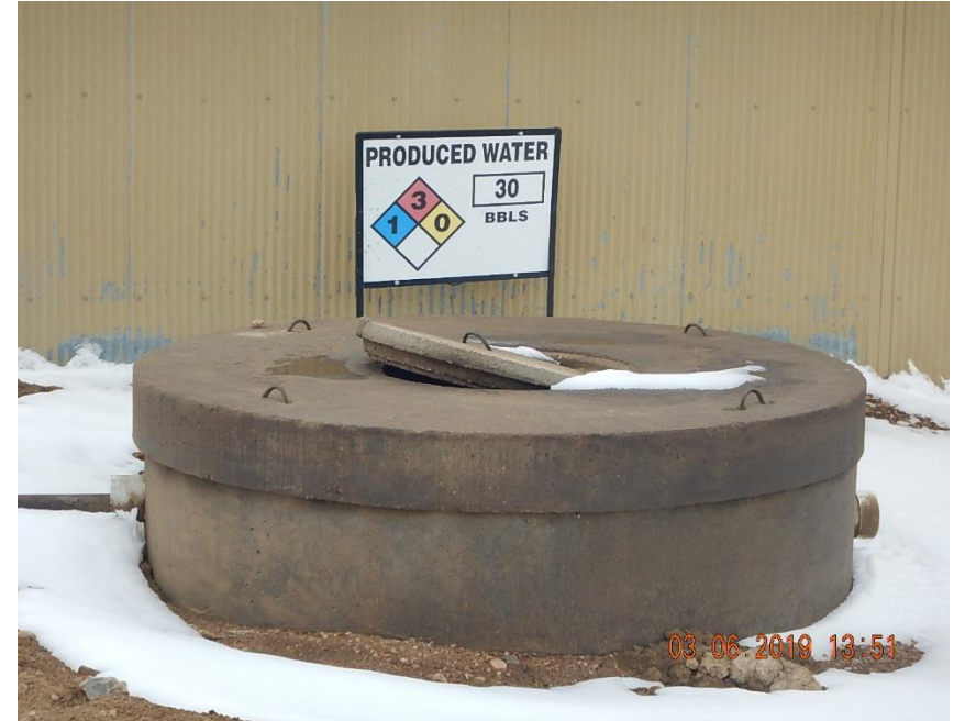
30 bbl concrete produced water vault on East side of location; Access cover needs to be re-installed