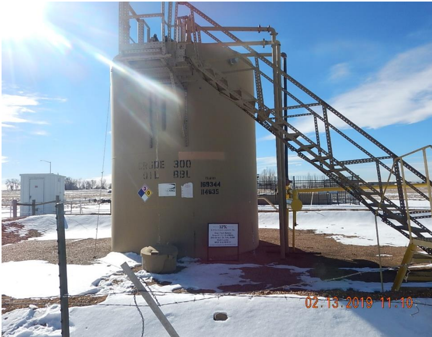
K.P. Kauffman signage at tank battery