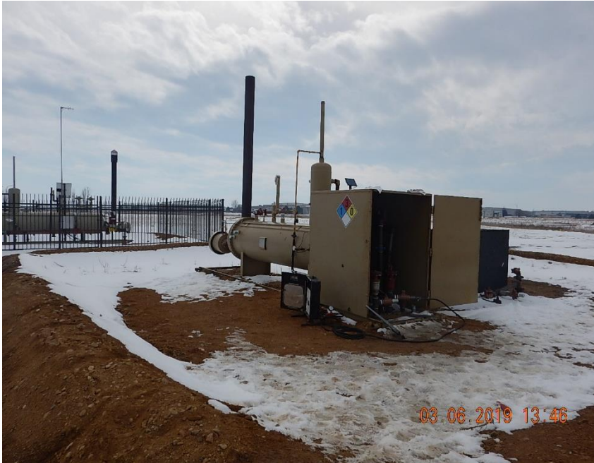
Pressure testing in progress at the heated horizontal separator on the produced water and crude oil dump flowlines; Chart recorder documenting results