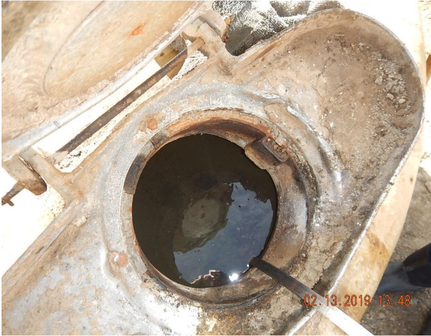
Produced water tank integrity testing – measuring fluid level during second day of test