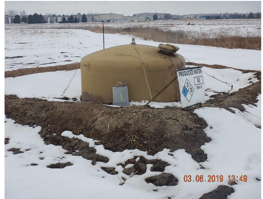
Fiberglass PBV - 50 BBL Produced Water Tank