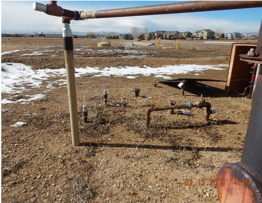
Unused/ inactive flowline risers; Per COGCC rule 603.f. inactive flowline risers to be removed by operator in 30 days; View looking West