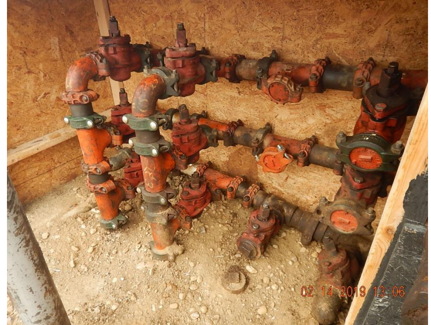
Repairs completed to flowline manifold following day; Leaking valves removed; housekeeping completed