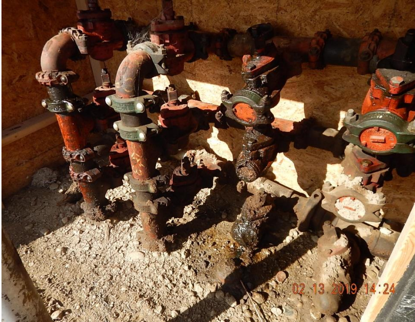
Active fluid leak observed at flowline manifold/ header