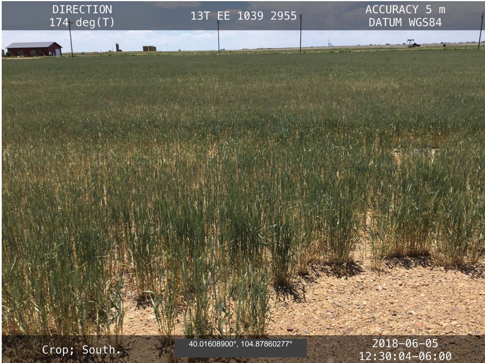
Crop Vegetation Photo Point