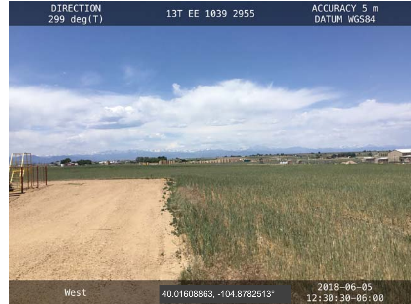
East of Disturbance - Facing West