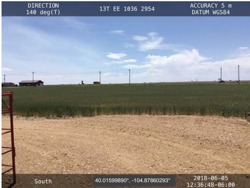
North of Disturbance - Facing South