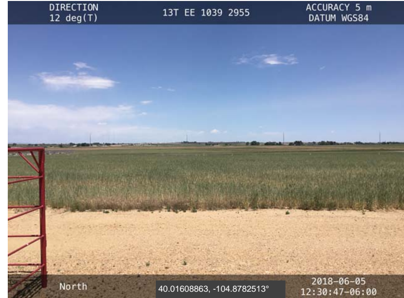
South of Disturbance - Facing North