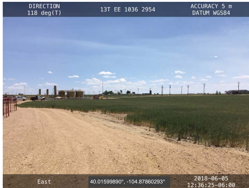
West of Disturbance - Facing East