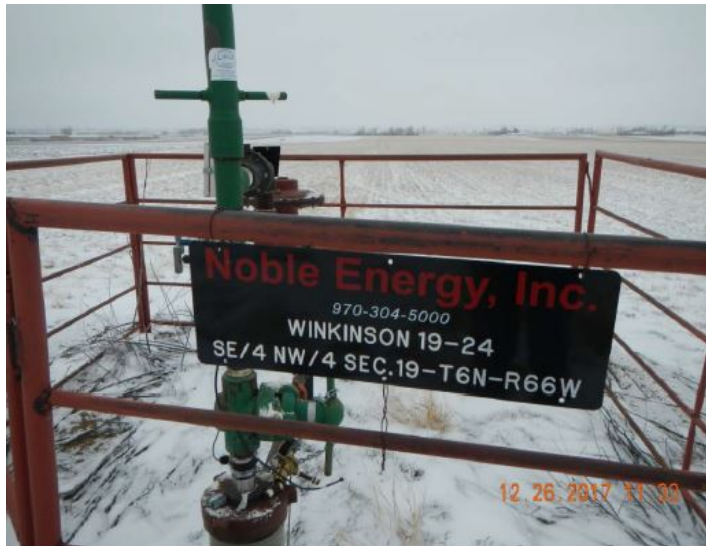
Wellhead sign on 12/26/2017