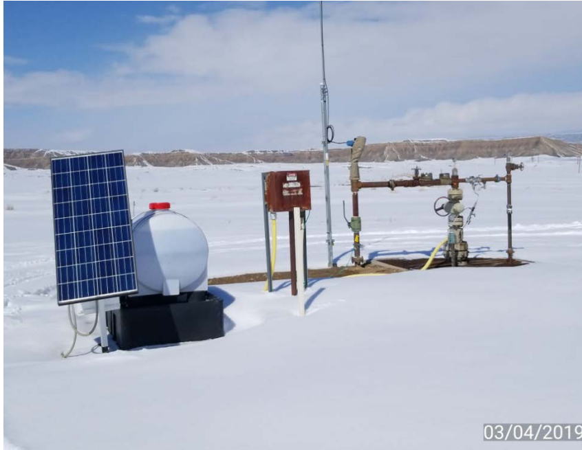
Photo 1. Location looking north.