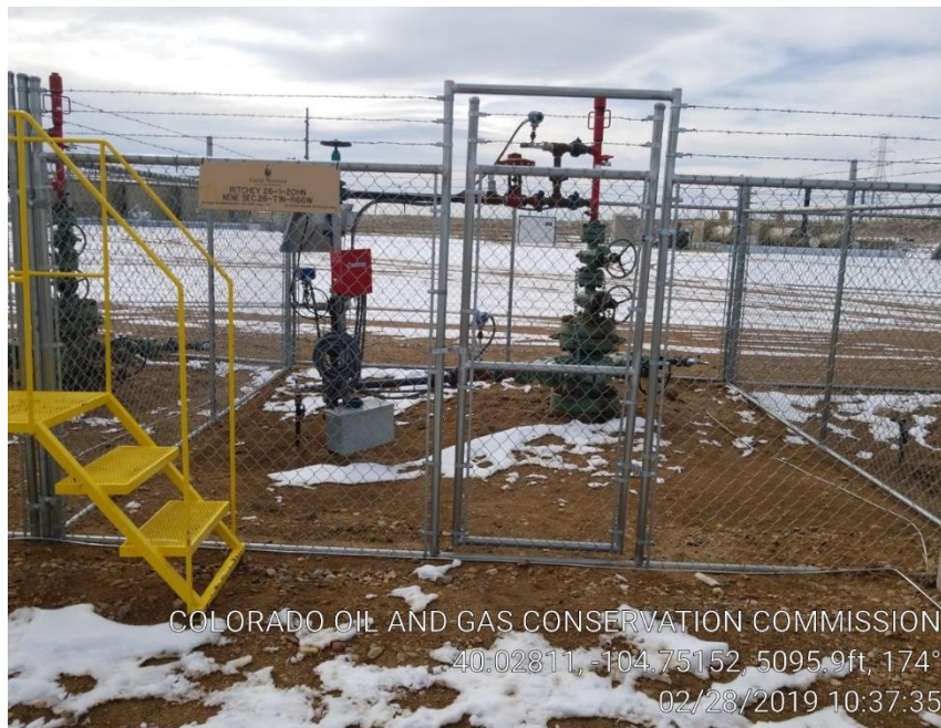
Location Picture 1