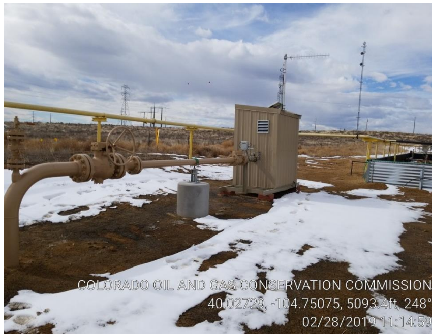
Location Picture 15