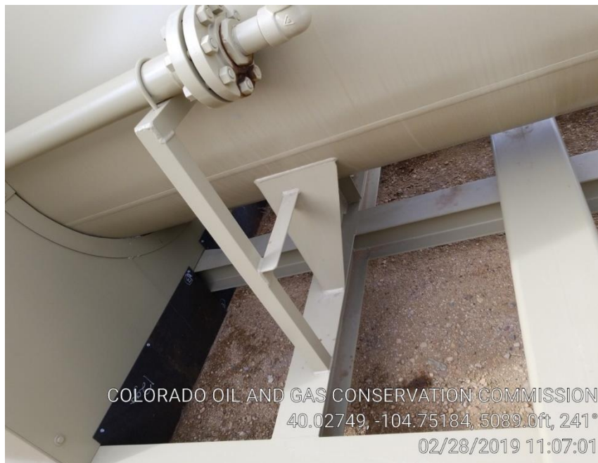
Location Picture 11