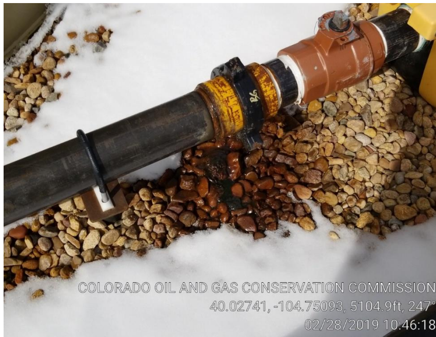
Location Picture 3