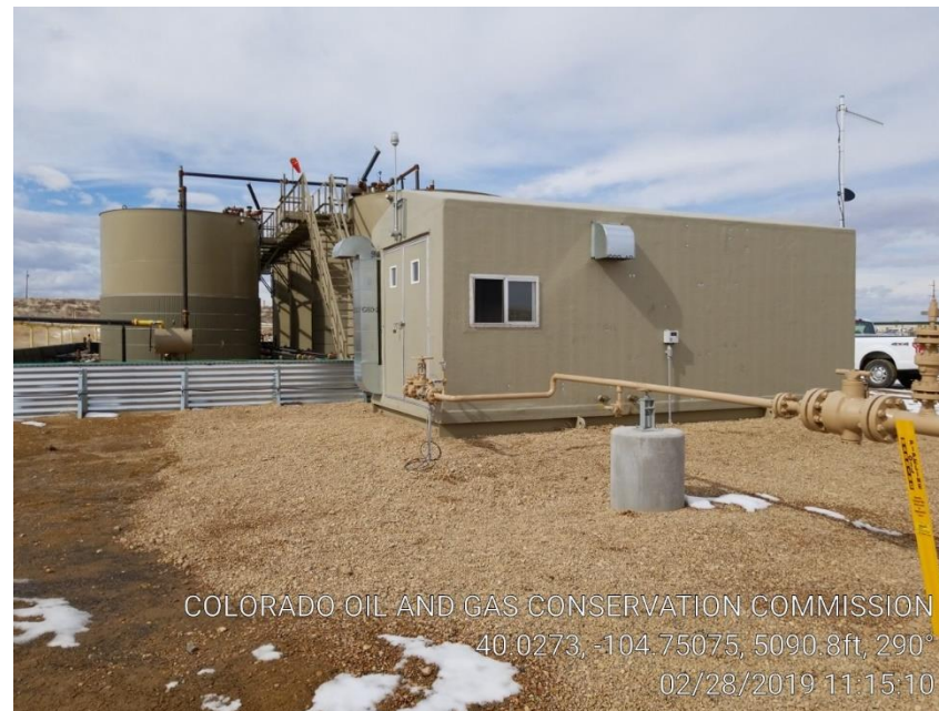
Location Picture 16