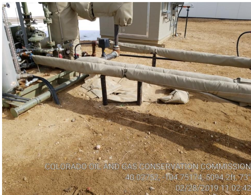
Location Picture 9