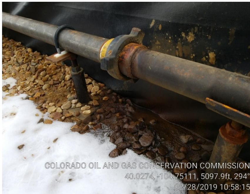
Location Picture 7