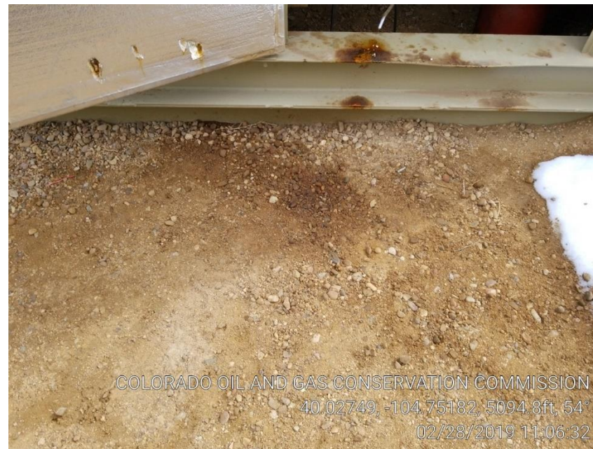
Location Picture 10