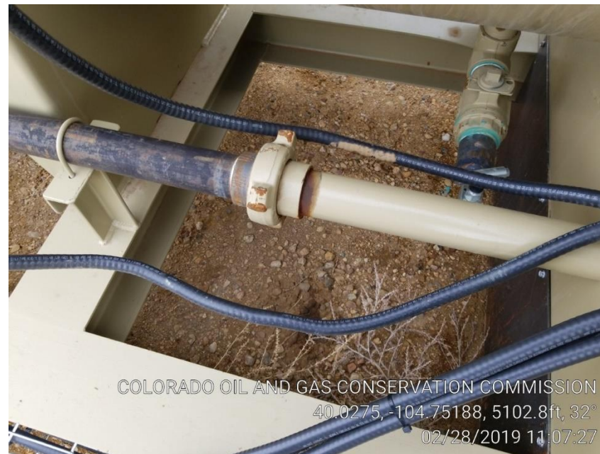
Location Picture 12