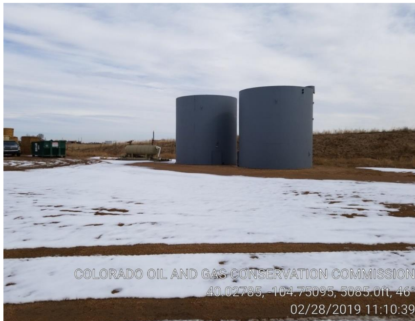
Location Picture 13