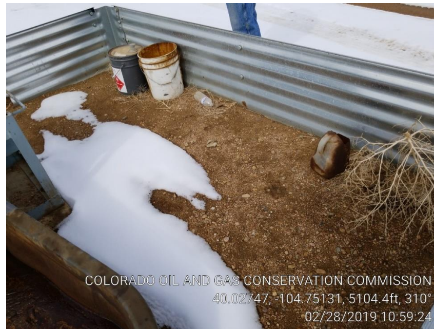
Location Picture 8