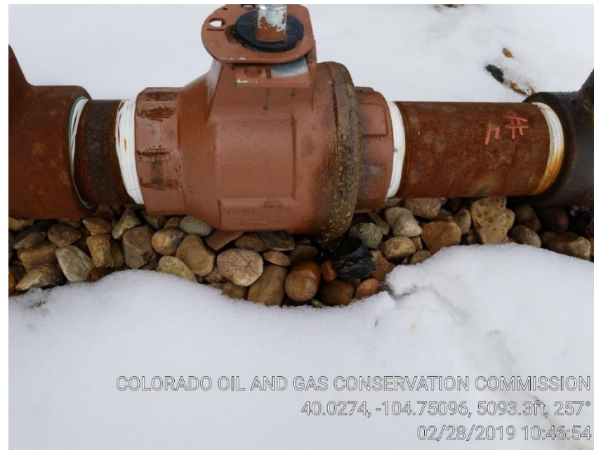
Location Picture 4