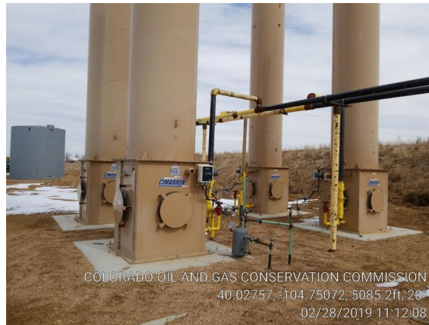
Location Picture 14