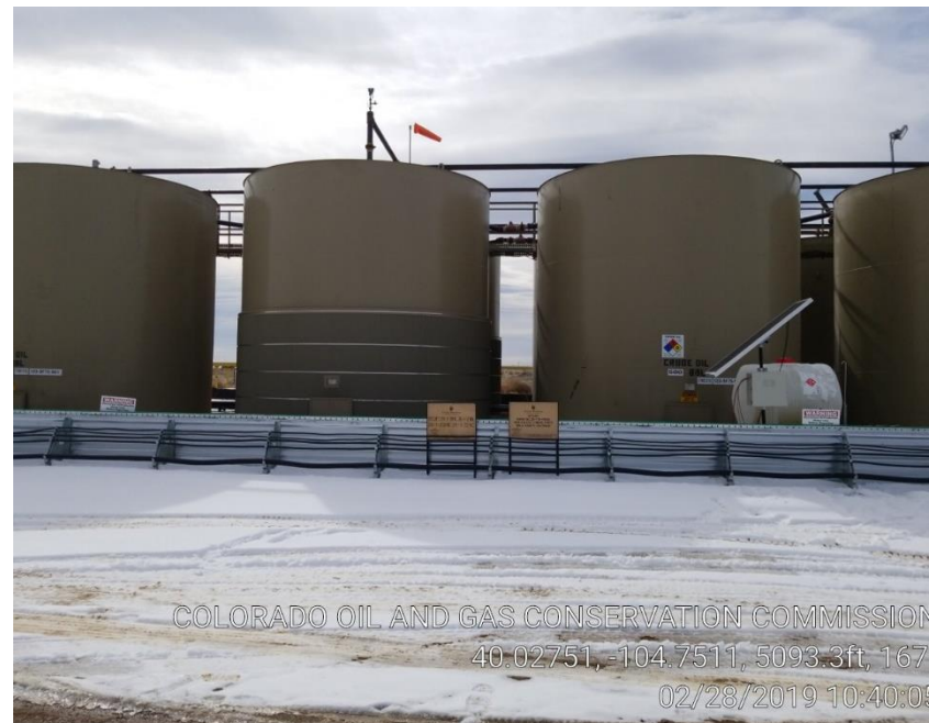
Location Picture 2