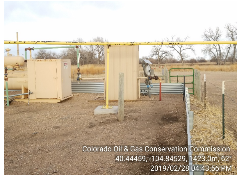
Photo #6 State 6-36, 7-36, 8-36 Separator Area State M 36-3, M 36-5 Unused Gas meter run / riser Have been removed