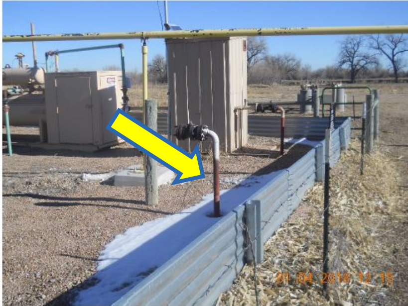
Photo #5 State 6-36, 7-36, 8-36 Separator Area State M 36-3, M 36-5 Unused Gas meter run line / riser from prev. FIR