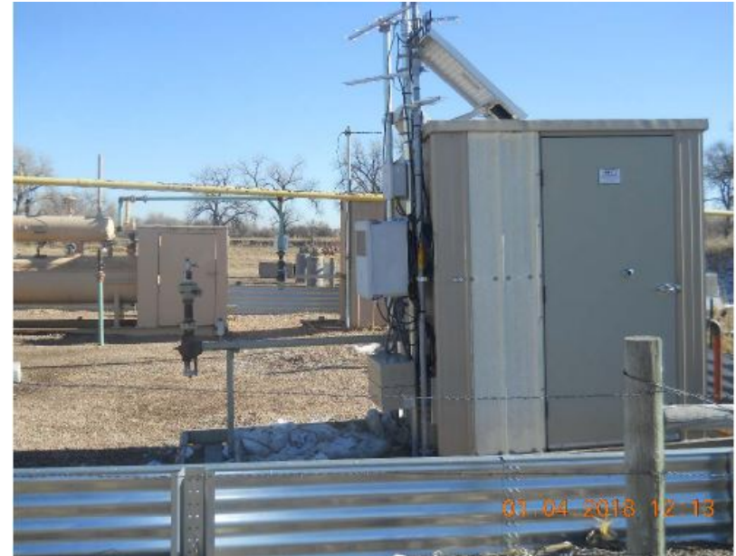
Photo #4 State 6-36, 7-36, 8-36 Separator Area State M 36-3, M 36-5 Unused Gas meter run from prev. FIR