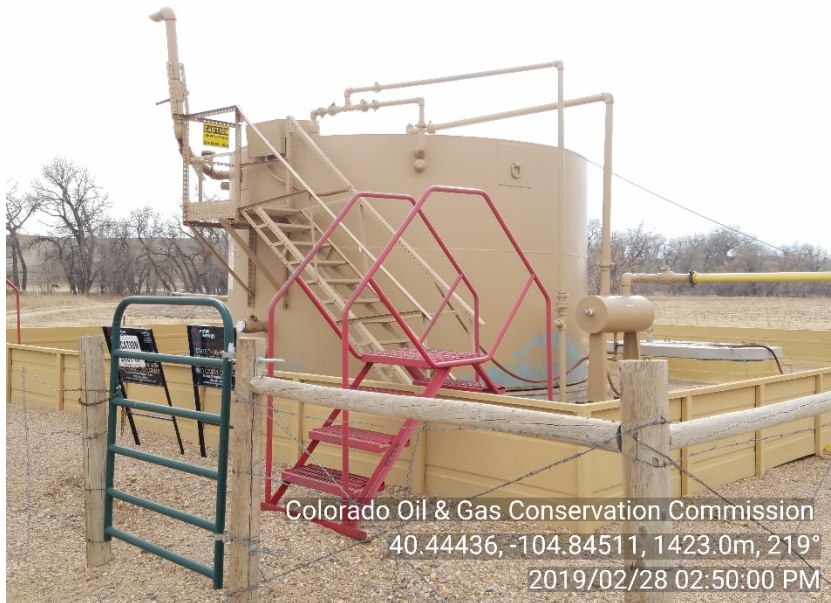
Colorado Oil & Gas Conservation Commission 40.44436, -104.84511, 1423.0m, 219° 2019/02/28 02:50:00 PM