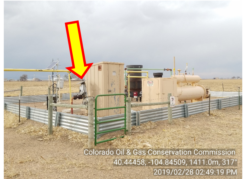
Colorado Oil & Gas Conservation Commission 40.44458, -104.84509, 1411.0m, 317° 2019/02/28 02:49:19 PM