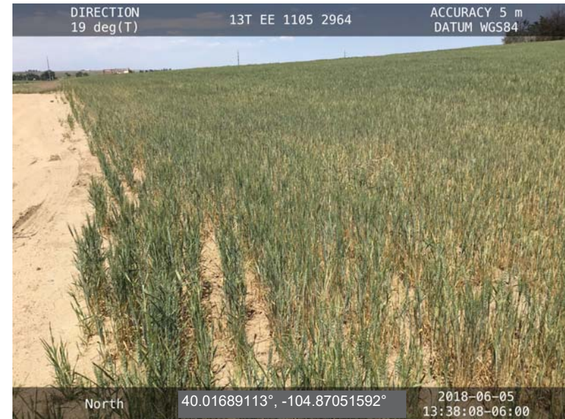
South of Disturbance - Facing North