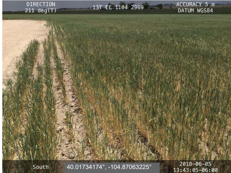
North of Disturbance - Facing South