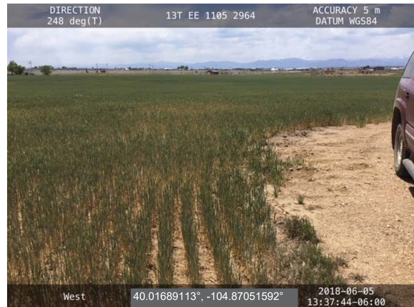
East of Disturbance - Facing West