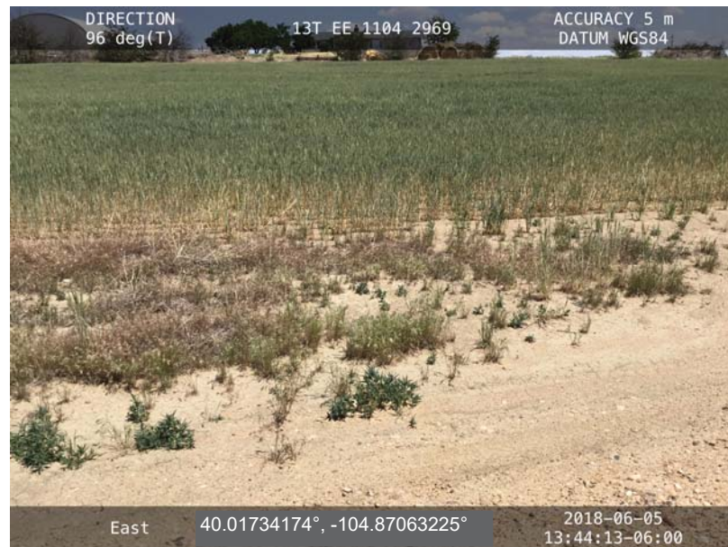
West of Disturbance - Facing East