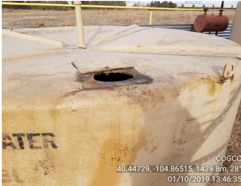
Photo #13 Great Western 35-52 H2O vault Hatch - Open from prev. FIR