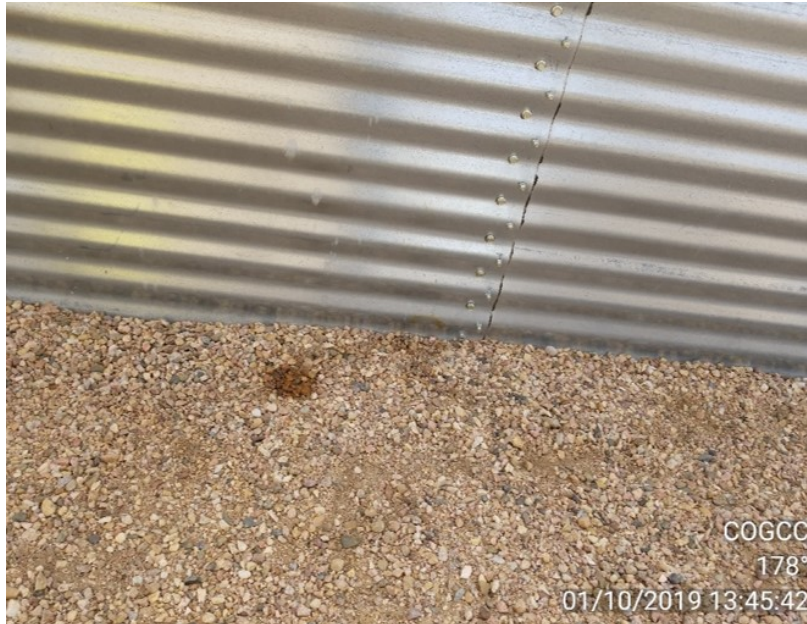
Photo #3 Great Western 35-52 Front tank berm area Stained soil from prev. FIR