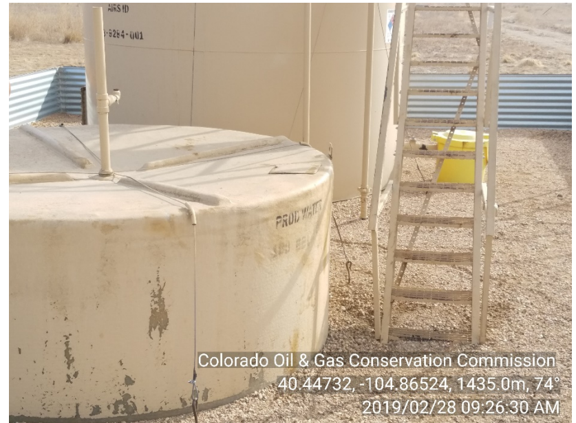
Photo #14 Great Western 35-52 H2O vault Hatch - Closed Stain appears mitigated