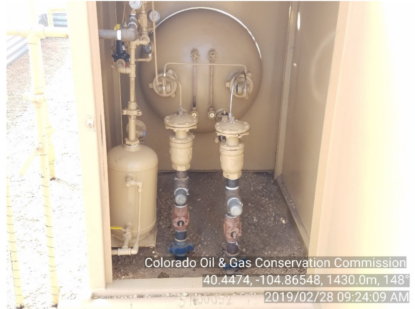
Photo #10 Great Western 35-52 Separator dog house Stained soil Appears mitigated