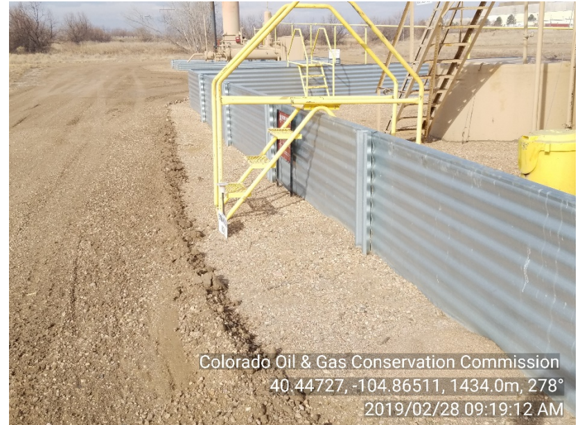
Photo #4 Great Western 35-52 Front tank berm area Stained soil Appears mitigated