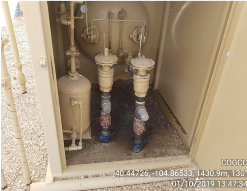
Photo #9 Great Western 35-52 Separator dog house Stained soil from prev. FIR