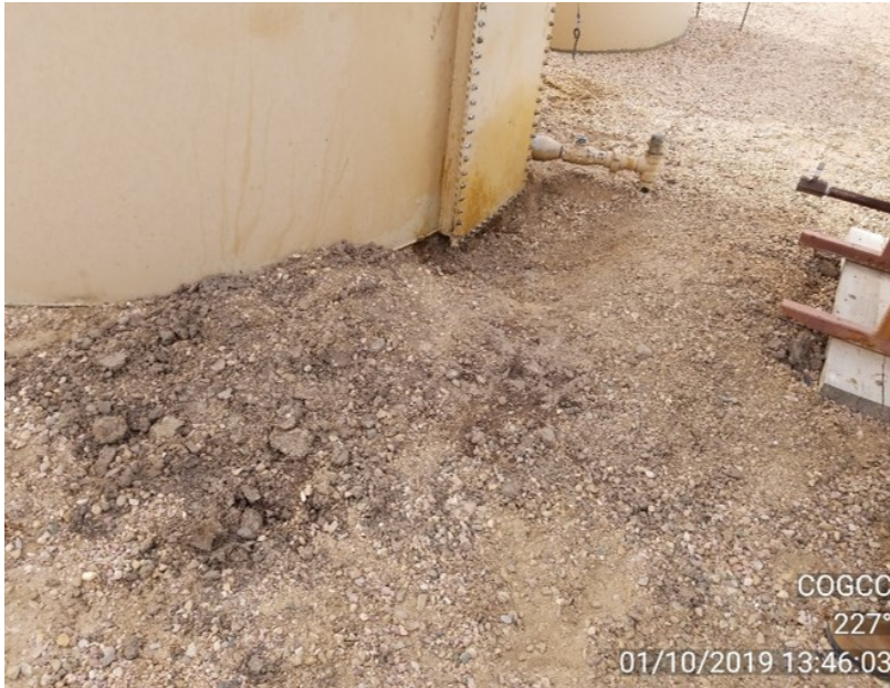
Photo #7 Great Western 35-52 Crude oil tank rear Stained soil from prev. FIR