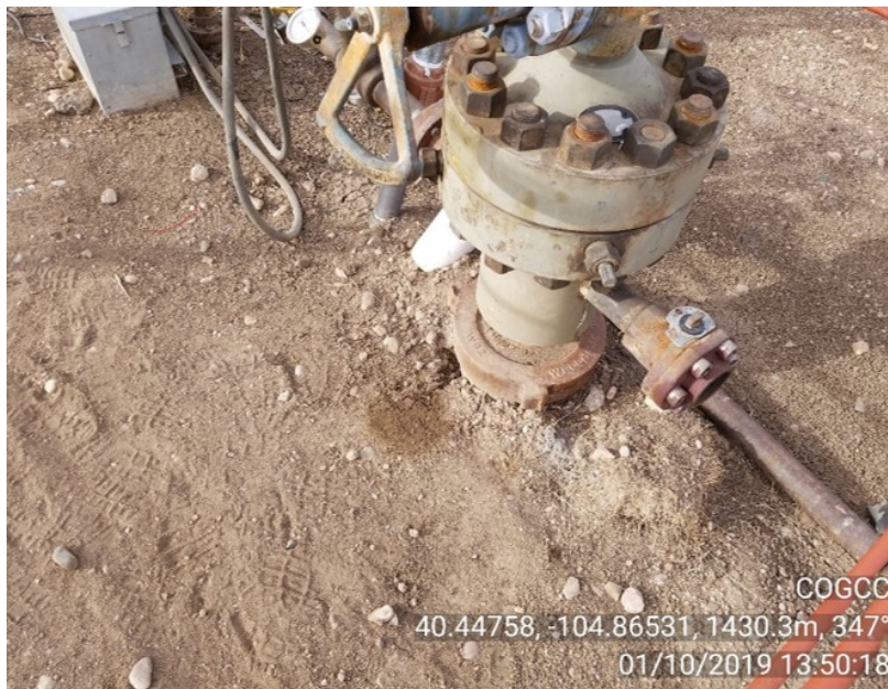
Photo #11 Great Western 35-52 Wellhead Stained soil from prev. FIR