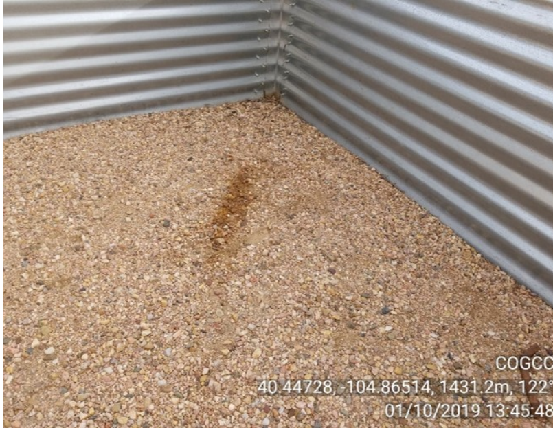
Photo #5 Great Western 35-52 Inside tank berm area Stained soil from prev. FIR