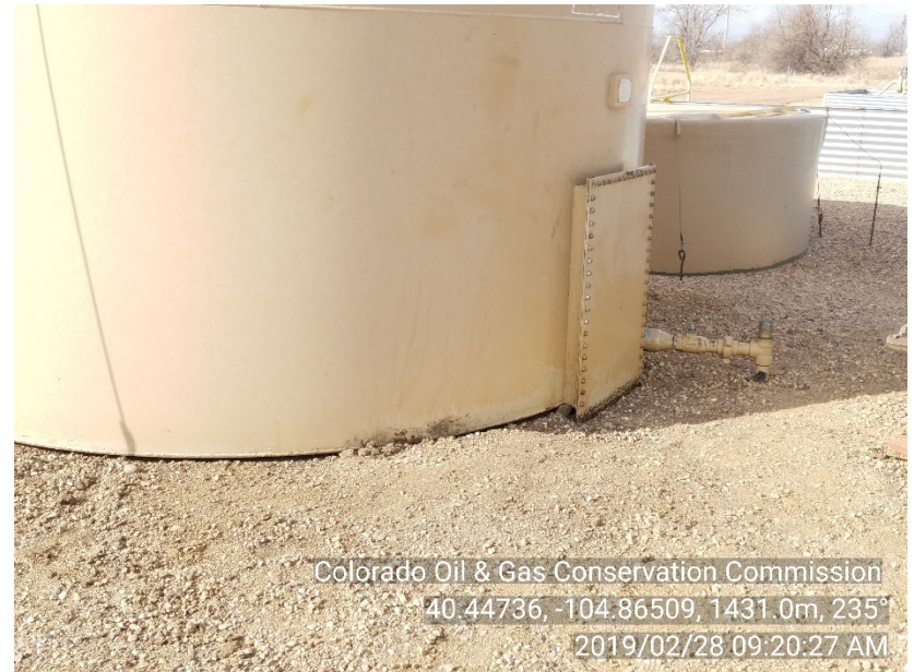
Photo #8 Great Western 35-52 Crude oil tank rear Stained soil Appears mitigated