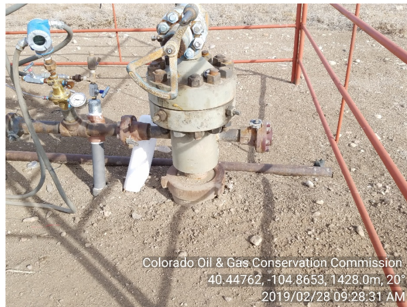
Photo #12 Great Western 35-52 Wellhead Stained soil Appears mitigated