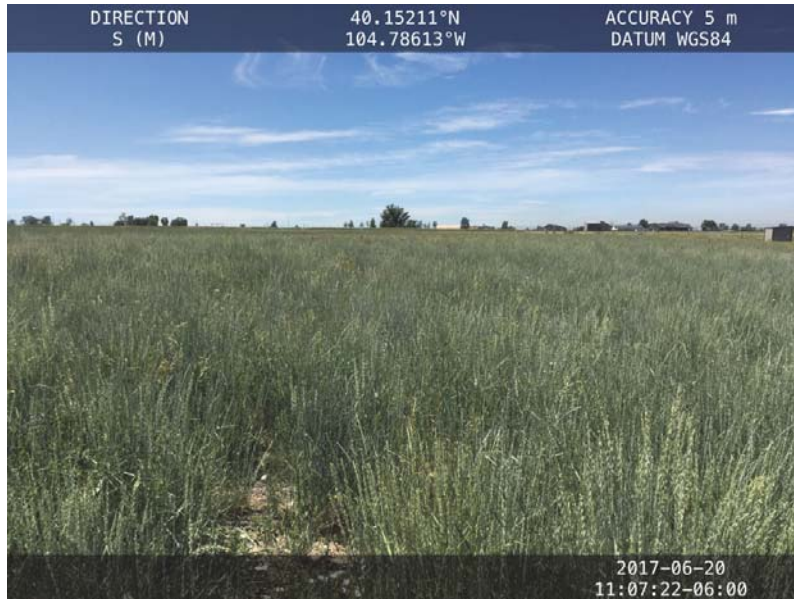
North of Disturbance - Facing South