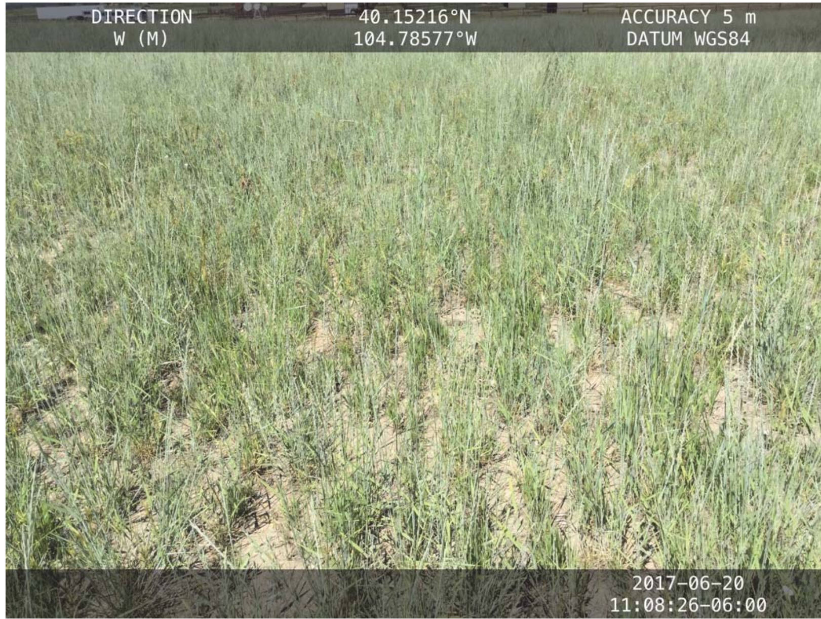
Crop Photo Point