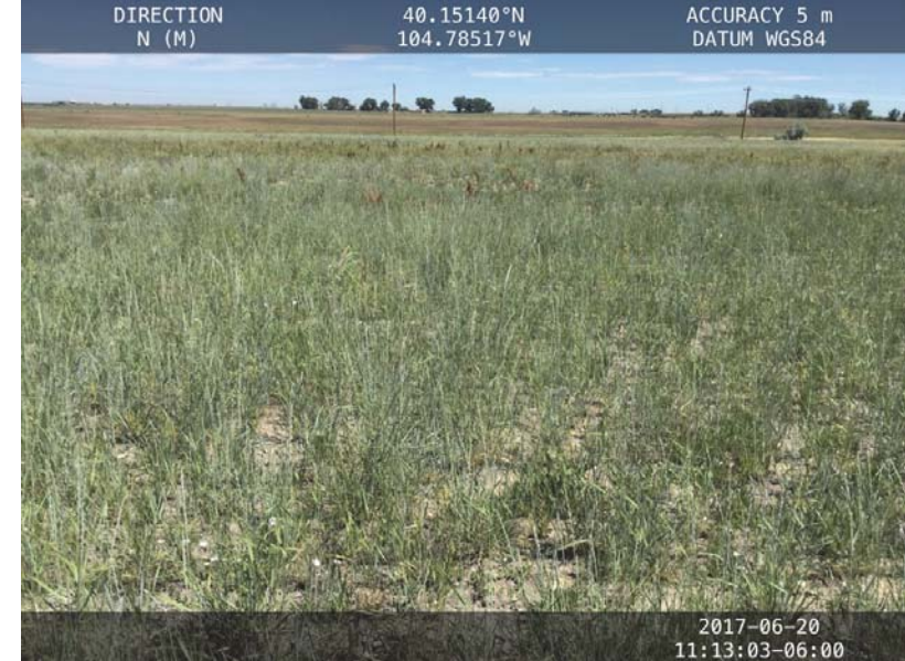
South of Disturbance - Facing North