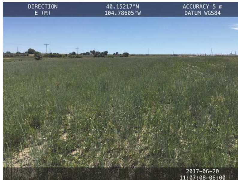
West of Disturbance - Facing East