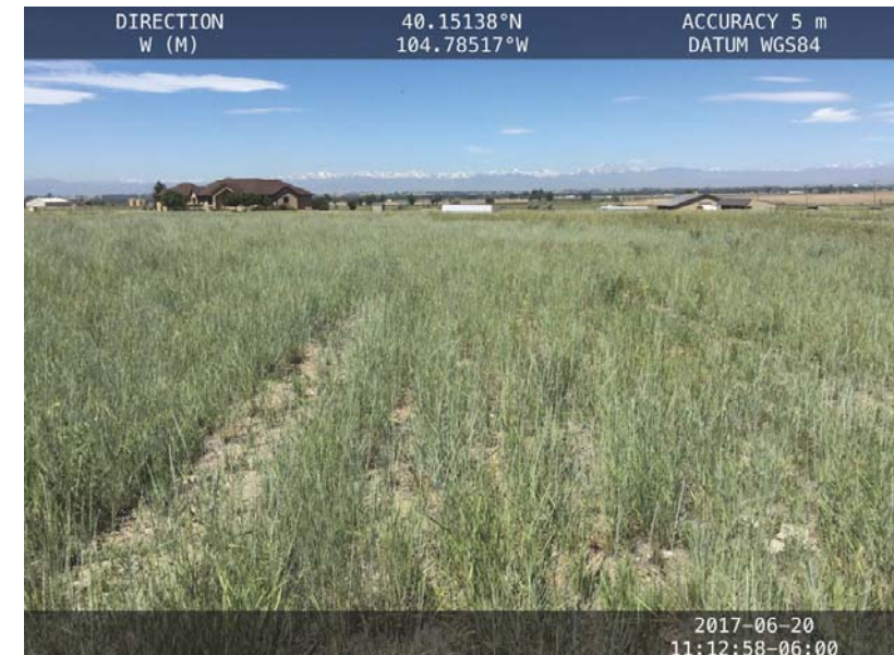
East of Disturbance - Facing West