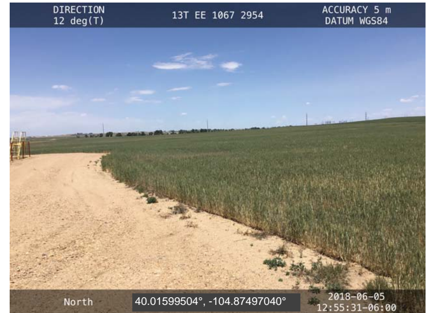
South of Disturbance - Facing North