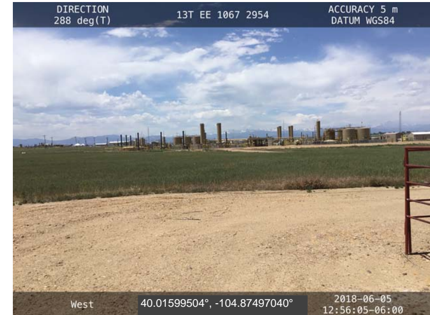
East of Disturbance - Facing West