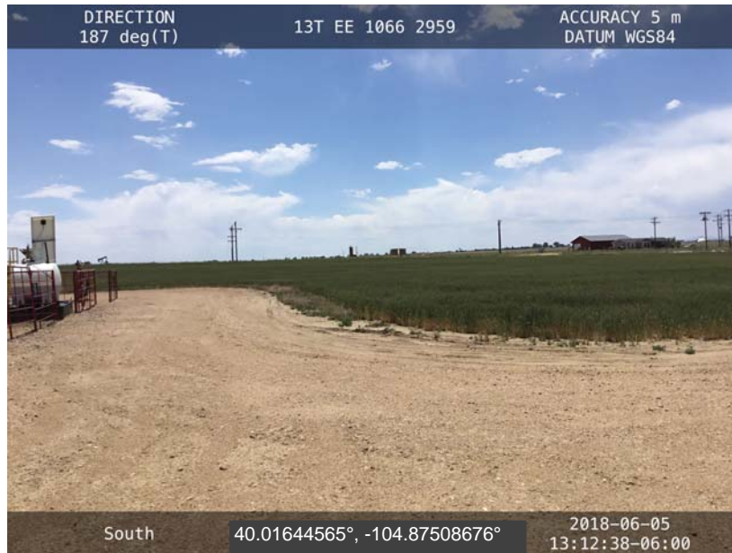
North of Disturbance - Facing South