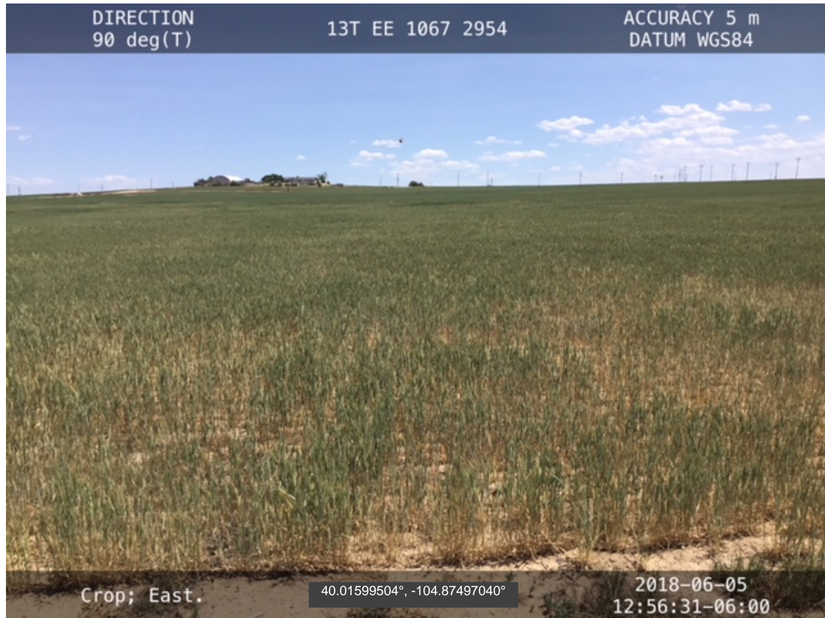
Crop Vegetation Photo Point