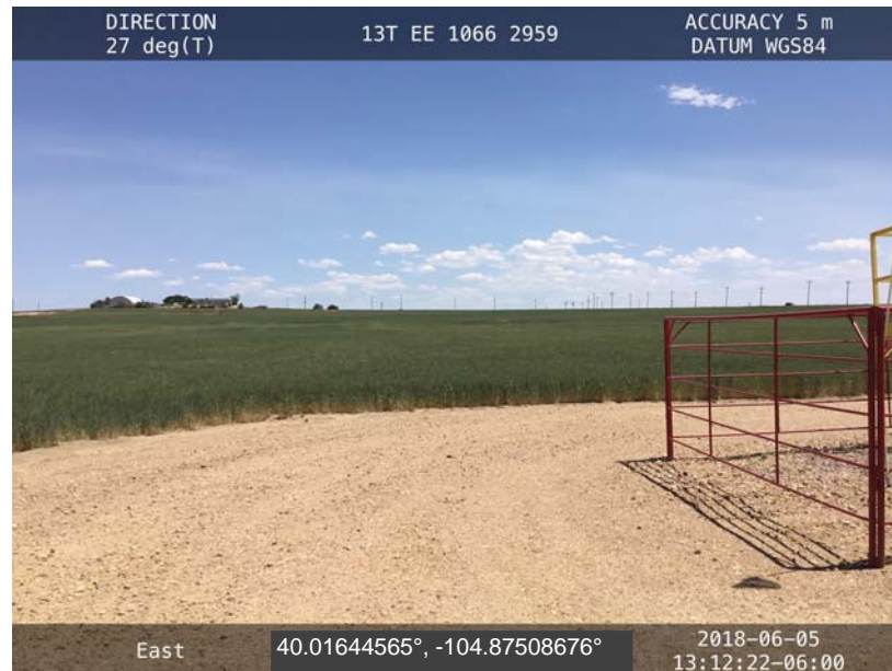
West of Disturbance - Facing East