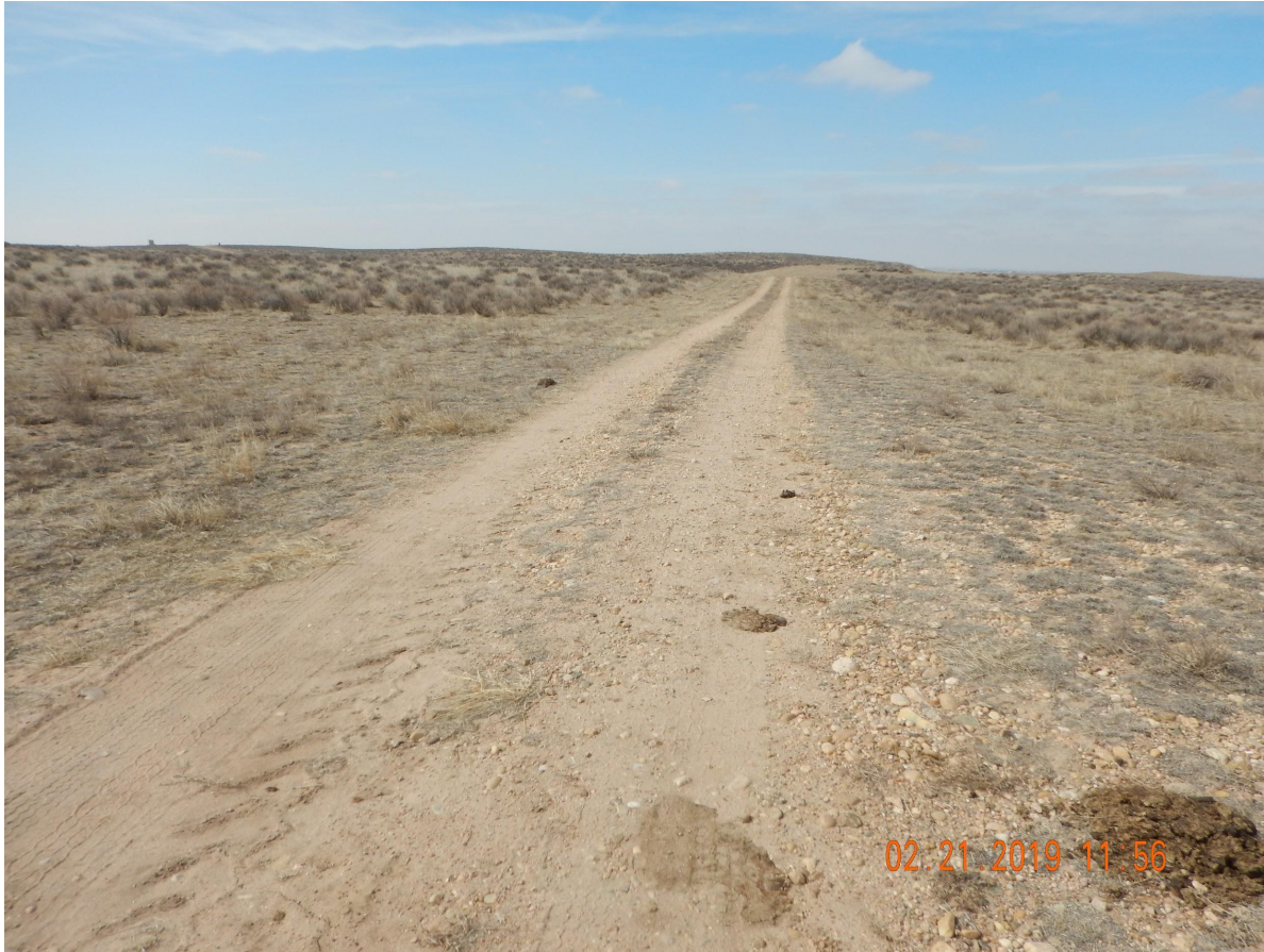
Photo 2. Photo taken from the former PA access road, facing West. Operator has not performed Final Reclamation activities at the access road.