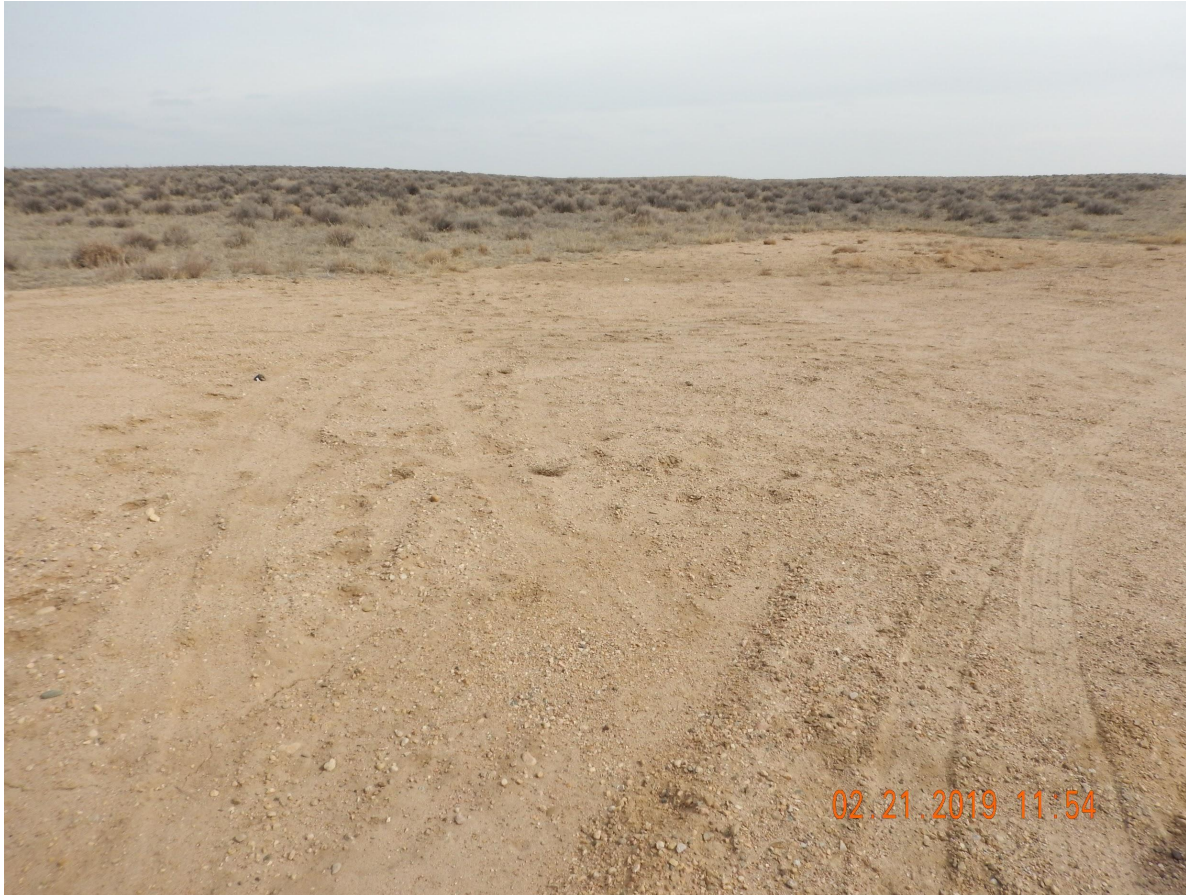
Photo 3. Photo taken from the offsite tank battery, facing East. Operator has not performed Final Reclamation activities at the tank battery. This offsite tank battery location was associated with three wells.