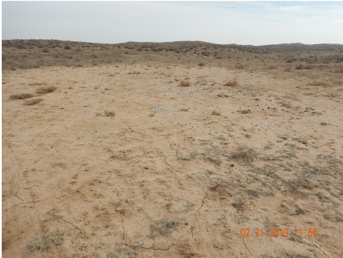
Photo 1. Photo taken from the PA well location, facing East. Operator has not performed Final Reclamation activities at the well location. There is no evidence to suggest that Final Reclamation activities were performed (e.g., drill rows, mulch, or any desirable vegetation).