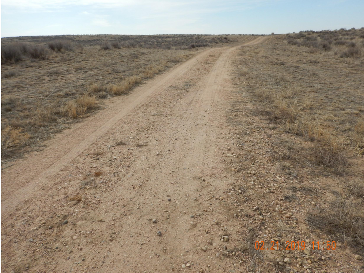
Photo 3. Photo taken from the former PA access road , facing West. Operator has not performed Final Reclamation activities at the access road.