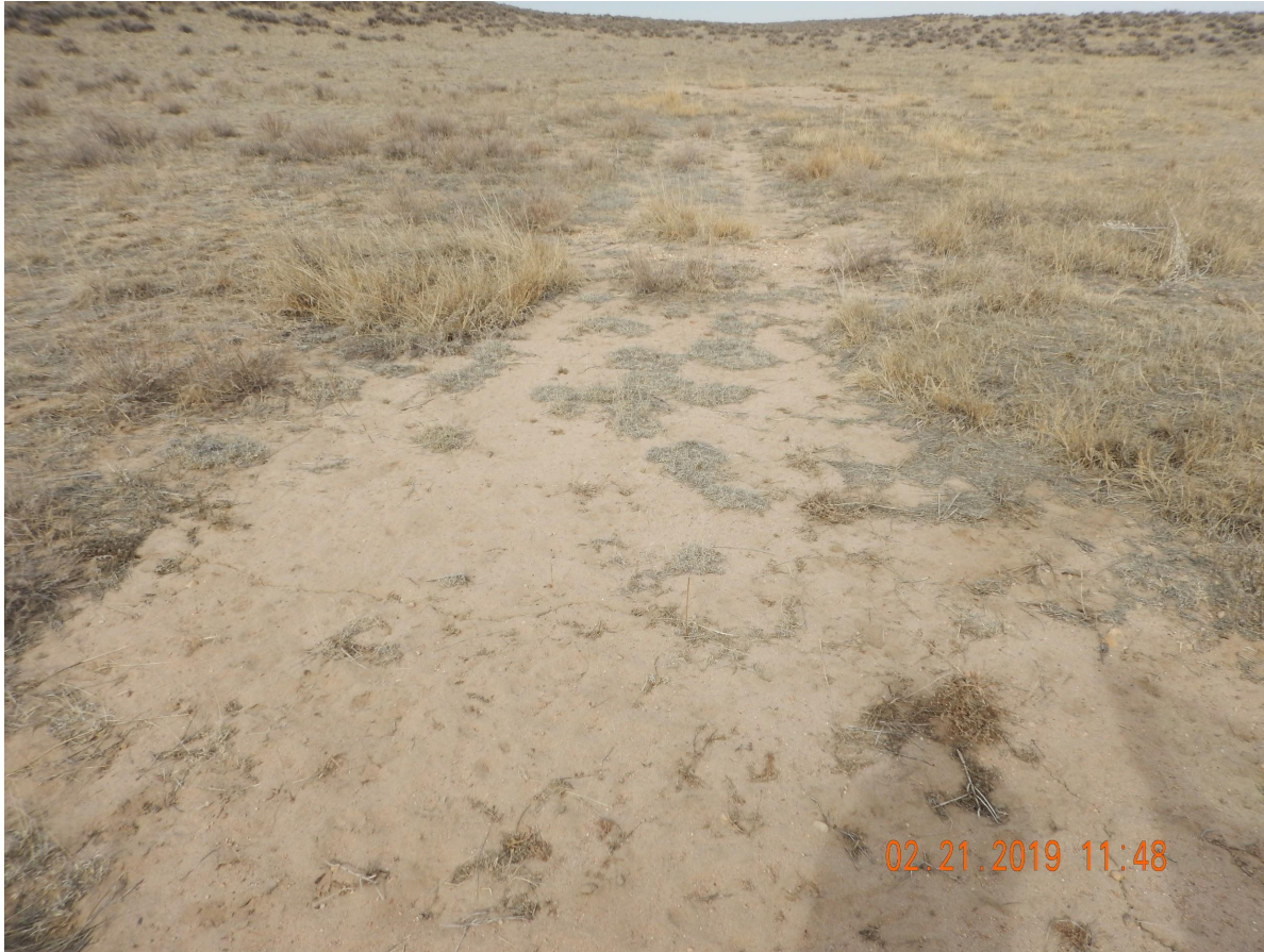
Photo 1. Photo taken from the southern PA location, facing North. Operator has not performed Final Reclamation activities at the well location. There is no evidence to suggest that Final Reclamation activities were performed (e.g., drill rows, mulch, or any desirable vegetation).