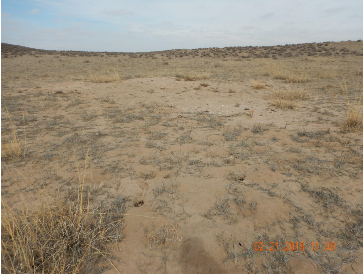
Photo 2. Photo taken from the PA well location, facing North. See comments under Photo 1.