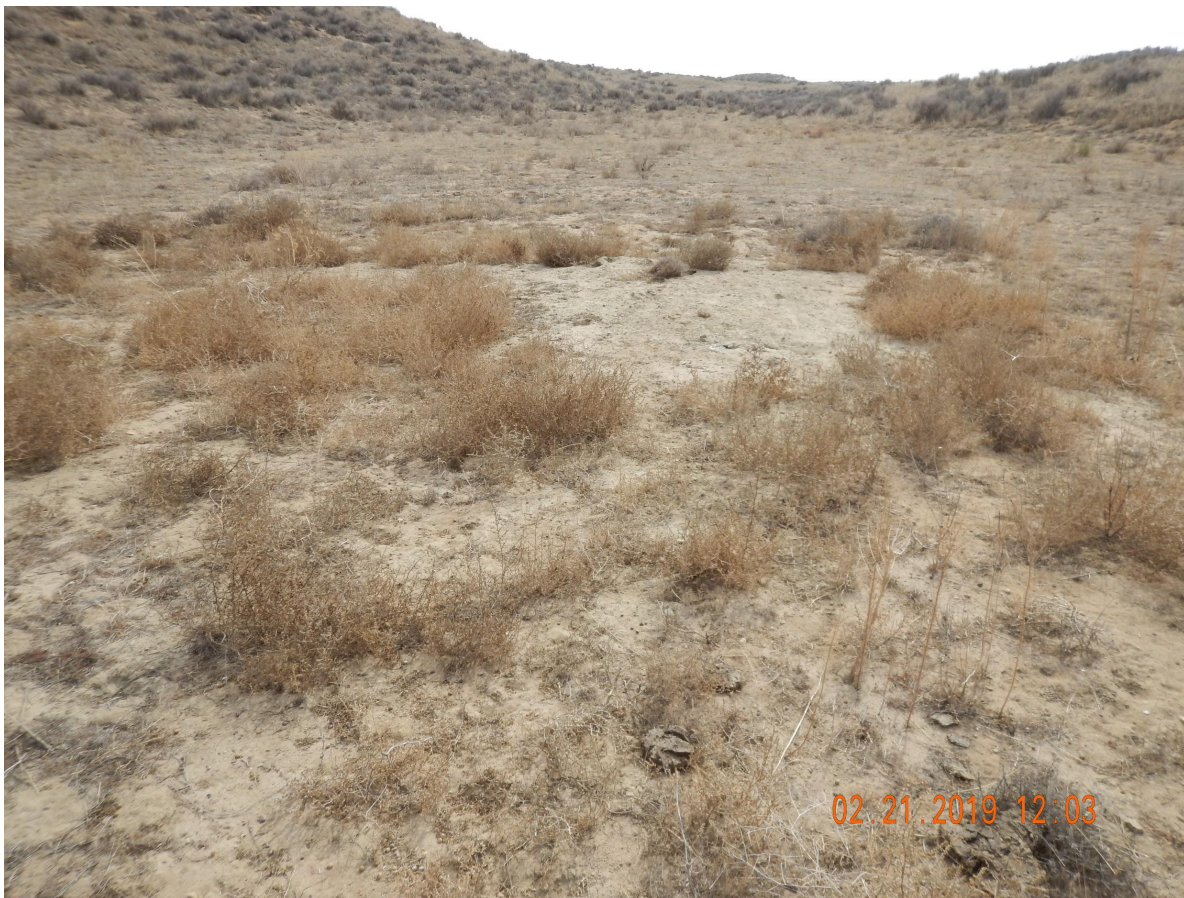
Photo 1. Photo taken from the PA location, facing South. Operator has not performed Final Reclamation activities at the well location. There is no evidence to suggest that Final Reclamation activities were performed (e.g., drill rows, mulch, or any desirable vegetation) and there is no evidence that portions have been contoured back to pre-existing conditions.