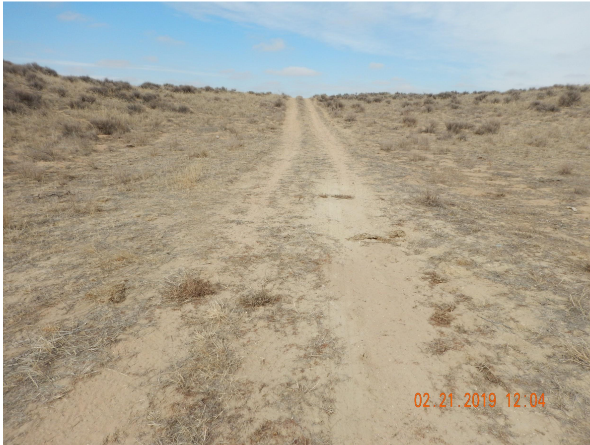
Photo 2. Photo taken from the PA location, facing North. Operator has not performed Final Reclamation activities along the former access road. See comments under Photo 1.