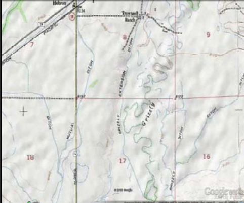
Topographic Map: Courtesy of Google Earth 2015