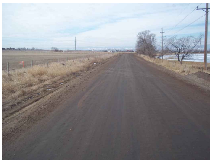
VIEW SOUTHWEST (CR 6)