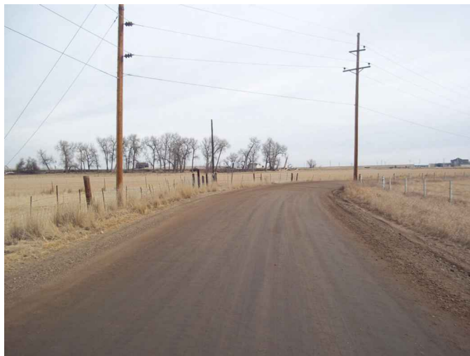
VIEW NORTHEAST (CR 6)

SECTION: 28 TOWNSHIP: 1N RANGE: 66W 6TH. P.M. WELD COUNTY, CO DATE: 2/22/2019