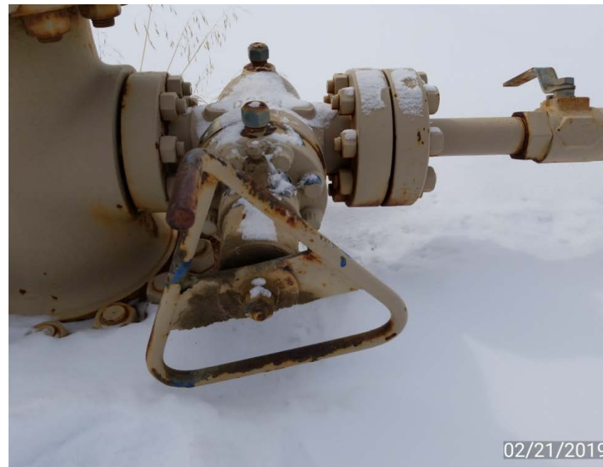
Photo 2. Casing well head valve leaking gas.