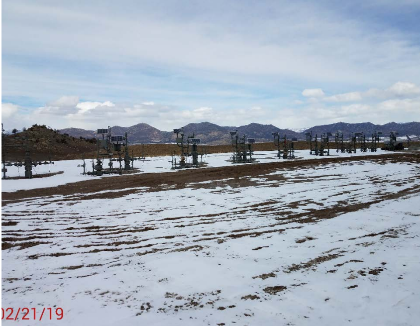
Location Photo #3