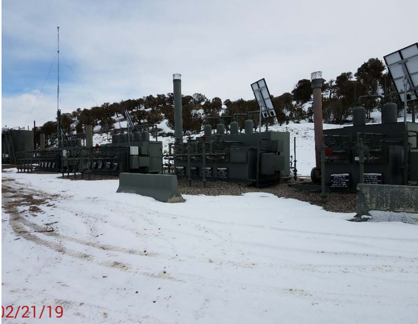
Location Photo #1