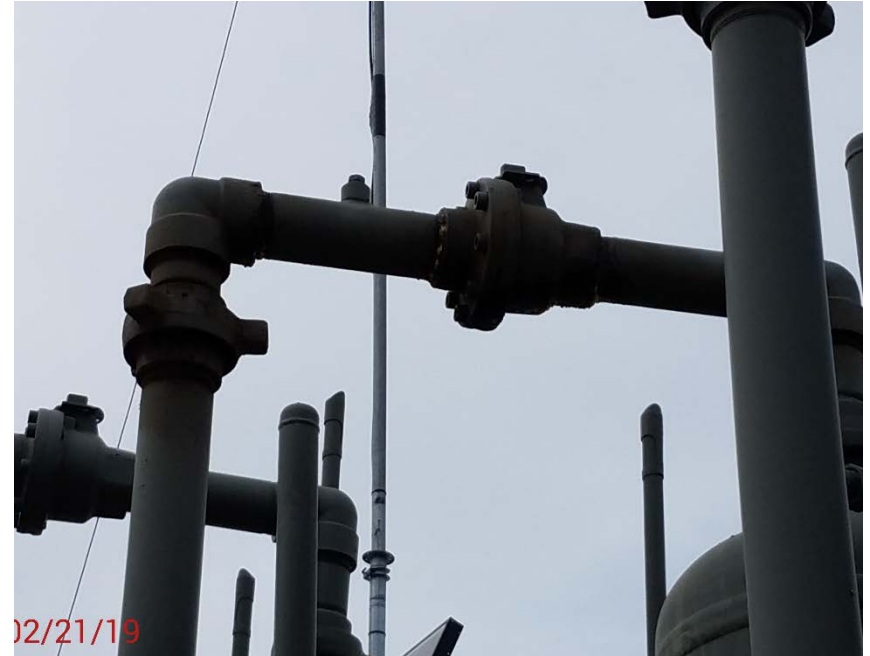
Location Photo #6, Drip on the top flow line of vessel.