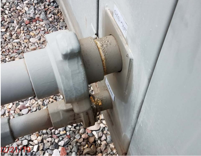
Location Photo #7, Drip on gas out line, unit 24-12AA.