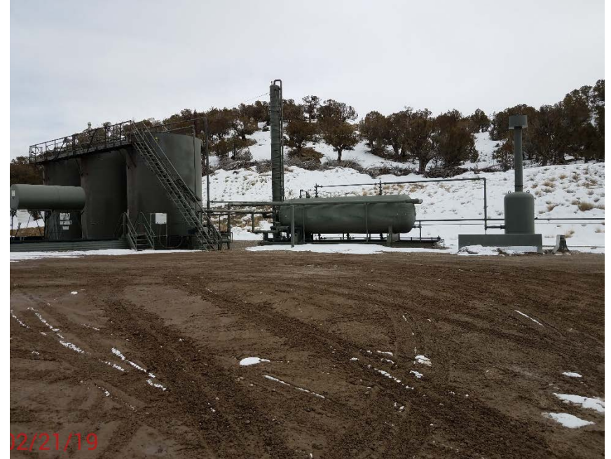
Location Photo #2