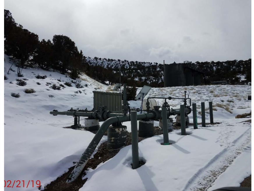
Location Photo #4