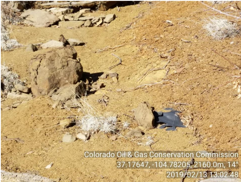
PHOTO 11: PIECES OF LINER PLASTICE OFF LOCATION IN DRAINAGE DITCH TO THE EAST OF LOCATION