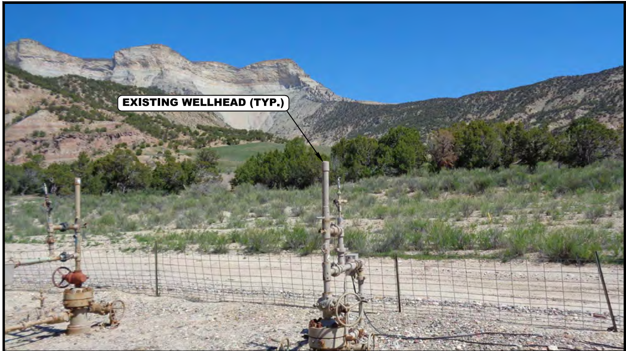
PHOTO: VIEW OF WELLHEADS