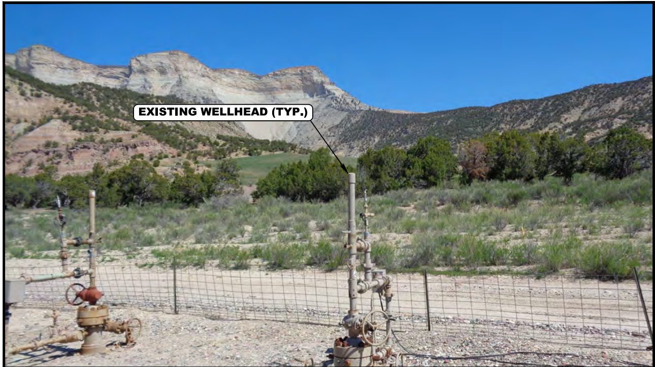
PHOTO: VIEW OF WELLHEADS