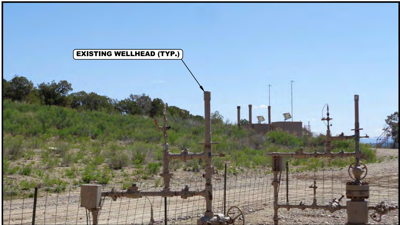
PHOTO: VIEW OF WELLHEADS