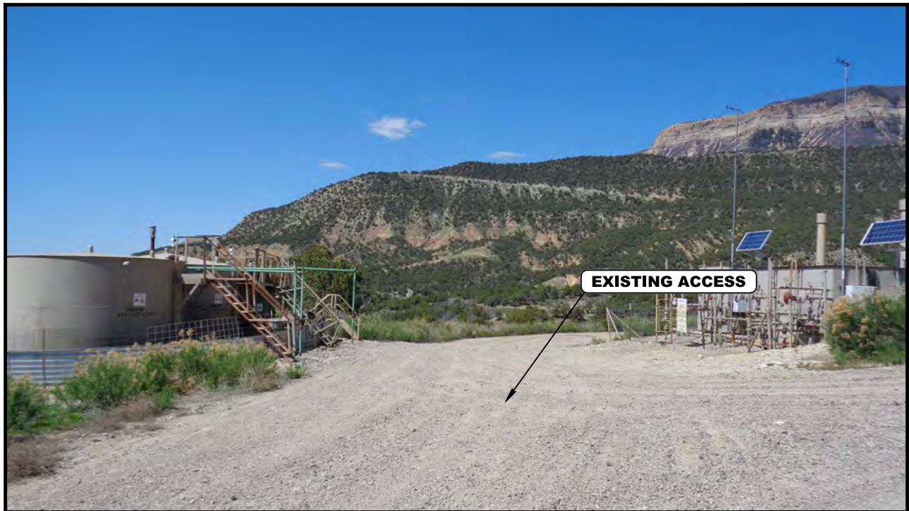
PHOTO: VIEW OF EXISTING ACCESS