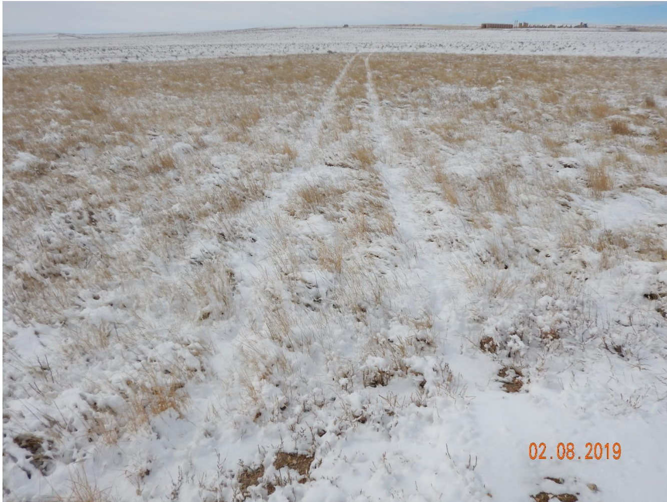
Photo 7: Photo taken from the southwest end of the location, facing southwest. Photo shows vehicle tracks over the interim areas from the pad. This does not comply with 1002.e, surface disturbance minimization.