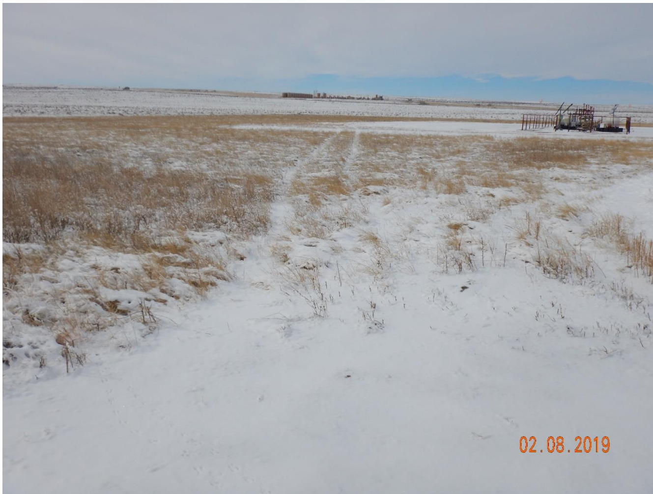
Photo 6: Photo taken from the east end of the location, facing west. Photo shows vehicle tracks over the interim areas, leading from the east end of the location to the southeast corner of the pad. This does not comply with 1002.e, surface disturbance minimization.