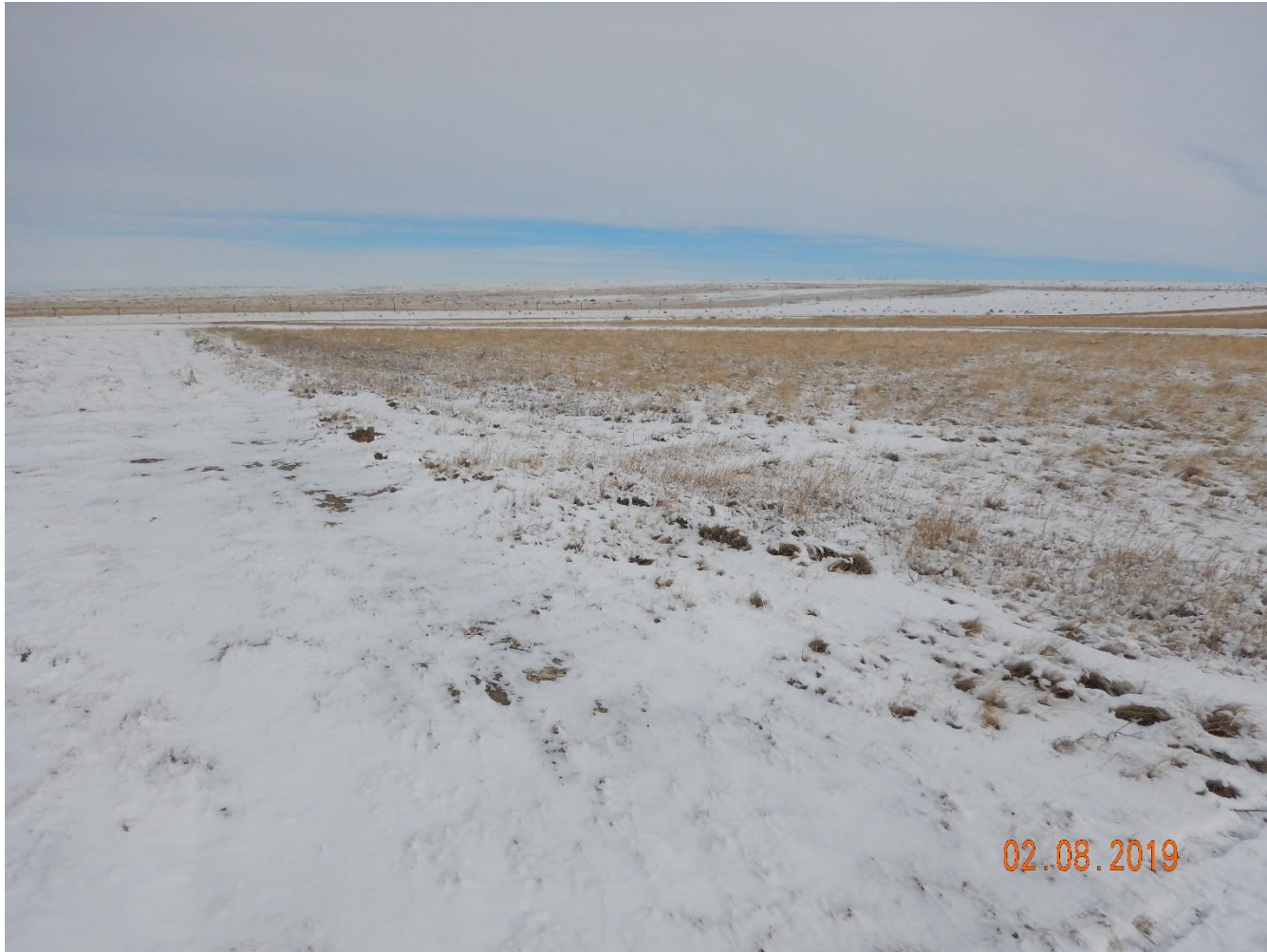
Photo 1: Photo taken from the west end of the location, facing north. Photos 1-4 provide an overview of the location from north, northeast, southeast to south.