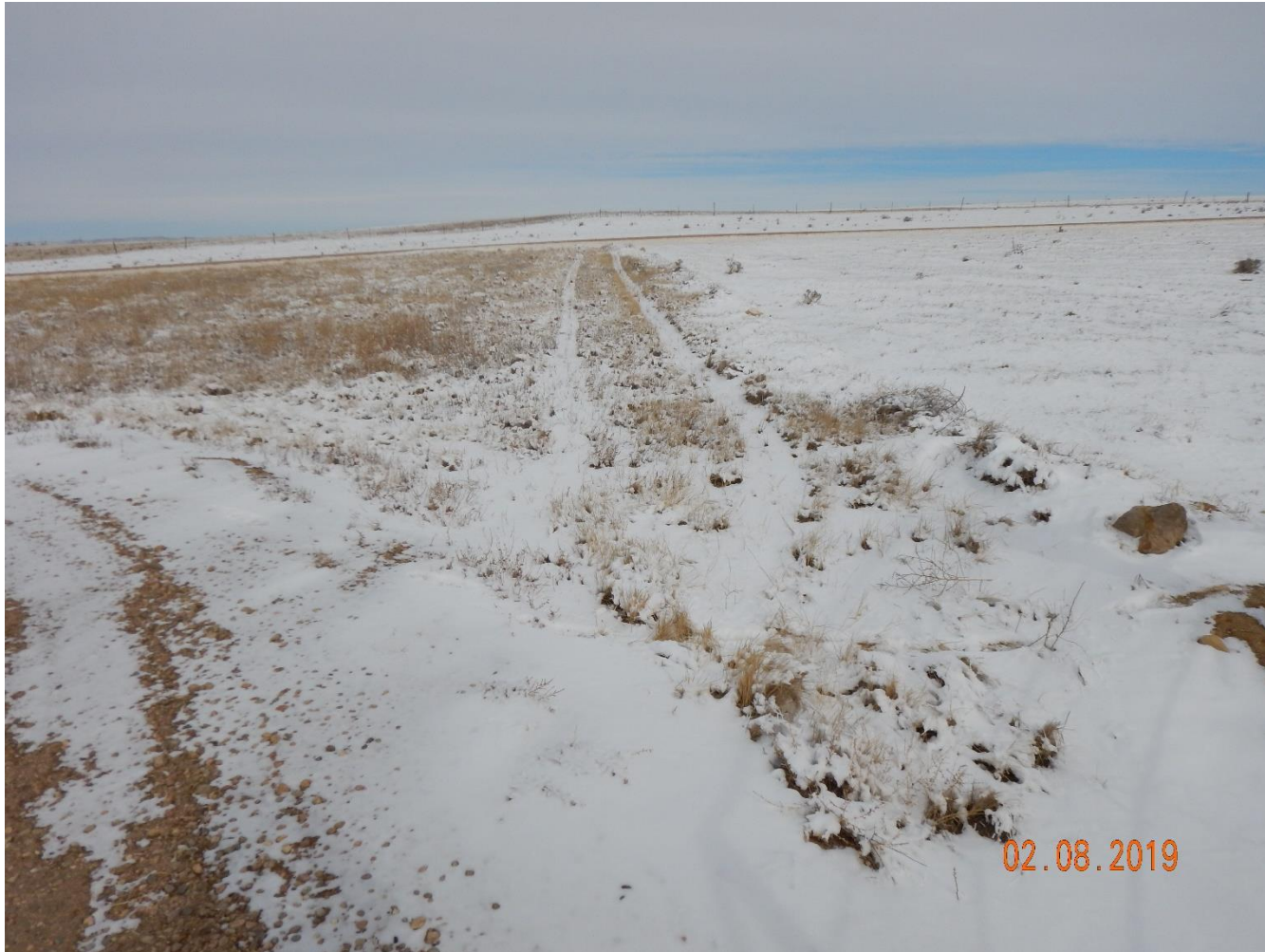
Photo 5: Photo taken from the east end of the location, facing north. Photo shows vehicle tracks over the interim areas, leading from the east end of the pad to the north. This does not comply with 1002.e, surface disturbance minimization.