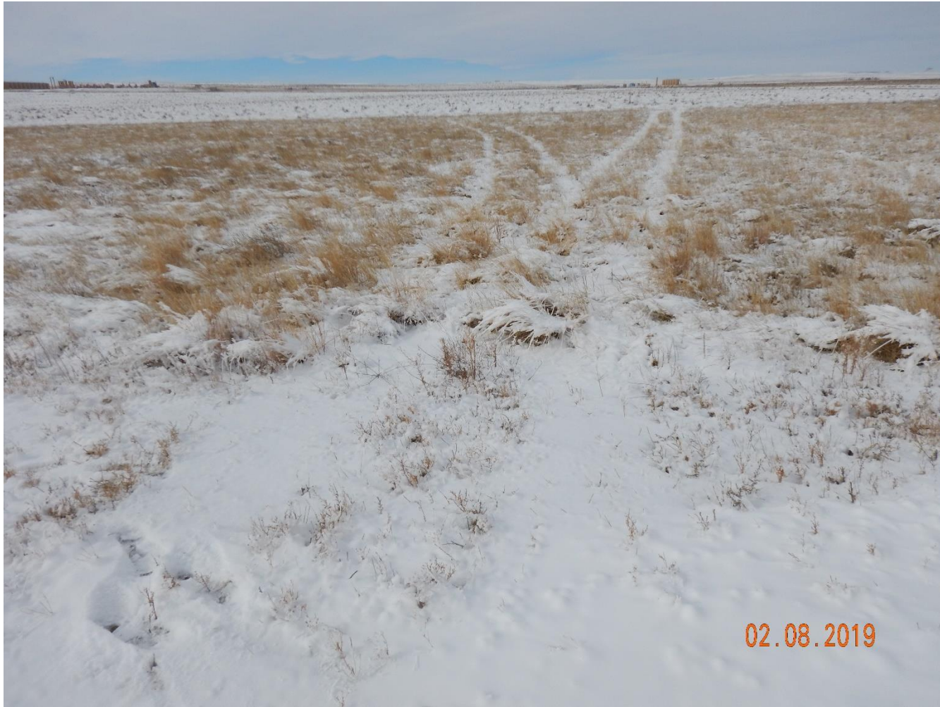
Photo 8: Photo taken from the west end of the pad, facing west. Photo shows vehicle tracks over the interim areas from the pad. This does not comply with 1002.e, surface disturbance minimization.