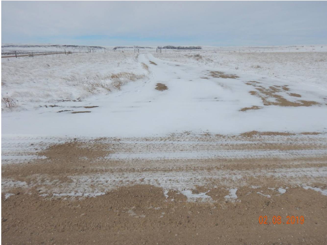
Photo 10: Photo taken from the south end of the location. Photo shows operator appears to have constructed an additional road through the location traveling west. This is being documented for future reclamation as road is not pre-existing, and not on the location drawing or access road map documents submitted by operator with the 2A.