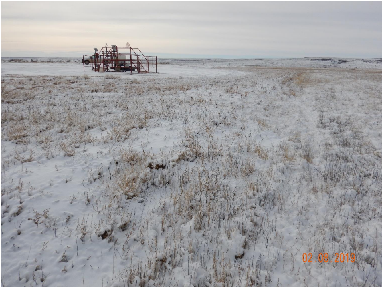
Photo 9: Photo taken from the north end of the location, facing south. Photo shows interim and production areas.