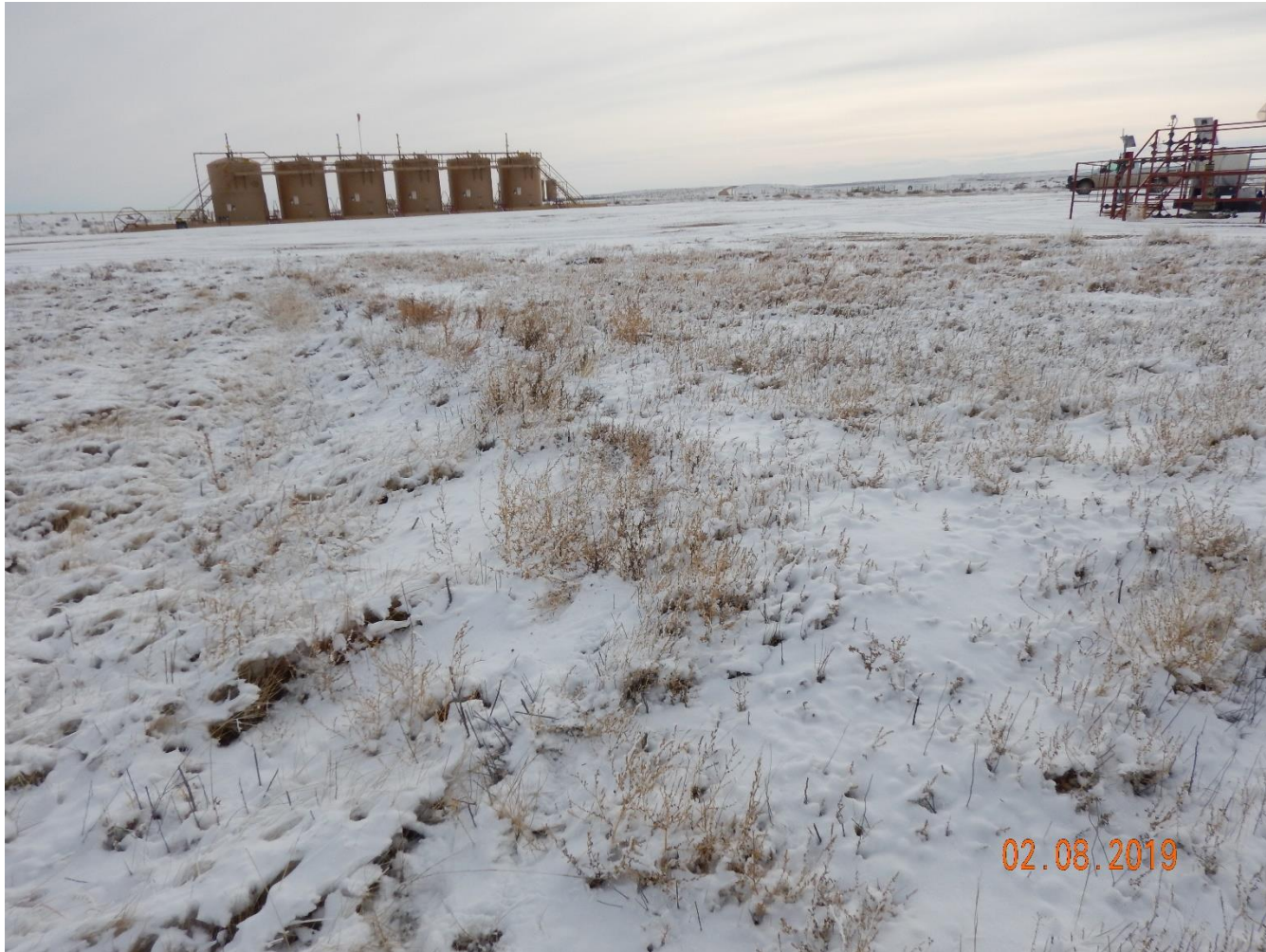
Photo 8: Photo taken from the north end of the location, facing southeast. Photo shows interim and production areas.