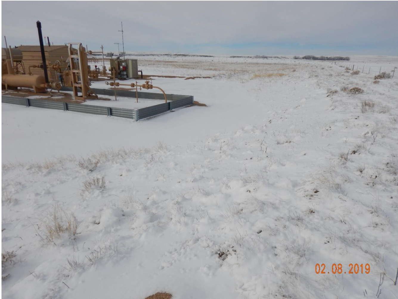
Photo 6: Photo taken from the northeast corner of the location, facing west. Photo shows interim and production areas.