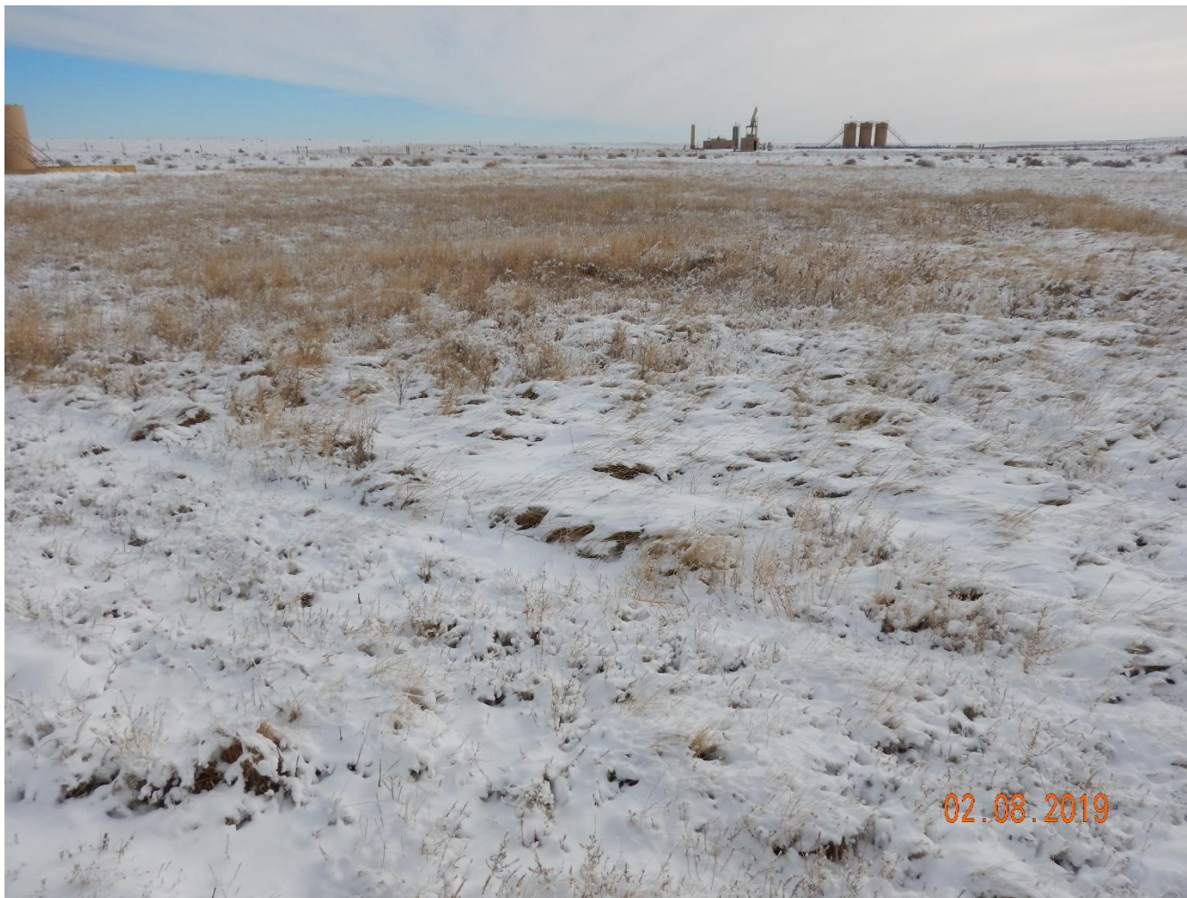
Photo 1: Photo taken from the south end of the location, facing east. Photos 1-4 provide an overview of the location from east, northeast, northwest to west.