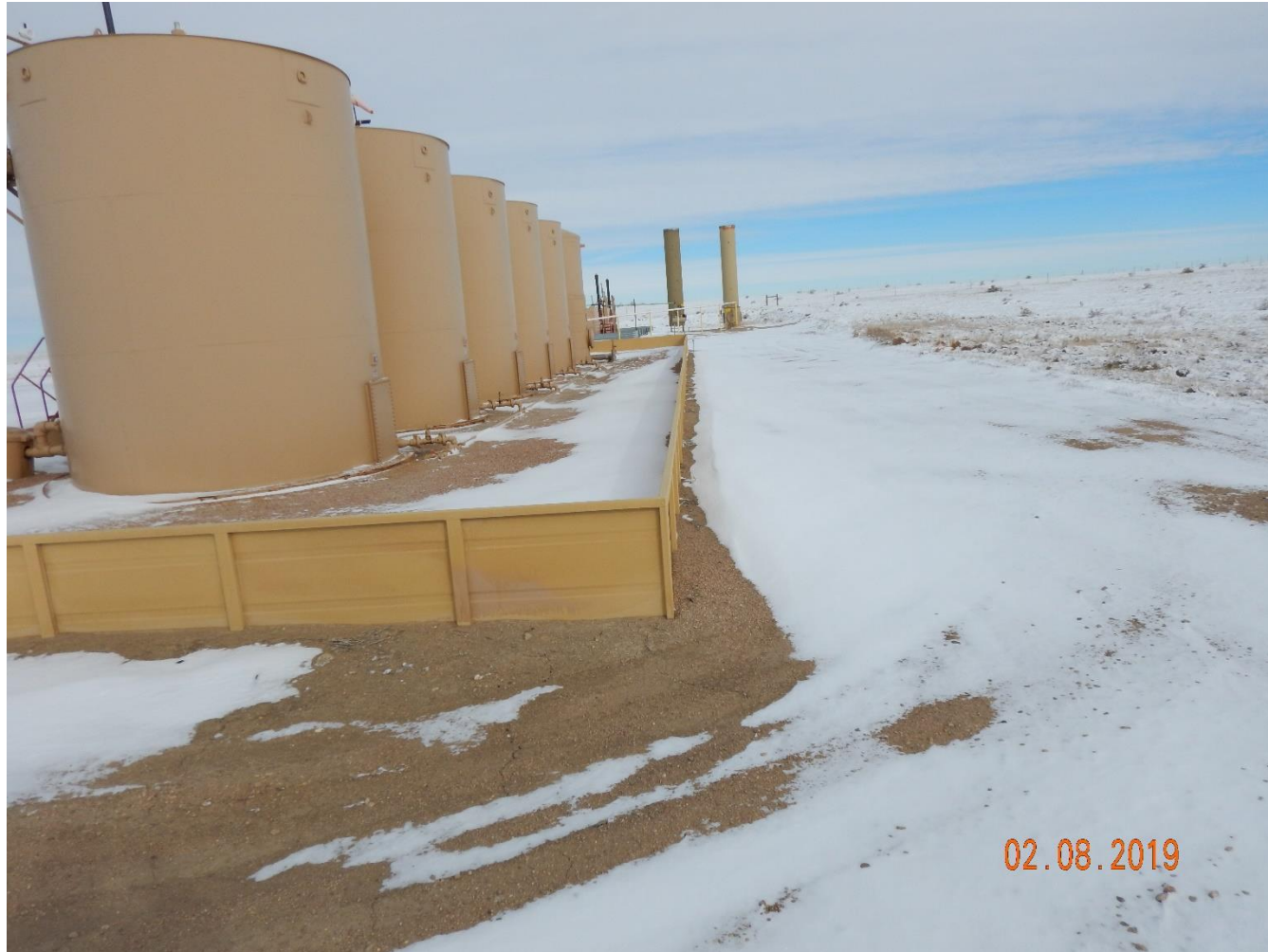
Photo 5: Photo taken from the east end of the location, facing north. Photo shows eastern perimeter of the location and equipment.