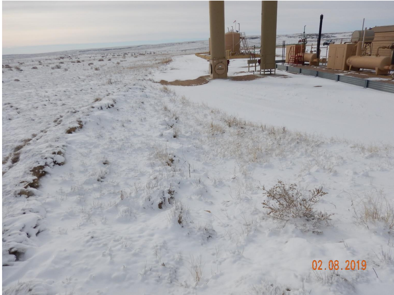
Photo 7: Photo taken from the northeast corner of the location, facing south. Photo shows interim and production areas.