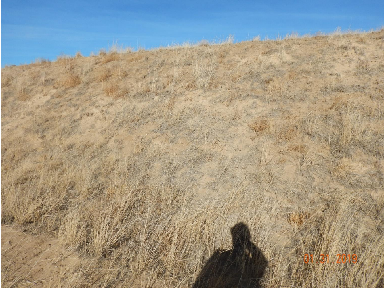
Photo 6: Photo taken from the soil stockpile on the west end of the location, facing north. Photo shows stormwater erosion degradation along slopes of soil stockpile.