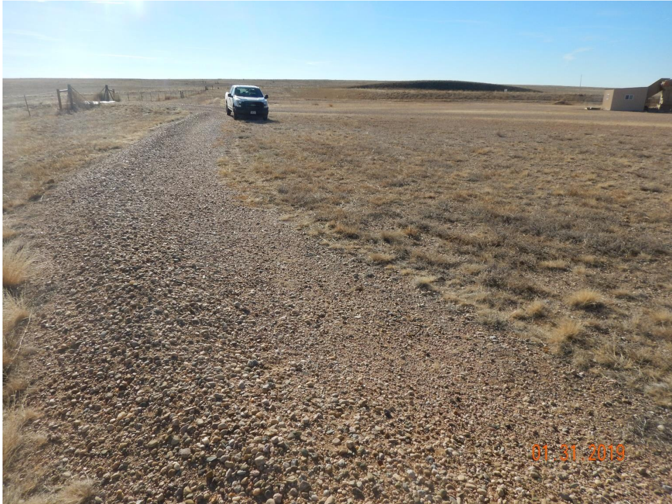
Photo 2: Photo taken from the nsoutheast end of the pad, facing west. Photos 2-5 provides and overview of the location from west, northwest to north. Photos also show interim reclamation has not been conducted in accordance with COGCC rule 1003.