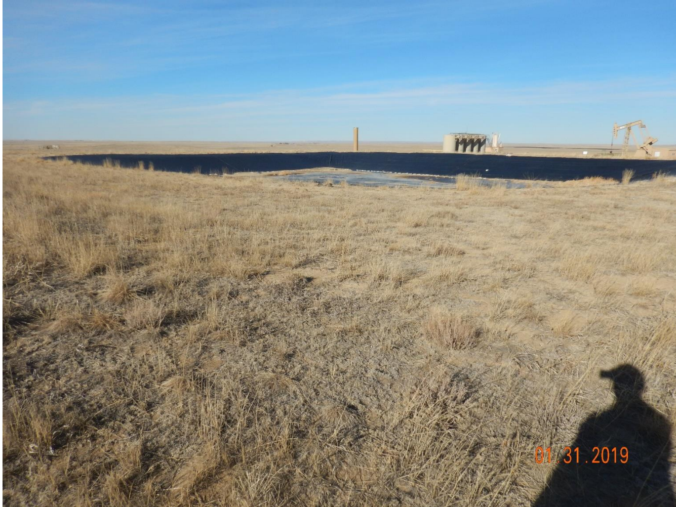
Photo 5: Photo taken from the south end of the pit #431610, facing northeast. Location received an approved 502.b variance to delay interim reclamation of the location for three (3) years until 12/03/2018. Photos shows pit has not been closed/reclaimed.